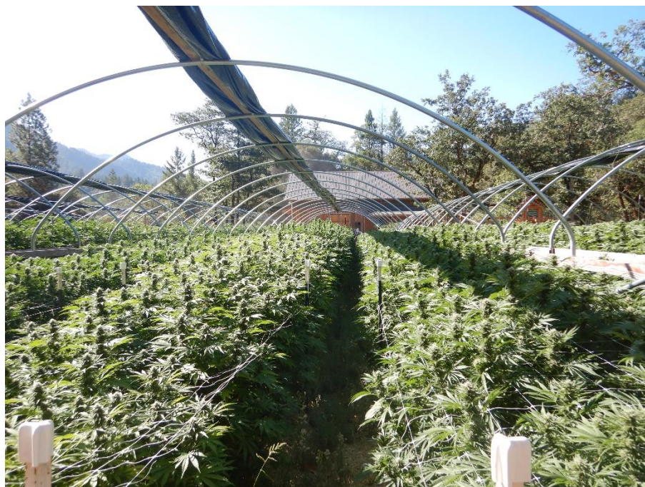
Photo 2—Looking south at cannabis cultivation area located at WQ 1.