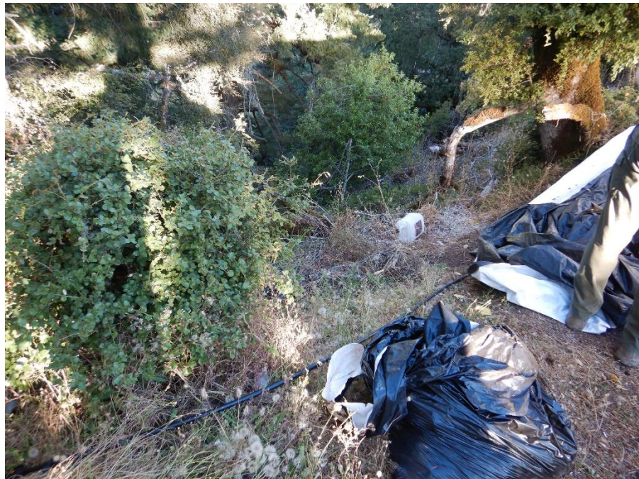
Photo 16—Taken July 20, 2020, uncontained cannabis cultivation waste including liquid nutrient container and plastic netting in the vicinity of WQ 2.