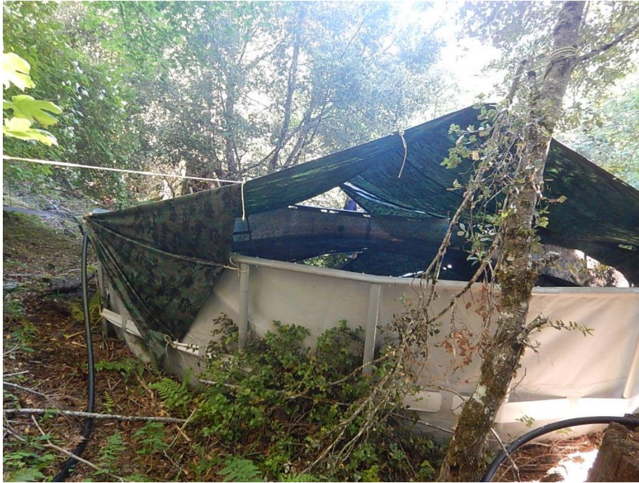
Photo 9—Taken June 27, 2019, water storage in above ground pool at WQ 4.