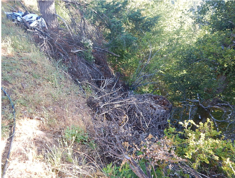
Photo 5—Taken June 27, 2019, plant stalks and other cannabis cultivation waste on the edge of cultivation area located in the vicinity of WQ 2.