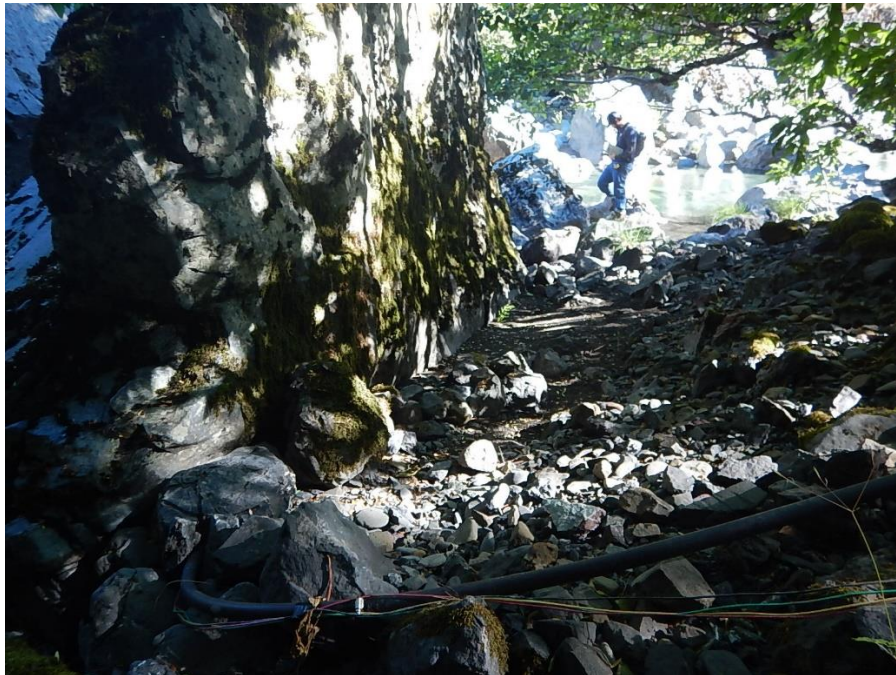
Photo 8—Taken June 27, 2019, shows water line leading from the Van Duzen to water storage located at WQ 4 pictured in Photo 9 below.