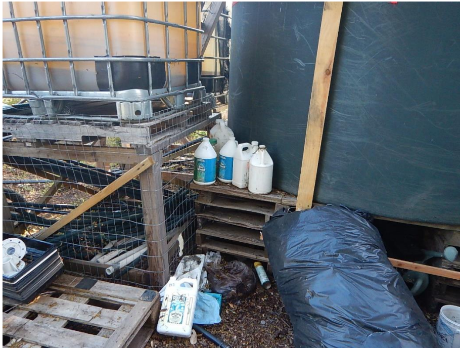
Photo 3—Taken June 27, 2019, uncontained fertilizers and liquid soil amendments in the vicinity of WQ 2.