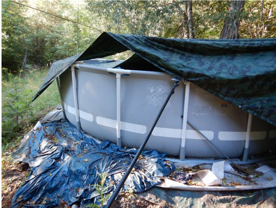
Photo 17—Taken July 20, 2020, water storage in above ground pool at WQ 4.