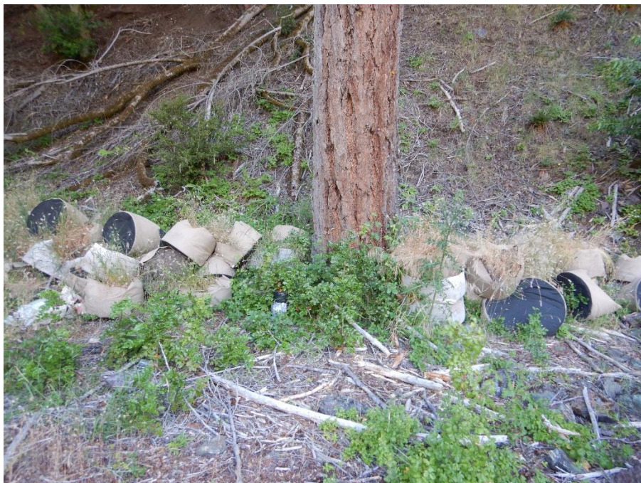
Photo 20—Taken July 20, 2020, cannabis cultivation waste including soil-filled felt planting pots and a capped five-gallon bucket with unknown contents in the vicinity of WQ 5.