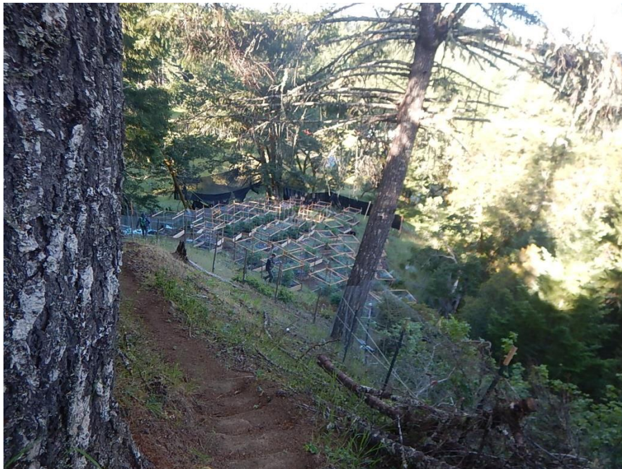
Photo 6—Taken June 27, 2019, Cannabis plants growing in raised beds in the vicinity of WQ 3.