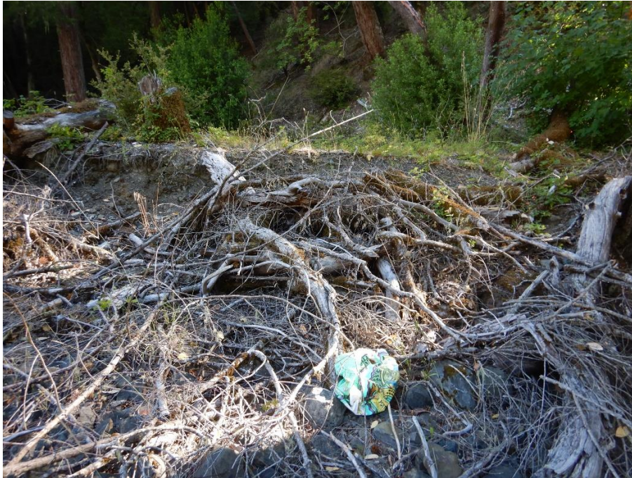
Photo 19—Taken July 20, 2020, cannabis cultivation waste at WQ 5 within 100 feet of the Van Duzen river.