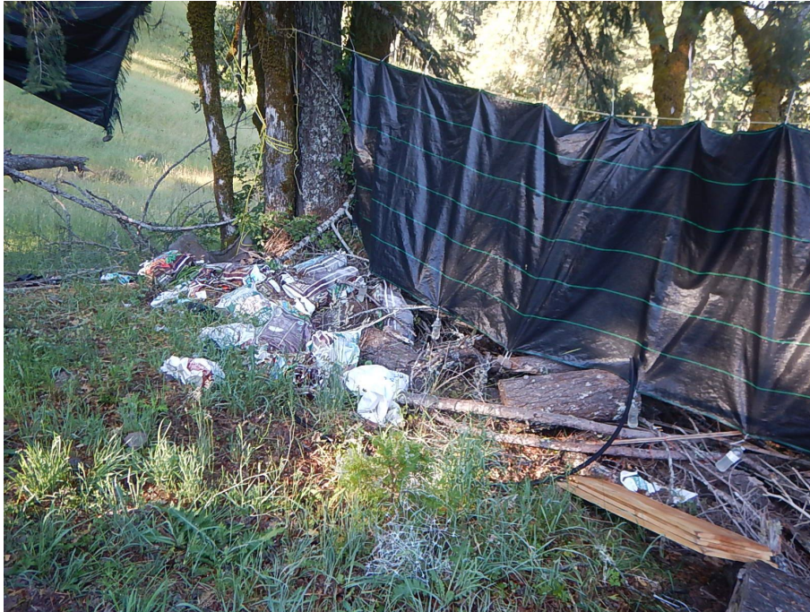
Photo 7—Taken June 27, 2019, uncontained cannabis cultivation waste including soil bags and plastic netting in the vicinity of WQ 3.