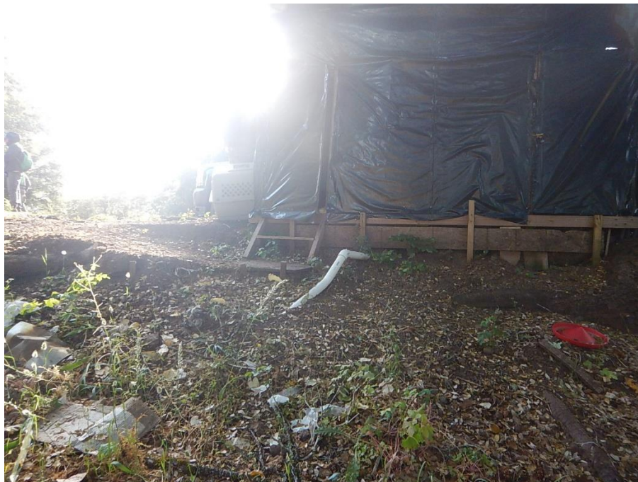
Photo 2—Taken June 27, 2019, plastic pipe leaving shed containing flush toilet and discharging to ground at WQ 1.