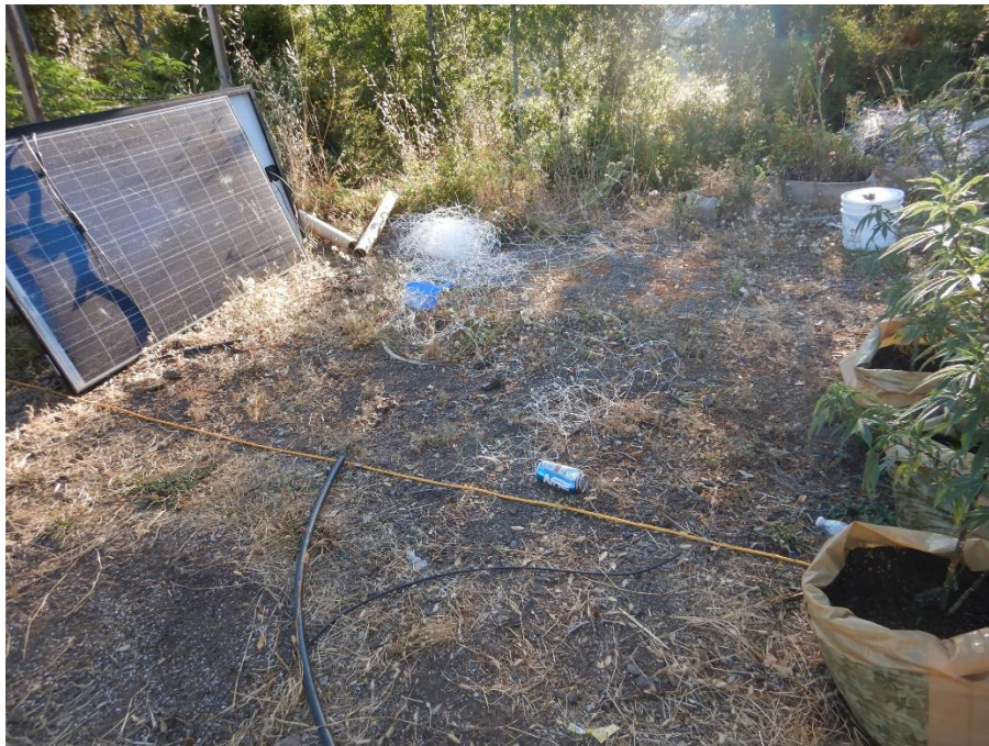
Photo 14—Taken July 20, 2020, uncontained cannabis cultivation waste including plastic netting in the vicinity of WQ 2.