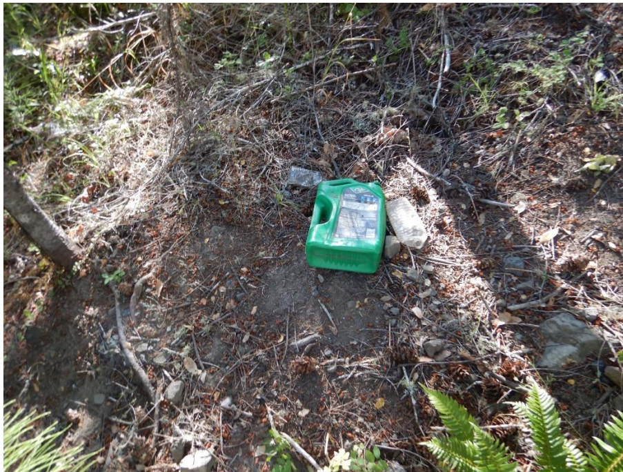
Photo 18—Taken July 20, 2020, waste motor oil container, uncontained, on bare ground in the vicinity of WQ 4.