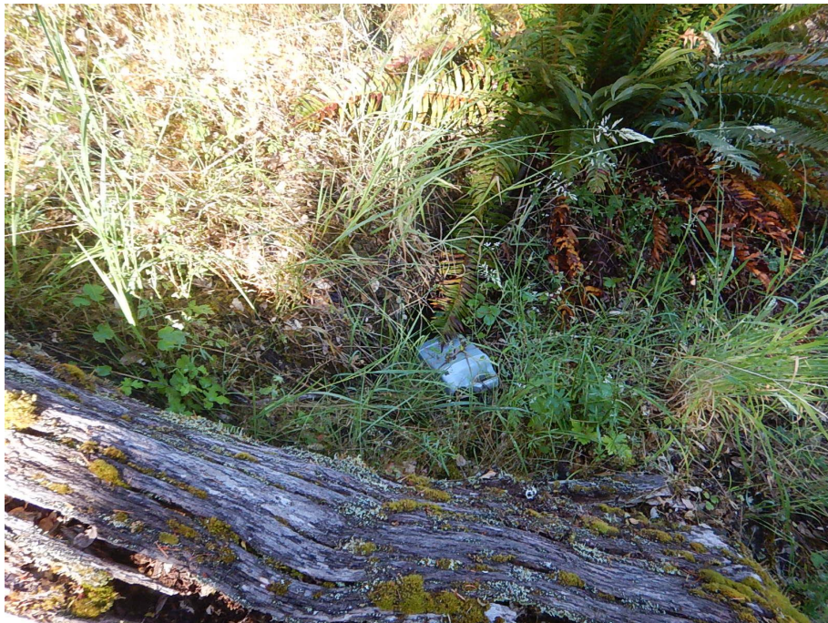
Photo 10—Taken June 27, 2019, waste motor oil container uncontained on bare ground in the vicinity of WQ 4.