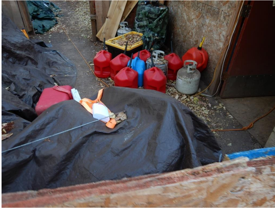
Photo 13—Taken July 20, 2020, uncontained fuel containers behind shed at WQ 1.