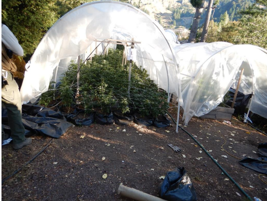
Photo 15—Taken July 20, 2020, cannabis cultivation in the vicinity of WQ 2.