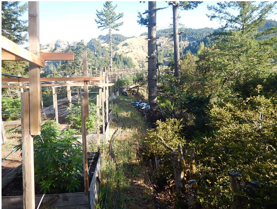
Photo 4—Taken June 27, 2019, cannabis plants growing outdoors in raised beds in the vicinity of WQ 2.