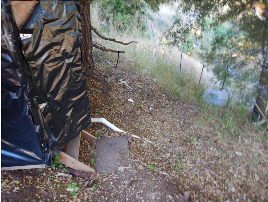
Photo 11—Taken July 20, 2020, plastic pipe leaving shed containing flush toilet and discharging to ground at WQ 1.