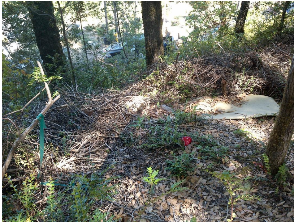
Photo 6—Cannabis cultivation waste in plant drying area located at WQ4.