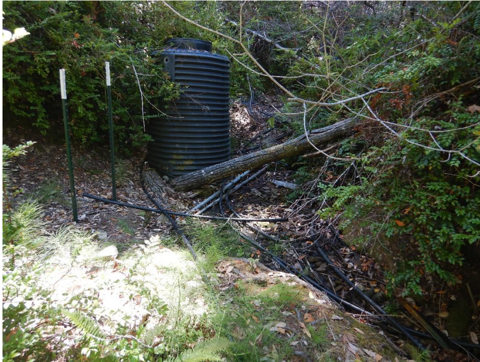
Photo 9—Watercourse located at WQ5. Water tank is visible within the banks of the watercourse, and several black plastic pipes run along the channel.