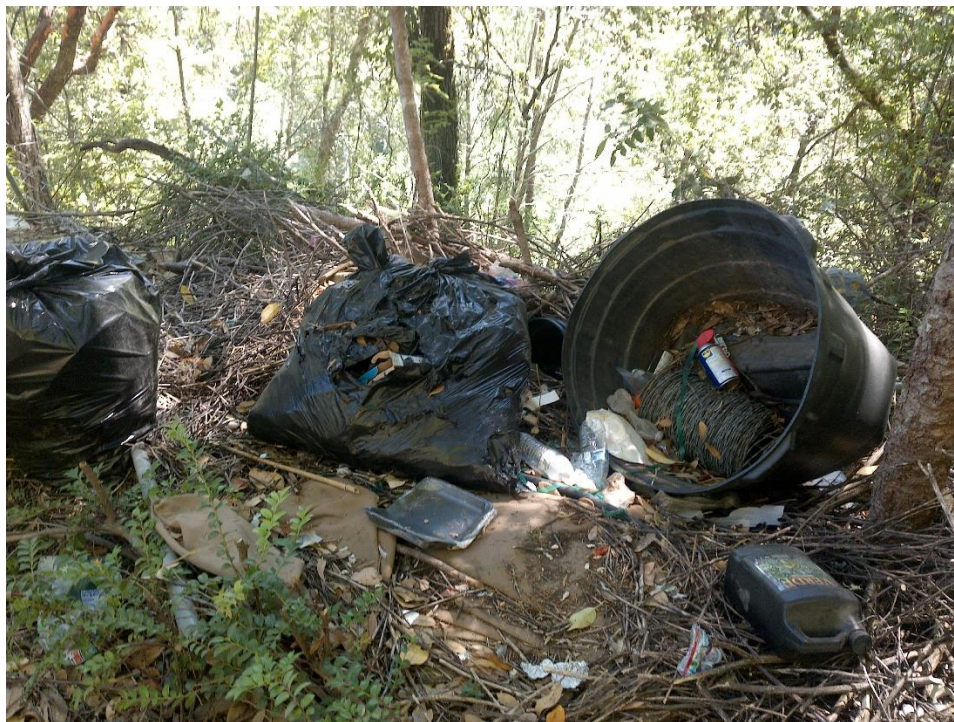
Photo 1—Looking east at cultivation waste located at WQ1. Waste is uncontained and perched above a steep hillside where it threatens to disperse offsite.