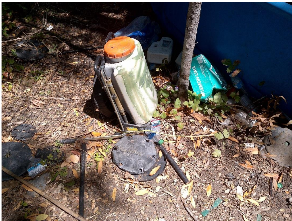
Photo 12—Backpack sprayer with unknown contents adjacent to pool at WQ6.