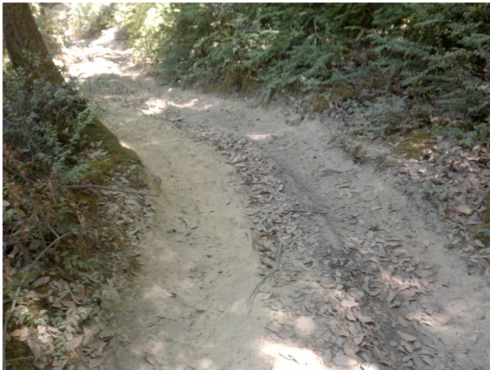
Photo 8— Road north of WQ3. The road is steep, rutted and lacks features to prevent stormwater from eroding the road surface.