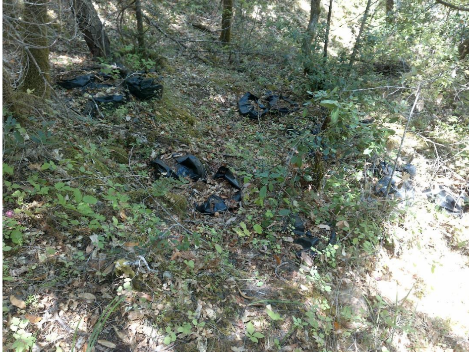
Photo 13—Waste black plastic bags with imported potting soils abandoned at WQ7.