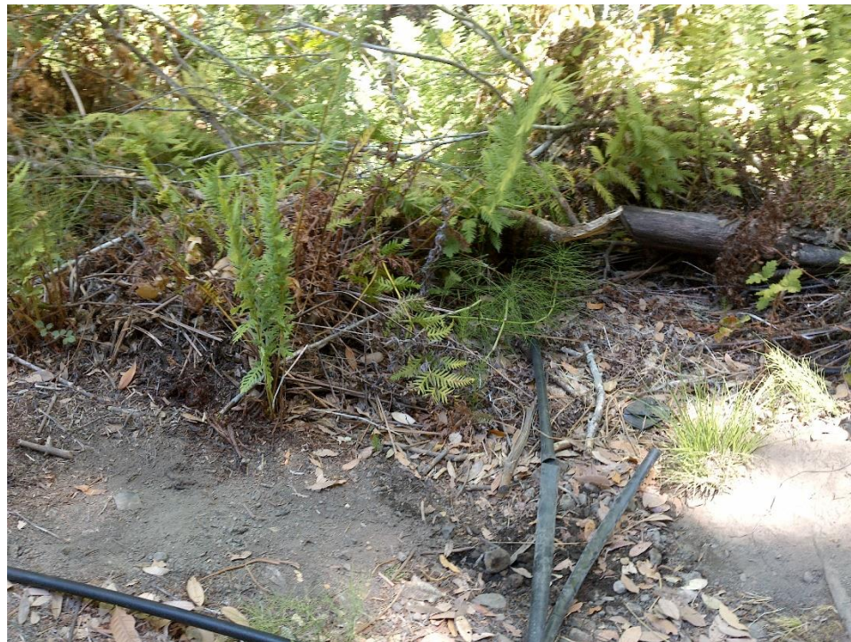
Photo 10—Watercourse in previous image crossing over the road surface north of WQ5.