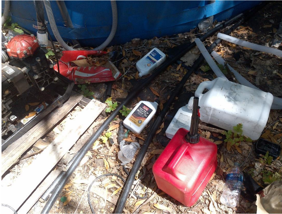
Photo 11—Above ground pool located at WQ6, used to store water for cannabis cultivation to the west. Waste pesticides, petroleum products and fertilizer containers litter the ground surrounding the pool.