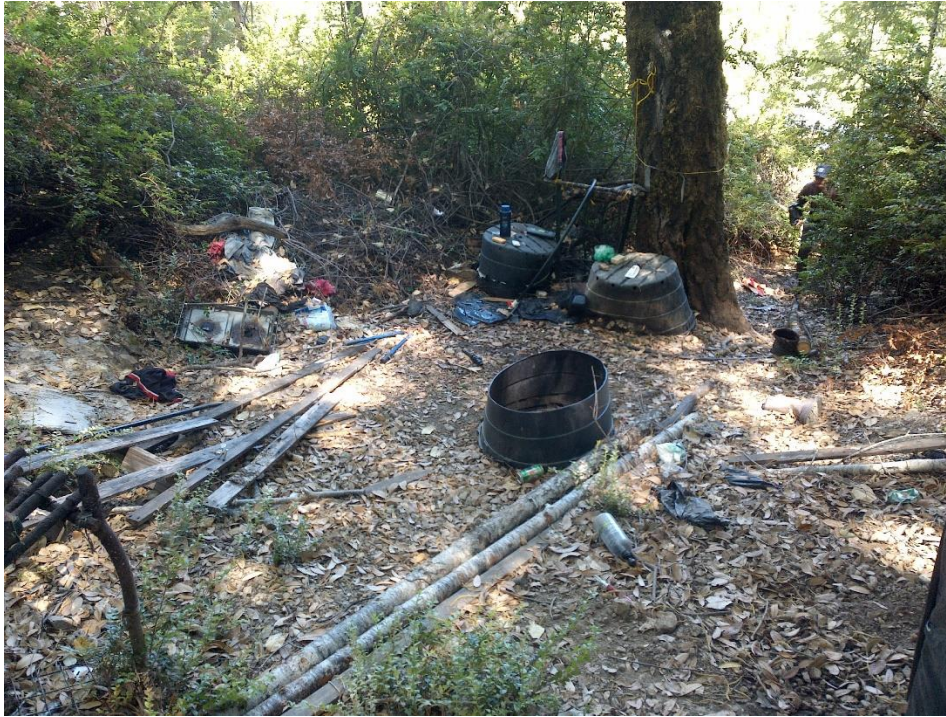
Photo 5—Cannabis cultivation waste in plant drying area located at WQ4.