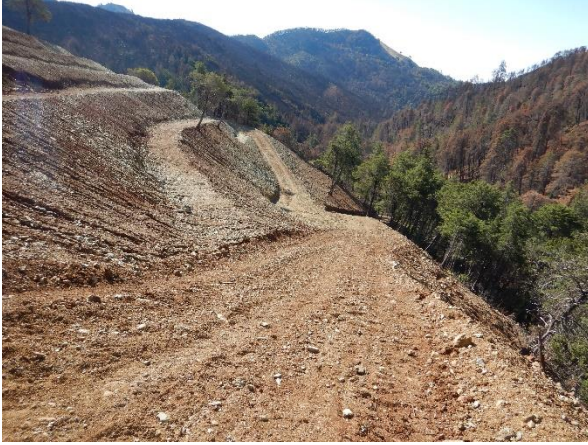
Photo 1: View of terracing and road construction area as seen from WQ1.