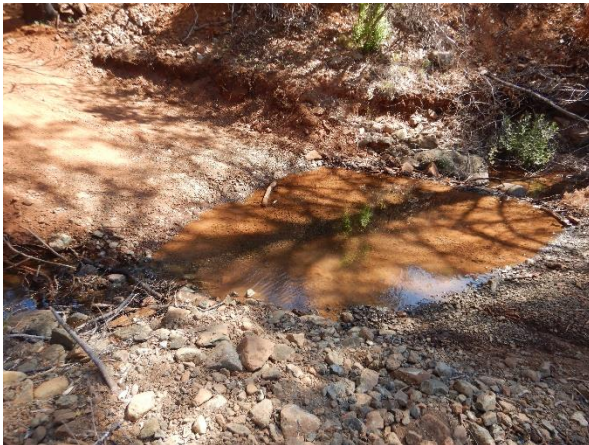
Photo 9: View of ford in class II tributary to East Austin Creek containing fine red sediment at WQ3.