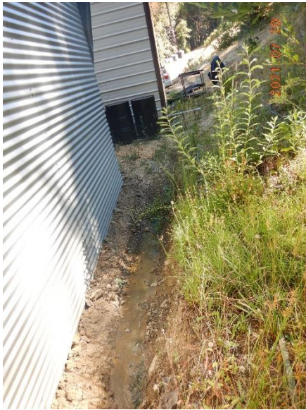
Figure 4. Water is pooled in the trench constructed around the backside of the fuel storage building.