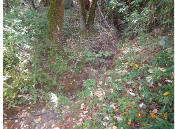
Figure 23. Behind the buildings, a watercourse leads upslope, with irrigation line running in it.