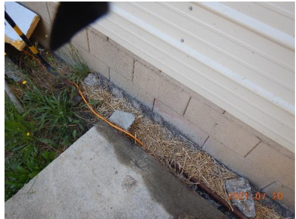
Figure 10. Outside the cultivation building, I observed fuel stains.