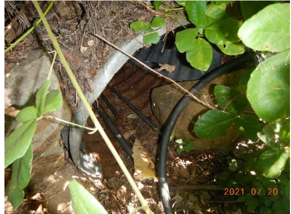
Figure 19. The watercourse at GPS 526 appears to be a Class III, and the crossing is a 24 inch corrugated metal pipe, with irrigations lines running through it. Photo shows inlet.