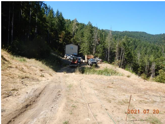
Figure 18. The driveway continues past the buildings, above the flat, and over a watercourse, around a bend and up to an upper flat. This photograph looking south toward the buildings. The watercourse crossing is located at the break between the sun and shaded portions of the photo.