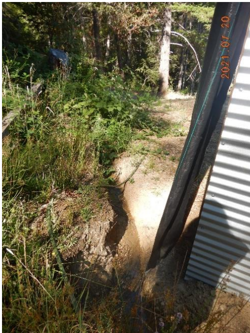
Figure 5. The trench routes water around the building to a roadside ditch.