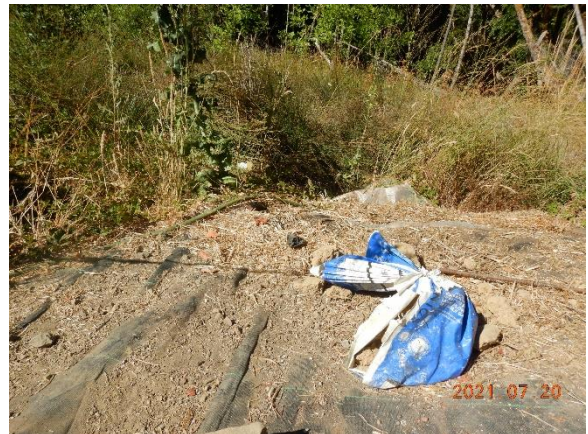
Figure 16. The slope adjacent to the fillslope is steep.