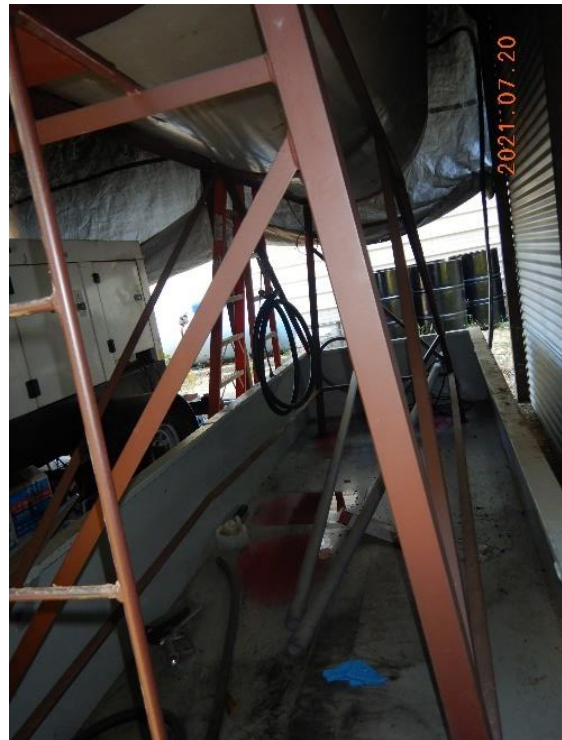
Figure 7. The interior of the fuel storage building, including above ground storage tanks and generator.