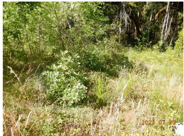
Figure 12. The south end of the lower flat is surrounded by hydrophytic