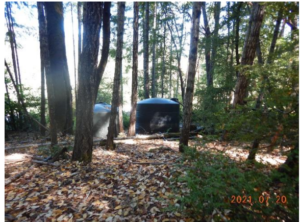
Figure 24. Water storage tanks are located on the slope above the buildings and are filled with a surface water diversion farther upslope, documented by inspectors from the California Department of Fish and Wildlife and the Division of Water Rights.