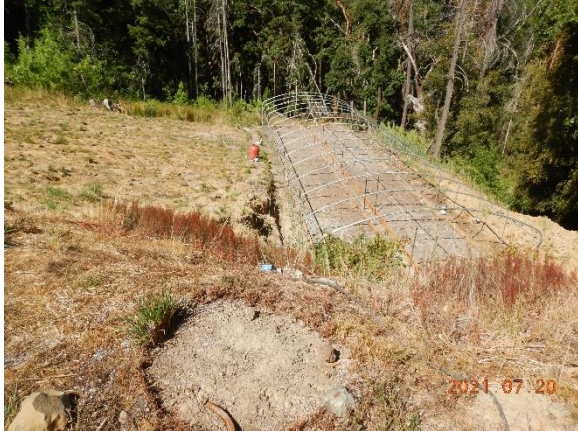
Figure 13. Looking from north to south at the lower flat, located below the building. The lush vegetation at the south end of the flat is below the seep described in WQ1. includes a hoop structure with cultivation beds, but no plants. The north end of the flat includes cut and fill construction.