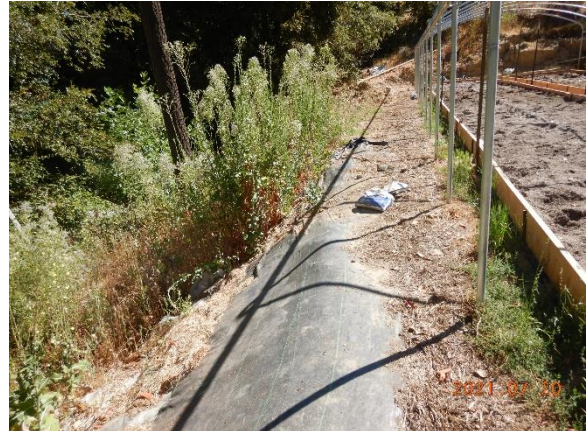
Figure 15. Between the beds and the top of the fillslope, pond liner is placed.