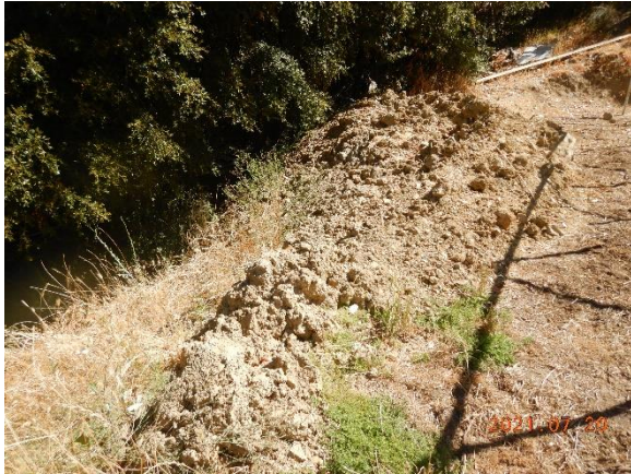
Figure 17. Spoils are placed at the top edge of the fillslope on the north end of the flat at GPS 525.