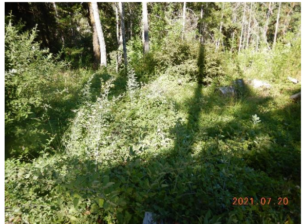
Figure 11. Below the buildings, vegetation is lush and green.