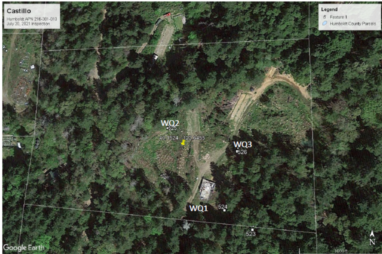
Figure 2. Inspection map of APN 216-381-013, with parcel boundaries, aerial imagery, location of GPS points, location of features of concern to water quality (WQ1-WQ3), as well a pin at the coordinates identified associated with the warrant.

WQ1: Building and Generator facilities built in seep wetland