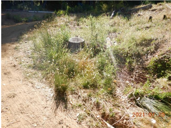
Figure 21. The road is hydrologically connected to the crossing and is dusty and unrocked.