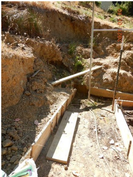
Figure 14. The cut bank is overly steep and eroding.