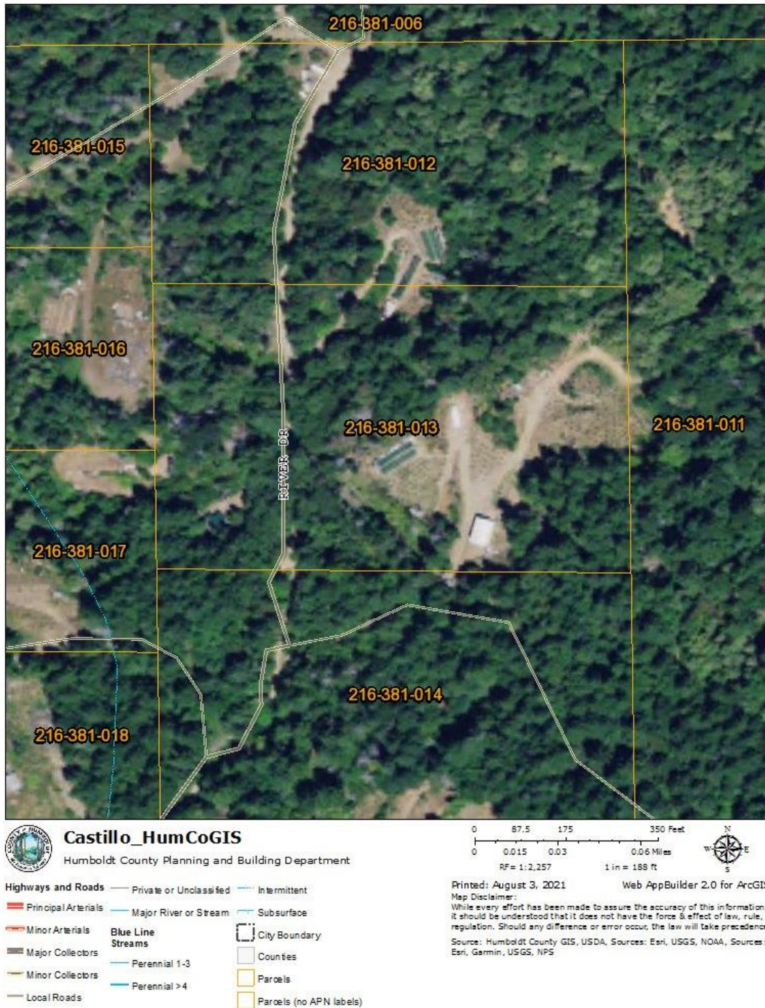
Figure 1. Map with aerial imagery, Humboldt County parcels including APN 216-381-013, roads and watercourses.