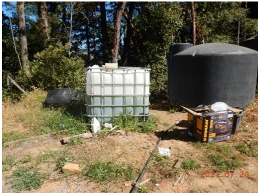
Figure 22. Feed tanks are located at the edge of the slope that goes down toward the parcel to the north.