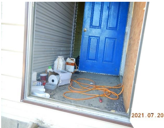
Figure 9. The cultivation building did not contain any growing plants but did have cultivation-related infrastructure and storage.