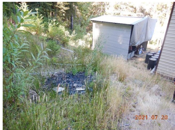
Figure 3. The seep supports hydrophytic vegetation; the buildings are built in the flowpath (WQ1).

WQ1: Building and Generator facilities built in seep wetland