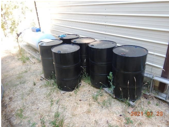
Figure 8. Storage barrels are located between the buildings outside.