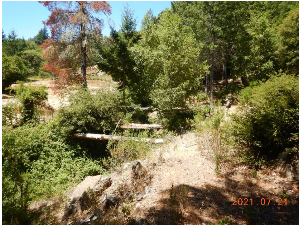
Photo 3—Looking west from road in the vicinity of WQ2. Log bridges are visible crossing the gully/watercourse from the road to a historical cultivation area in the left of the image.