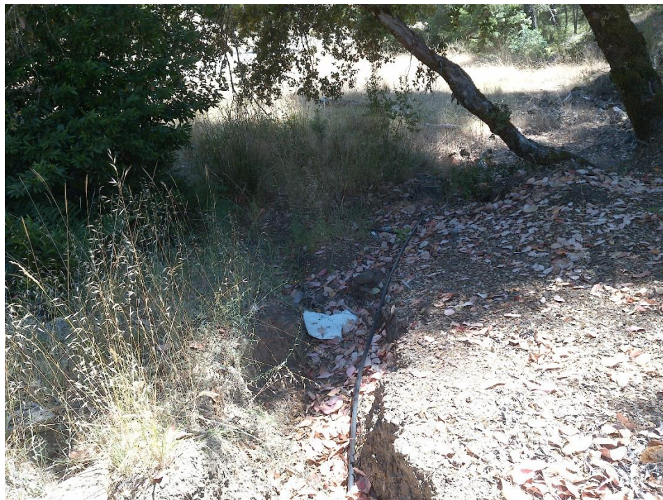
Photo 10—Looking downstream from where road fords watercourse at WQ6. A piece of refuse is visible within the channel.