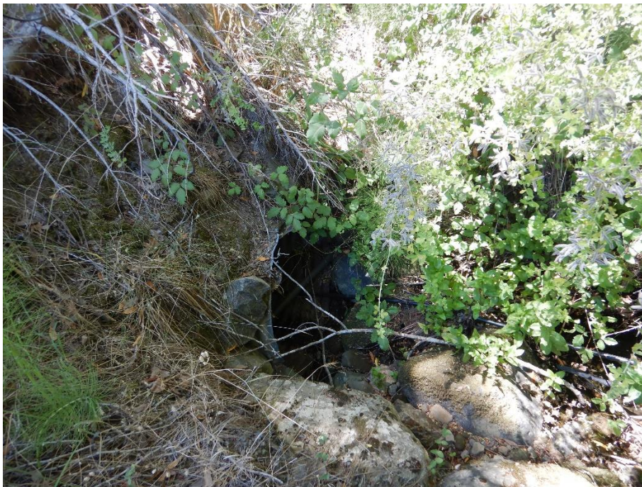
Photo 6—Stream crossing at WQ3. The culvert is three feet in diameter, which is substantially narrower than the bank-full width of the channel upstream.