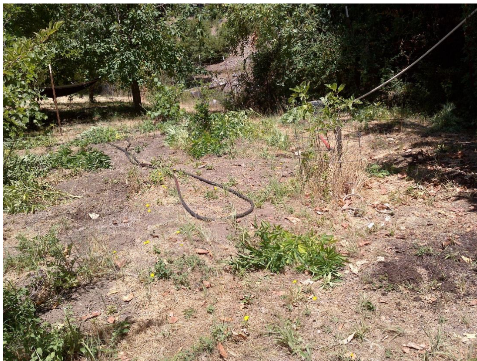
Photo 7—Recently cut cannabis plants growing in the vicinity of WQ4. The existing cannabis cultivation area may have been less than 1,000 square feet.