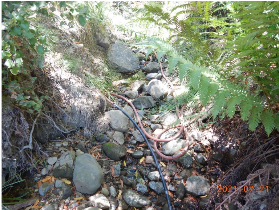
Photo 5—Watercourse adjacent to generator pictured in previous image. I measured a bank-full width of six feet with a tape measure. The channel bed is comprised of rounded small boulders and cobbles and has a trickle of flowing water.