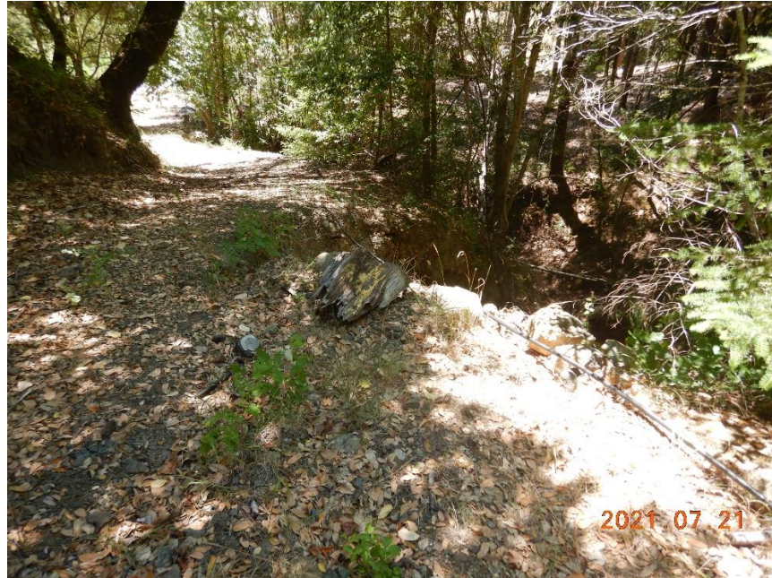
Photo 1—Looking south where road prism is eroding and delivering sediment to the topographic gully visible in the right of the image. The road to the back of the photographer is shaped such that stormwater collects and concentrates at the edge of the road. The gully is tributary to Kinsey creek.