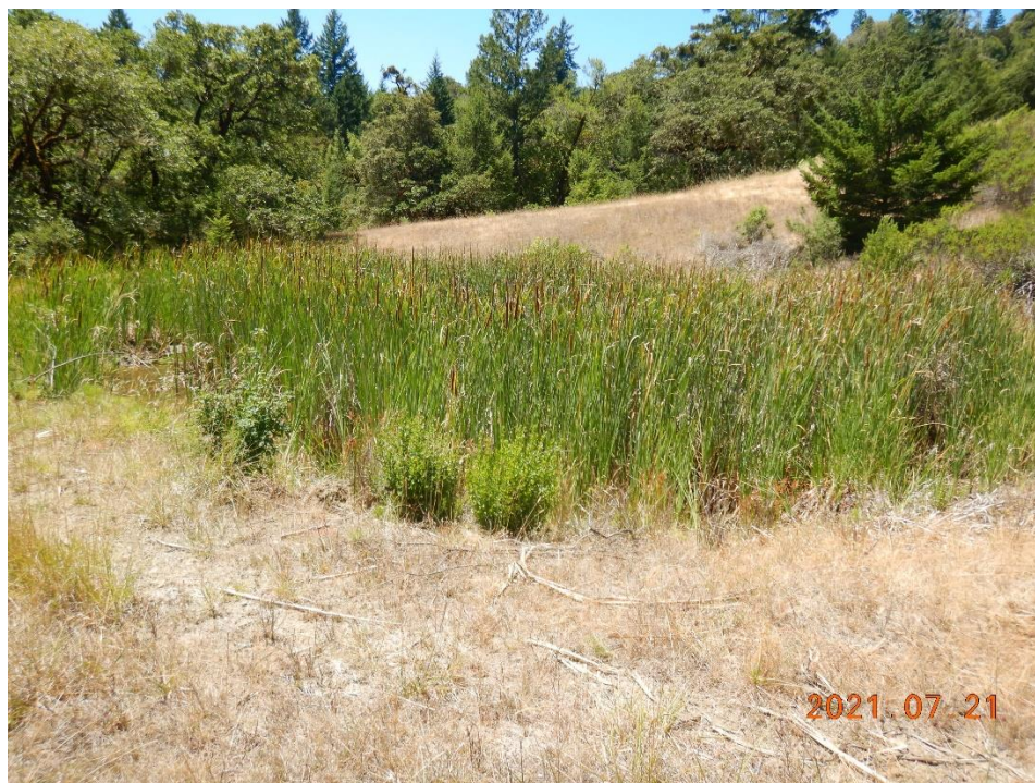
Photo 8—Reservoir at WQ5. The impounding berm is approximately ten feet wide and I was unable to identify an overflow structure or outlet pipe.