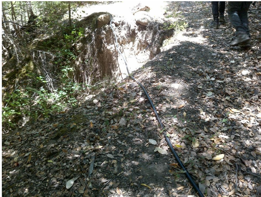
Photo 2—Looking north and upslope at eroding road prism pictured in previous image.