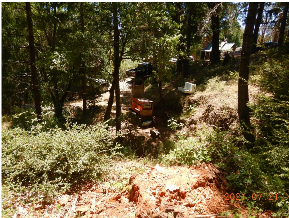
Photo 4—Looking south at a generator in the vicinity of WQ2. The generator is adjacent to the gully/watercourse pictured in the center of the image.