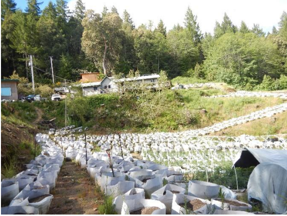
Photo 1: View of cultivation area CA looking towards the residence.