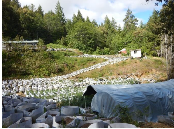
Photo 2: View of cultivation area CA looking towards the residence and pond.