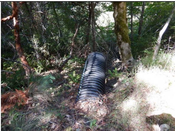
Photo 11: an improperly installed culverted stream crossing draining a spring and a drainage ditch at WQ11