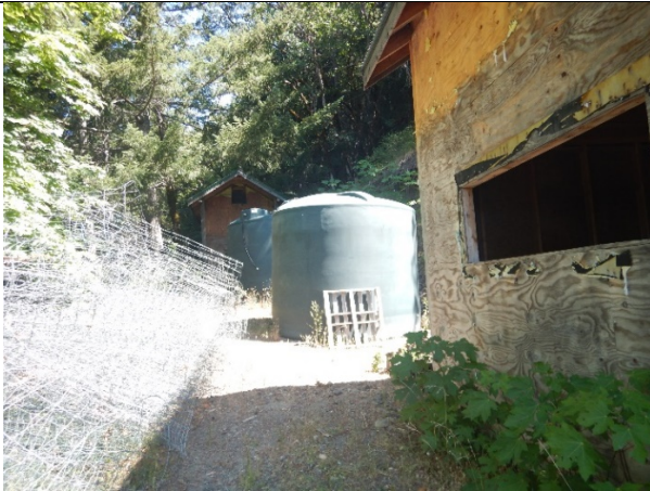
Photo 9: water storage tanks at WQ9