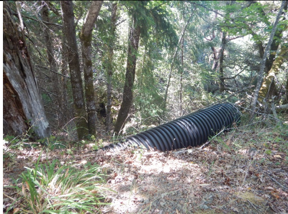
Photo 2: culverted stream crossing skewed and installed high in the fill at WQ2