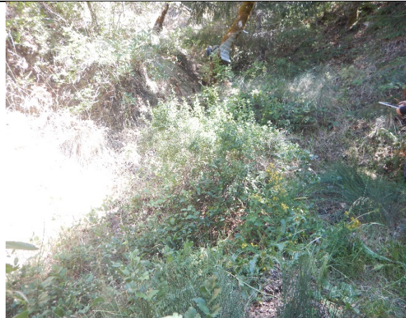
Photo 10: a fill stream crossing at an old logging road at WQ10.