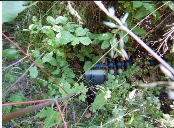
Photo 4: culverted stream crossing skewed and installed high in the fill at WQ4