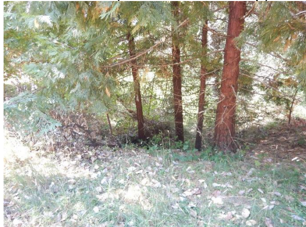
Photo 16: Downstream view of the Class III watercourse (CIII on the Site Map).