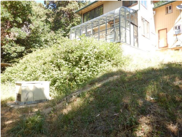
Photo 21: South side of the residence, Class III watercourse, and generator.