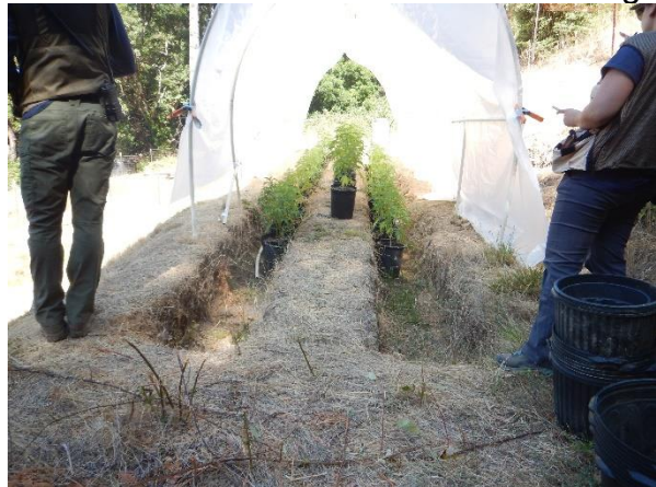
Photo 4: View of the greenhouse at CA1 with active cannabis cultivation occurring.