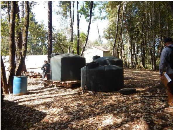
Photo 17: Water storage tanks (TANK1) located at cultivation area CA2.