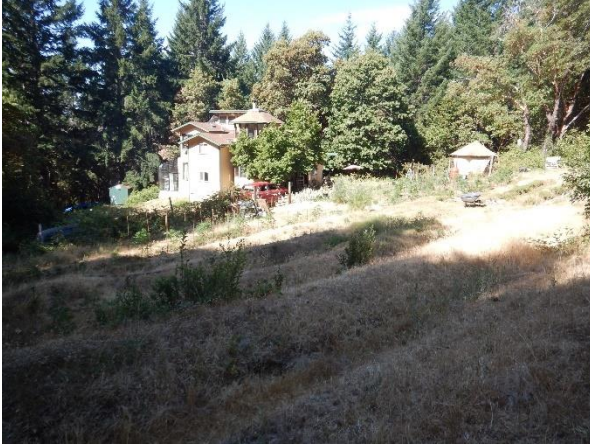
Photo 1: View of cultivation area CA1 looking down from the greenhouse.