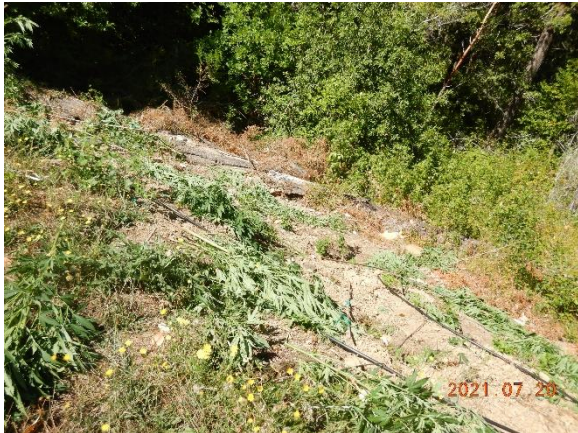
Figure 5. Outdoor cultivation.