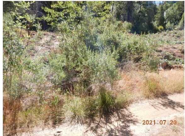
Figure 8. A class watercourse is crossed by the driveway and has a 24" corrugated metal pipe for a culvert. The cultivation is within ten feet of the watercourse on either side.