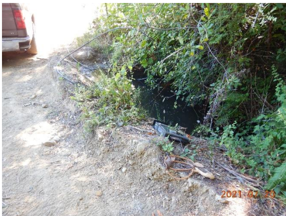
Figure 3. An exposed seep along a cutbank of driveway is used for diversion.