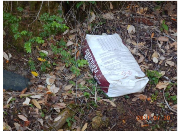
Figure 7. High concentration water soluble fertilizer on ground.