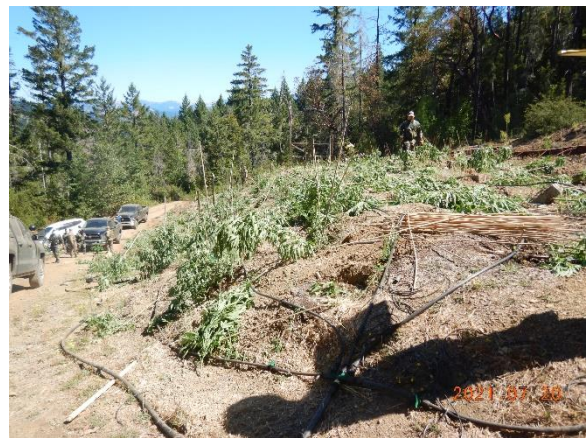
Figure 4. An outdoor cultivation area is located above and below the driveway.