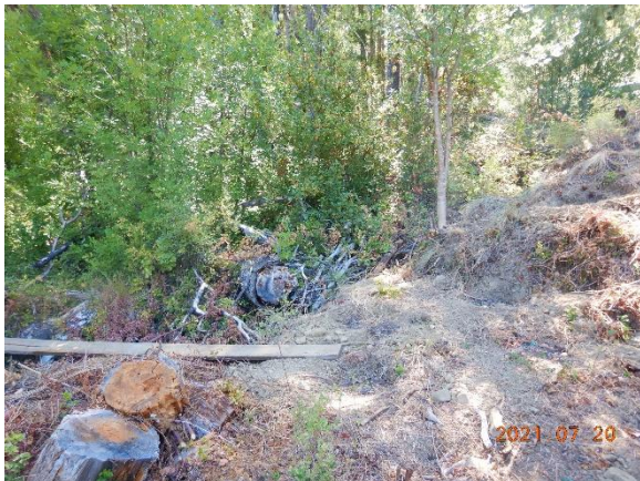
Figure 6. The cultivation area extends within 10 feet of watercourse and debris is pushed toward watercourse. The watercourse is located along the northern boundary of the parcel, shown here on left.