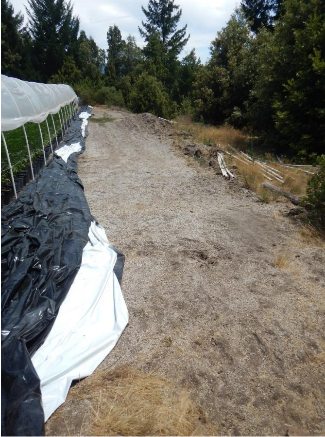
Photo 5: LL3: Potting soil spread and mounded around cultivation area