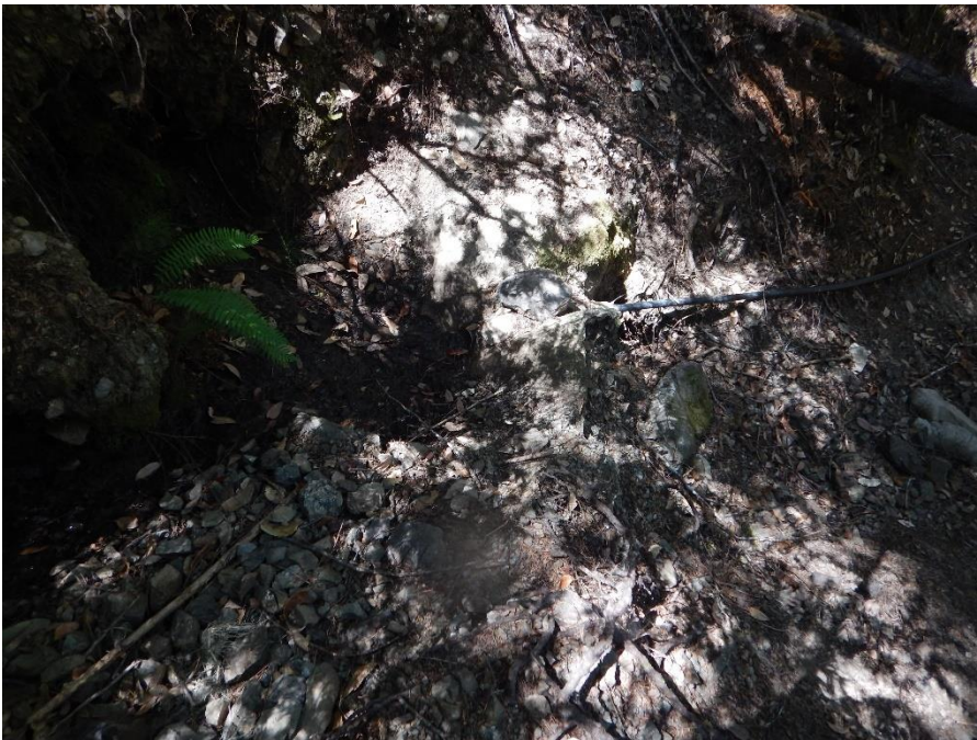
Photo 12: LL9: Second black polyline diversion point. The upstream channel on the left side is wet, while the downstream channel on the right is dry