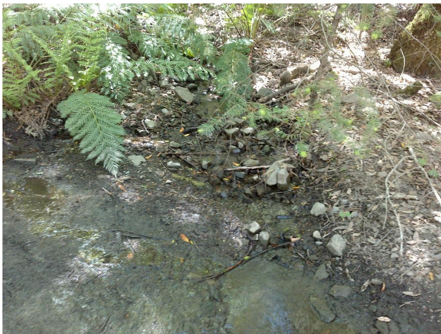
Photo 5—Looking west where watercourse meets upslope edge of road at WQ3.