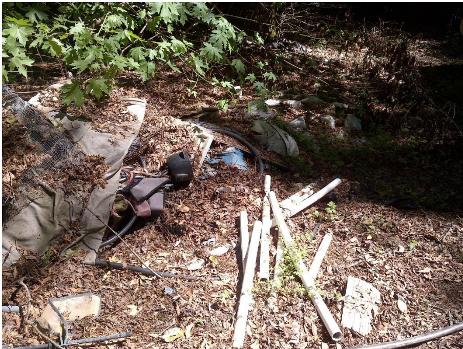
Photo 2—Pile of refuse within 50 feet of watercourse pictured in previous image.