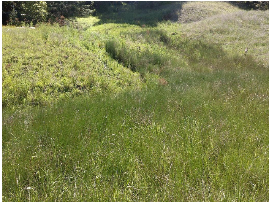
Photo 12—Looking north at suspected wetlands from same location as previous image. Plant genus Juncus dominates the vegetation in the middle of the image.