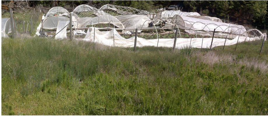
Photo 11—Looking east at cultivation area constructed in suspected wetlands at WQ5. Plant genera Juncus and Equisetum are visible growing at the borders of the cultivation area.