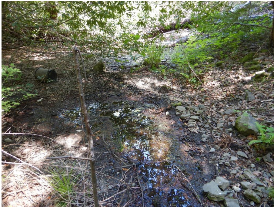
Photo 1—Watercourse in the vicinity of WQ 1. Pooled water is visible in the watercourse and a waste plastic pot is visible in the left of the image.