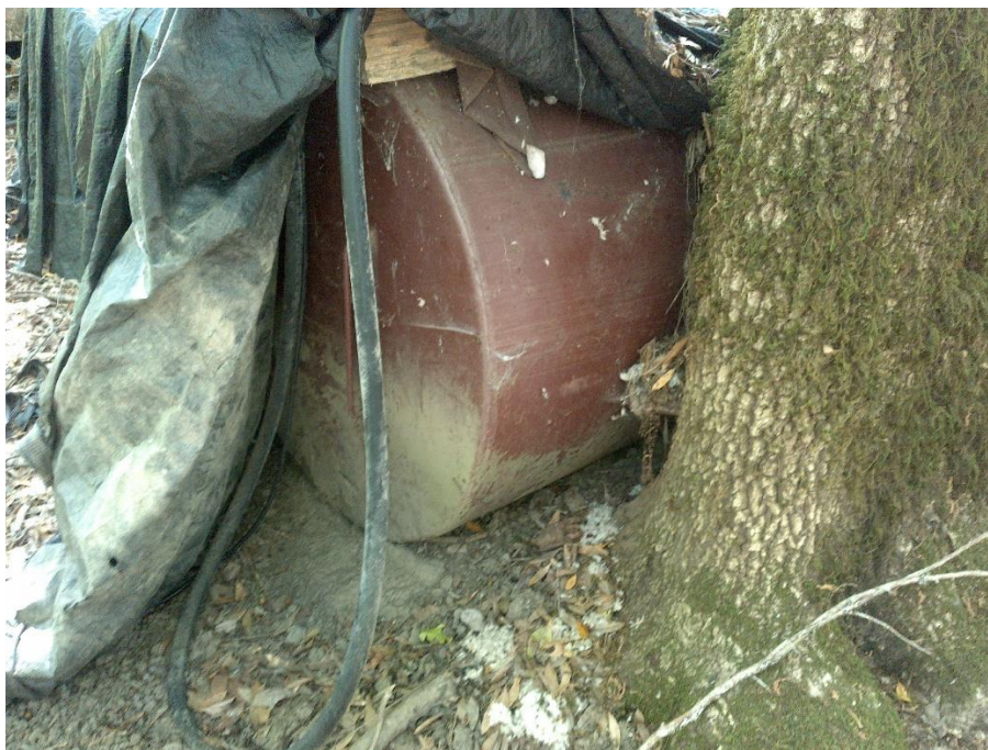
Photo 3—Diesel fuel tank without secondary containment located at WQ2