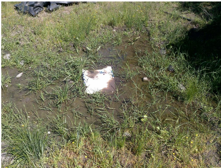
Photo 14—Waste plastic bag formerly containing high-concentration nutrients is sitting in pooled water in the vicinity of WQ6. The pooled water runs off into suspected wetlands to the north.