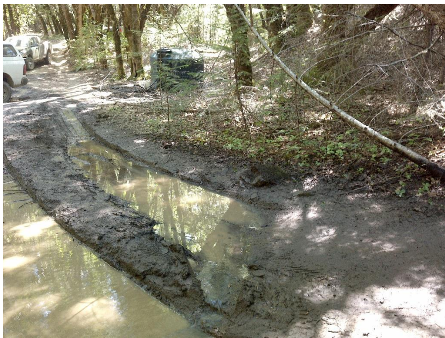
Photo 8—Runoff from overflowing tank, in back left of image, pools on road in foreground of image.