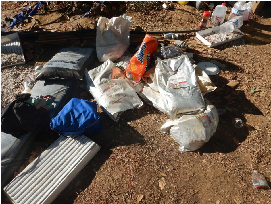
Photo 4—Refuse associated with cannabis cultivation in the vicinity of WQ1.