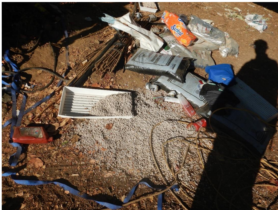
Photo 5—Refuse associated with cannabis cultivation in the vicinity of WQ1.