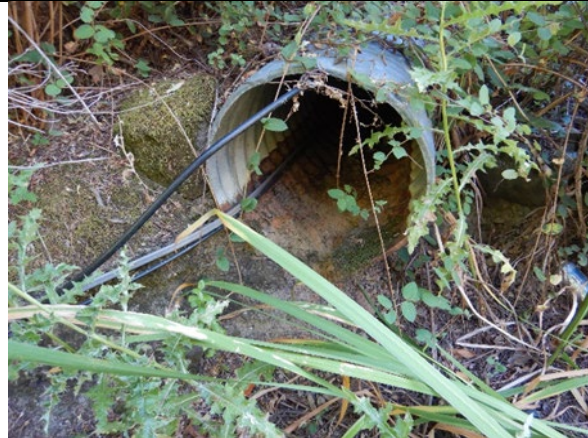
Photo 14: rusted culvert overflow of the ponded wetland above at WQ10.