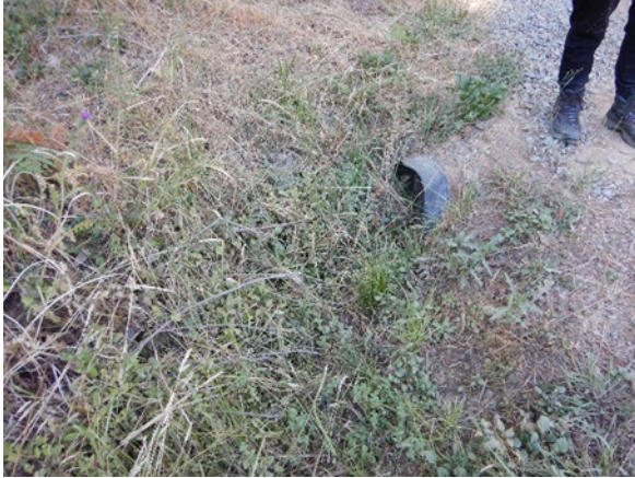
Photo 11: a partially clogged inlet of a culverted stream crossing, threatening sediment delivery at WQ9