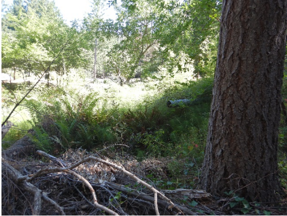
Photo 5: a pond outlet of the pond at inspection point WQ3, installed high threatening streambed scouring and sediment delivery.