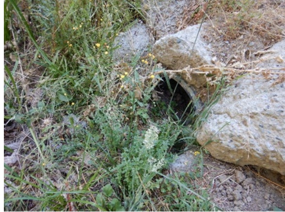
Photo 12: a clogged outlet of the stream crossing at inspection point WQ9.