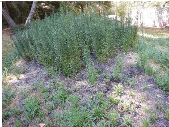
Photo 10: uncontained potting soil with the riparian setback of a class III watercourse at WQ8.