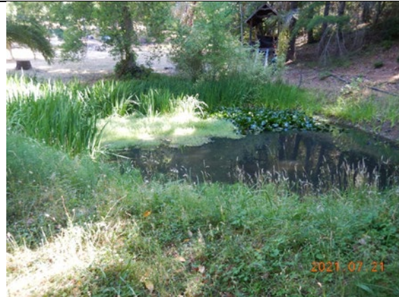
Photo 3: An onstream Pond with stable berm, and overflow installed high on the berm scouring and threatening sediment delivery at inspection point WQ3.