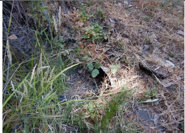
Photo 8: partially clogged and failed ditch relief culvert (DRC) inlet at WQ6.