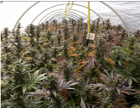
Photo 15: a small cannabis green house at WQ12.