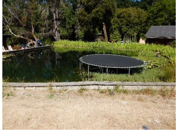
Photo 6: an onstream Pond at WQ5 with a partially clogged plastic culvert overflow.