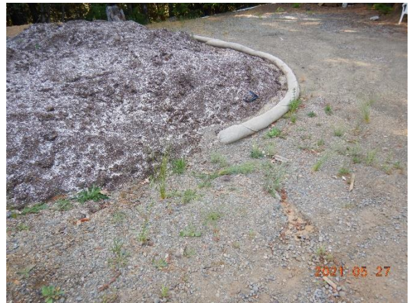
Figure 13. WQ3, Soil pile with inadequate containment and evidence of stormwater runoff from the cultivation flat down the road and into the fiber roll.