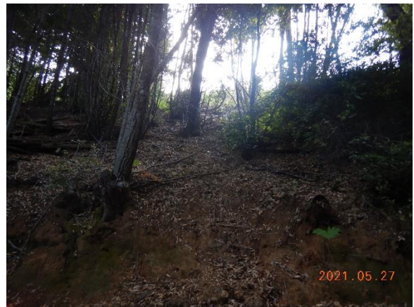
Figure 8. GPS 494, looking upslope from road to cultivation flat at 492. Sediment transport from the eroded cultivation flat at GPS 492.