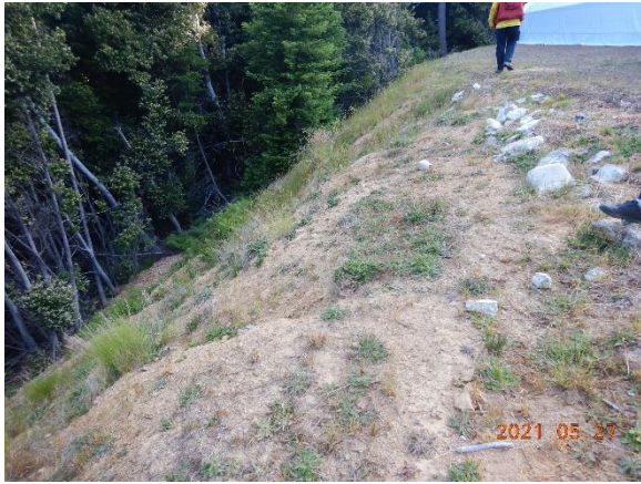
Figure 3. Fill-slope erosion.