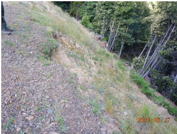
Figure 4. Upper cultivation flat, GPS location 492, SMP Site 8. Erosional void of fill face