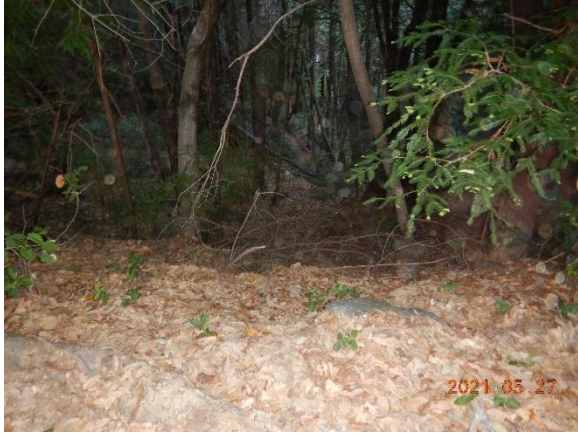
Figure 9. GPS 494, looking down from road with flow path from flat downslope.