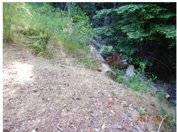
Figure 14. Steep uncompact fill slope at WQ4.