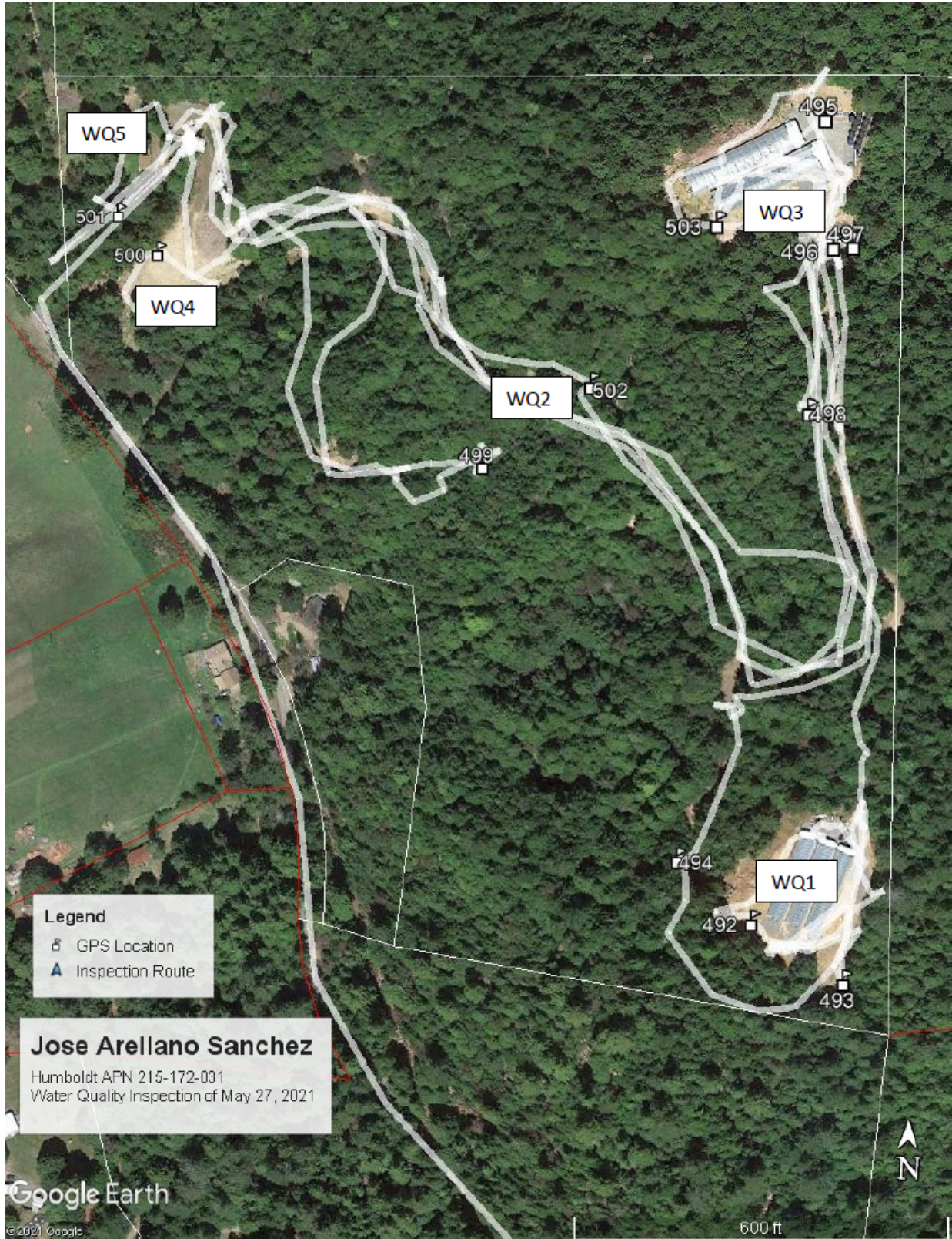
Figure 1. Map of May 27, 2021, water quality inspection of Humboldt APN 215-172-031, showing GPS locations and locations of water quality concern (WQ1-WQ5).