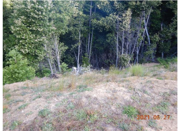
Figure 6. Fill pushed onto stumps from conversion and construction of cultivation flat. Flow path of sediment from flat at GPS 492 down to road below (GPS 494).