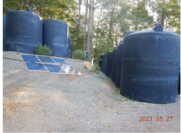
Figure 12. Tanks and well at northern cultivation area.