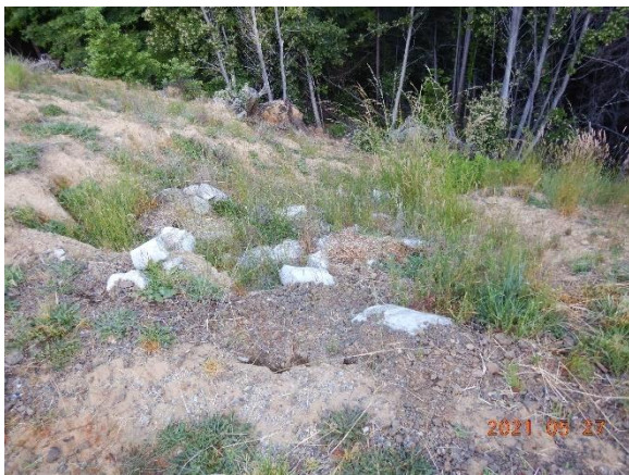
Figure 5. Concrete placed to stabilize fill face erosion.