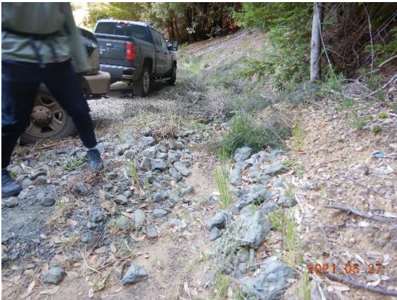
Figure 22. WQ5, location of plugged ditch relief culvert.