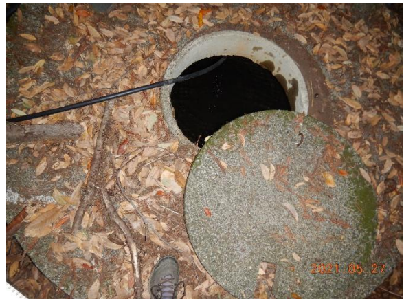
Figure 19. POD at GPS 499.