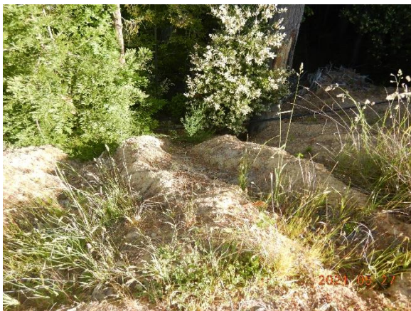
Figure 11. WQ3, Fill-face erosion.