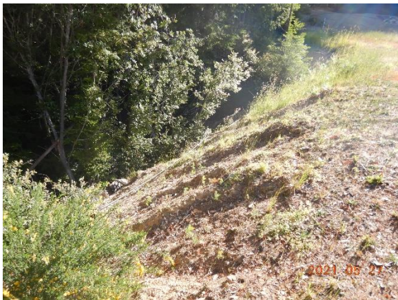
Figure 10. WQ3, Fill-face erosion.