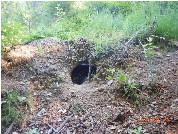
Figure 16. WQ4, erosion of fill.