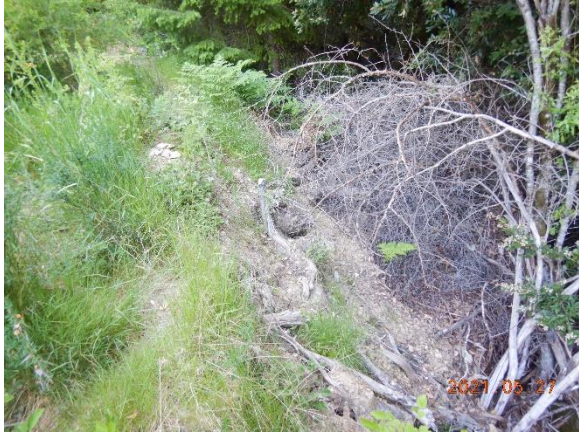
Figure 15. WQ4, fill on organics.