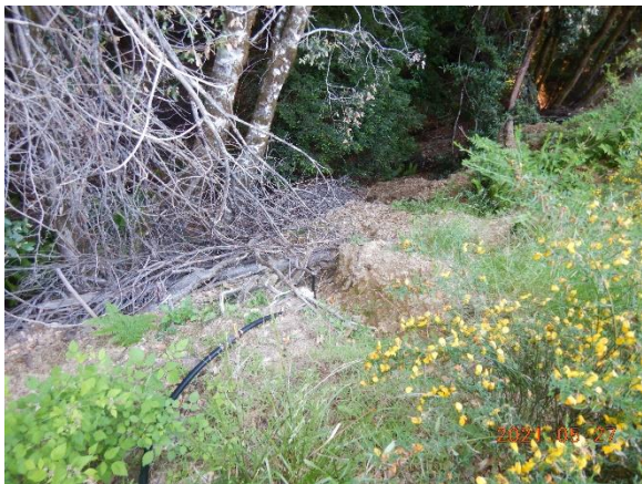
Figure 17. WQ4, fill slope leading to watercourse.