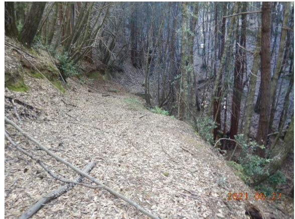
Figure 18. Old road to POD.