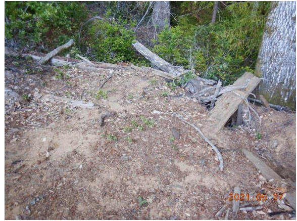
Figure 7. GPS 493, Fill pushed over logs at road to southwest of cultivation area.