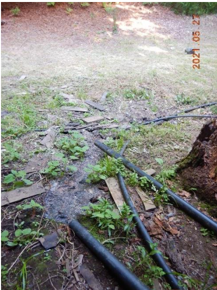
Figure 23. WQ5, Greywater pipe into watercourse near residence.