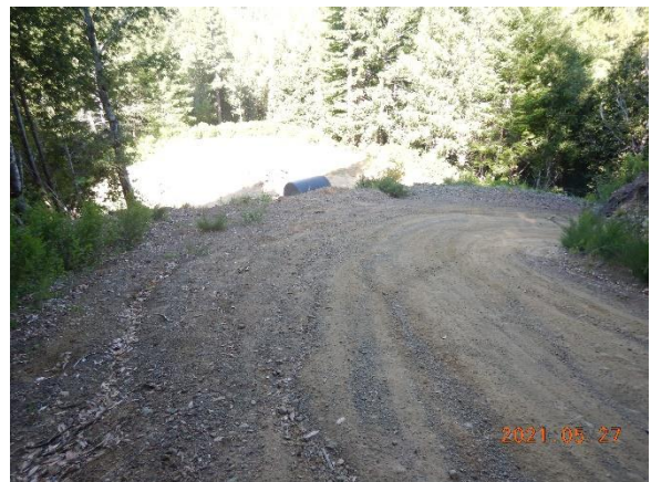
Figure 20. Steep road with rills, above WQ4 and concentrated runoff to WQ5..