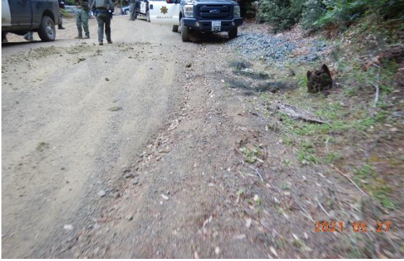
Figure 21. Steep road with rills, leading to WQ5.