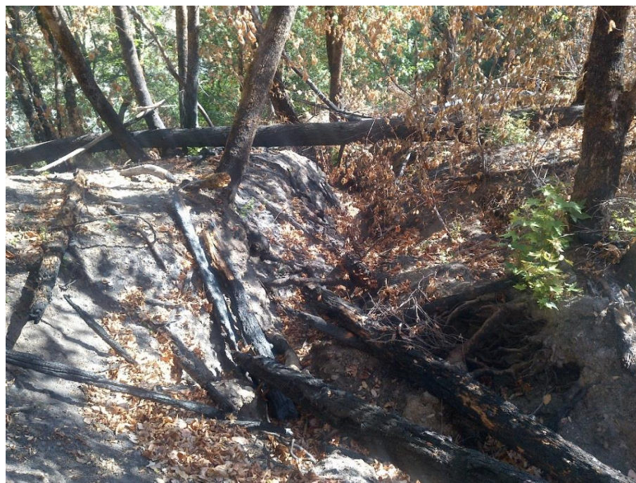
Photo 4—Looking north and downstream along local topographic channel. Recently burned trees are lying in the middle of the channel.