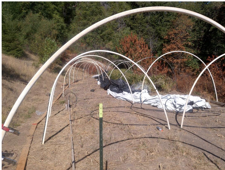
Photo 1—Looking west at a historical cultivation area located at WQ1.