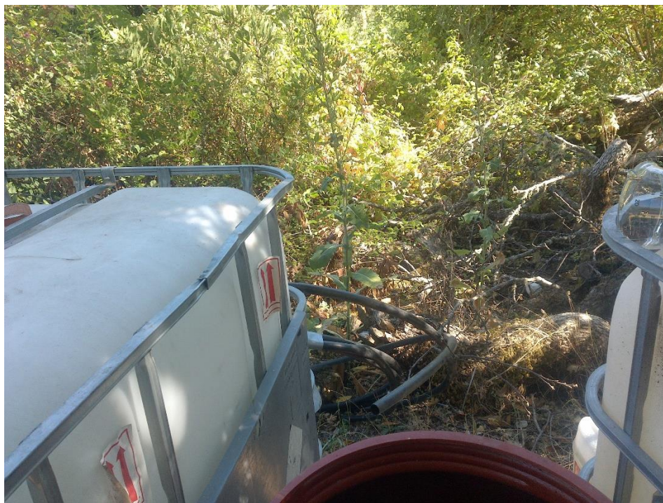
Photo 7—Looking north at cannabis nutrients and waste pipe in the vicinity of anticipated outlet for culvert pictured in previous image.