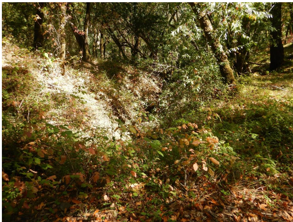
Photo 9—Looking north and downstream at culverted watercourse at WQ4.