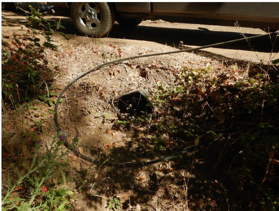
Photo 6—Looking north at partially crushed culvert inlet located at WQ3.