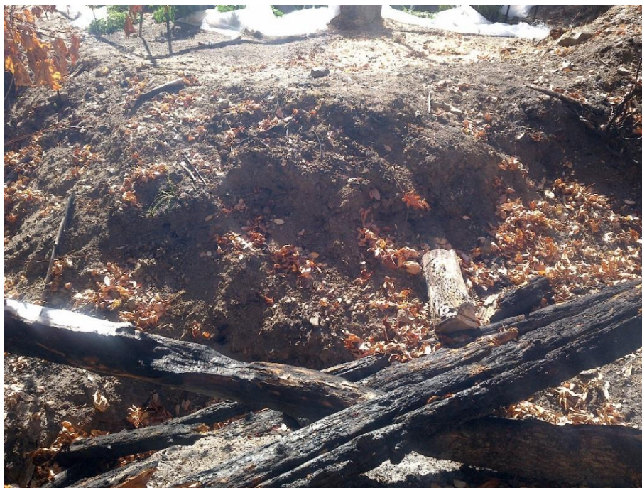
Photo 3—Looking east toward WQ2 from local topographic channel. Cultivation pad is visible in the top of the image. The topographic form of the channel stops approximately 50 feet upslope to the right of the image.