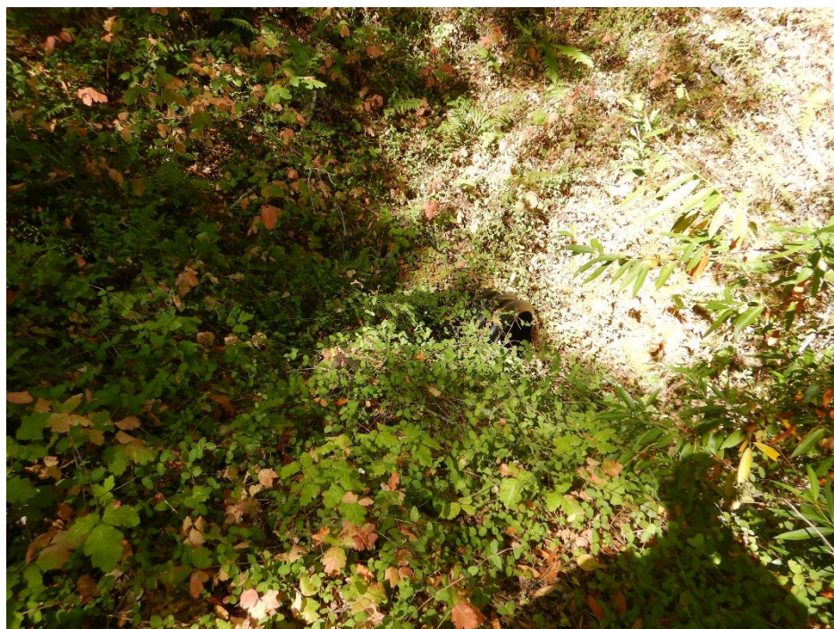
Photo 10—Looking west at culvert located at WQ4. The culvert is a corrugated plastic pipe, less than 10 years old, approximately two feet in diameter and well aligned with the channel bed.