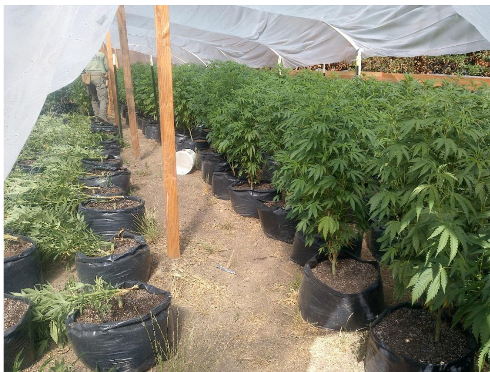
Photo 2—Looking west, toward WQ 2, at outdoor cannabis cultivation.