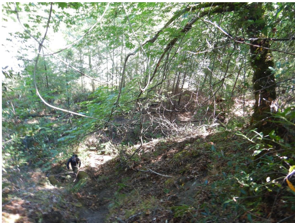
Photo 5—Looking north along flow path of channel pictured in previous image. A channel is not visible.