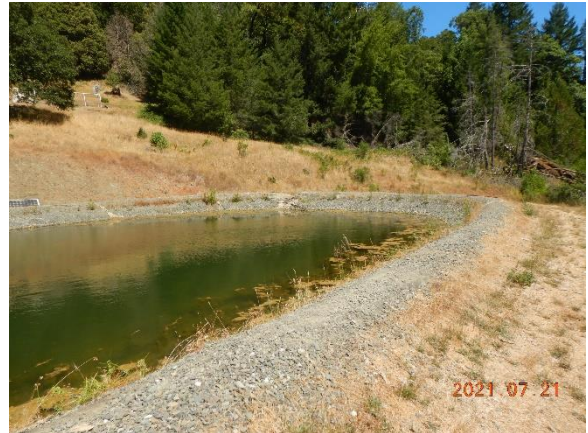
Figure 20. Pond is lined, full of water, and with minimal freeboard