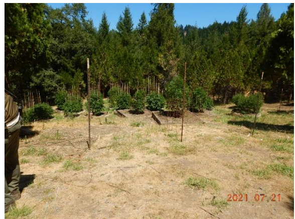
Figure 16. Outdoor cultivation