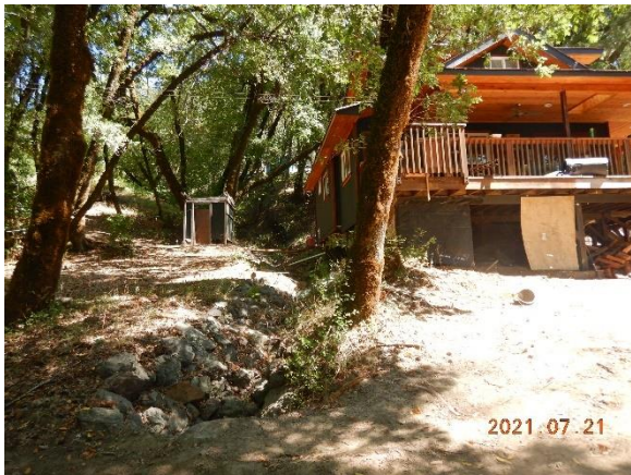
Figure 9. Looking upstream at lower house from crossing at WQ3. Note

rocked channel, proximity of structures to watercourse, and show next to watercourse.