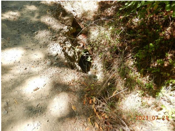
Figure 23. Road ditch on shared road at culvert inlet to South Fork Salmon Creek.