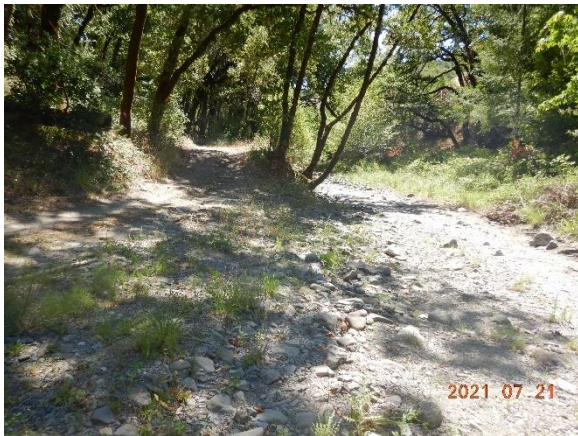
Figure 13. Road to Tosten Creek merges with channel bed at WQ2.