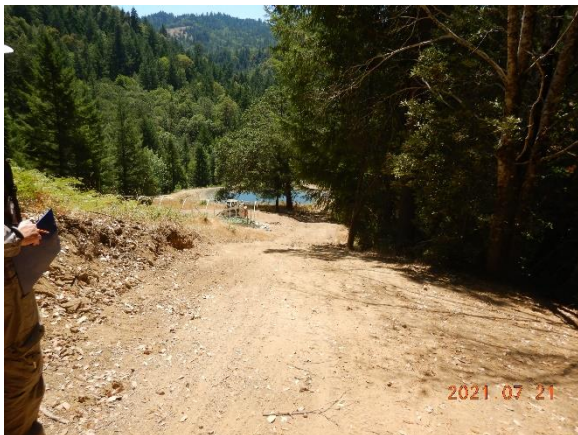
Figure 18. Road to pond is steep and dusty.