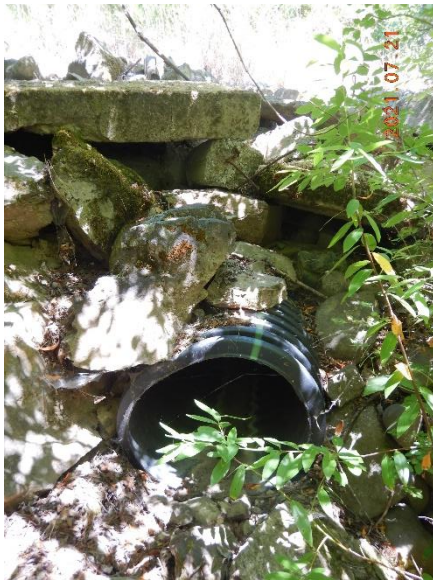
Figure 24. Culvert outlet with concrete rubble.