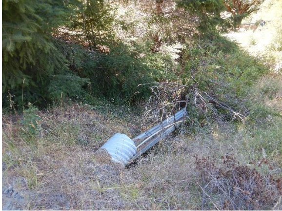
Figure 3. Culvert outlet at WQ5 above gully near house.