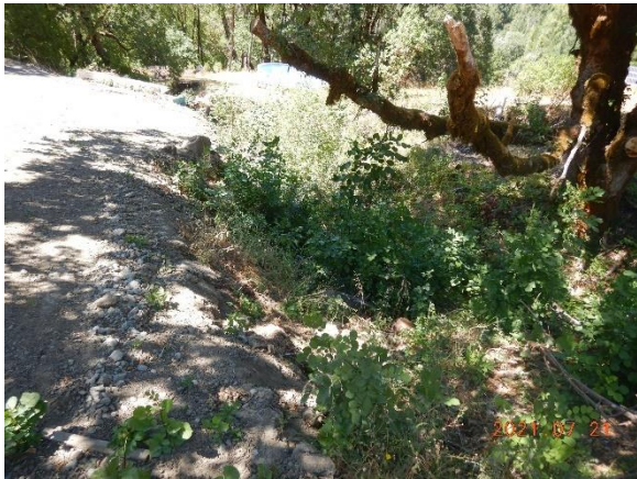
Figure 8. Fill for upper house is pushed to encroach on watercourse.