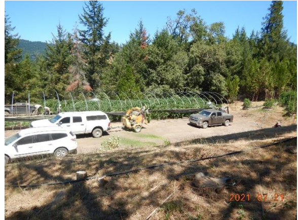
Figure 15. Hoop house cultivation