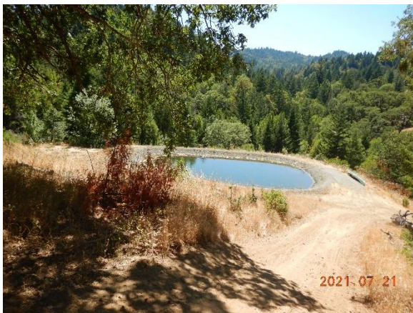
Figure 19. WQ6 Pond.