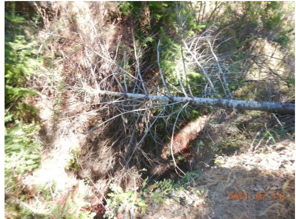
Figure 5. Below road watercourse becomes gullied above the houses at WQ1.