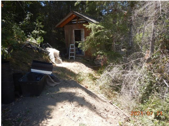
Figure 17. Shed near cultivation is built on steep slopes.