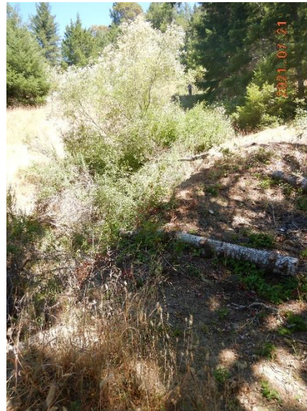
Figure 6. Watercourse above upper house at WQ1.