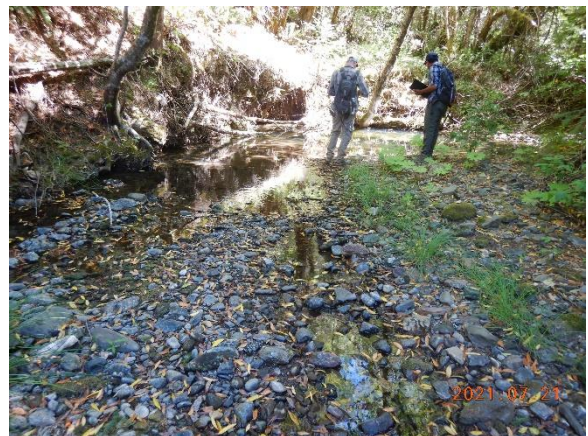
Figure 26. South Fork Salmon Creek with steelhead and rough-skinned newt, pools are disconnecting in low flows.