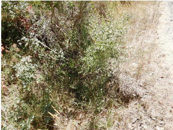
Figure 4. Road runoff delivers to culvert at WQ5.