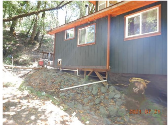
Figure 10. Looking upstream at WQ1 lower house, discharge pipe, and rocked watercourse channel.

rocked channel, proximity of structures to watercourse, and show next to watercourse.