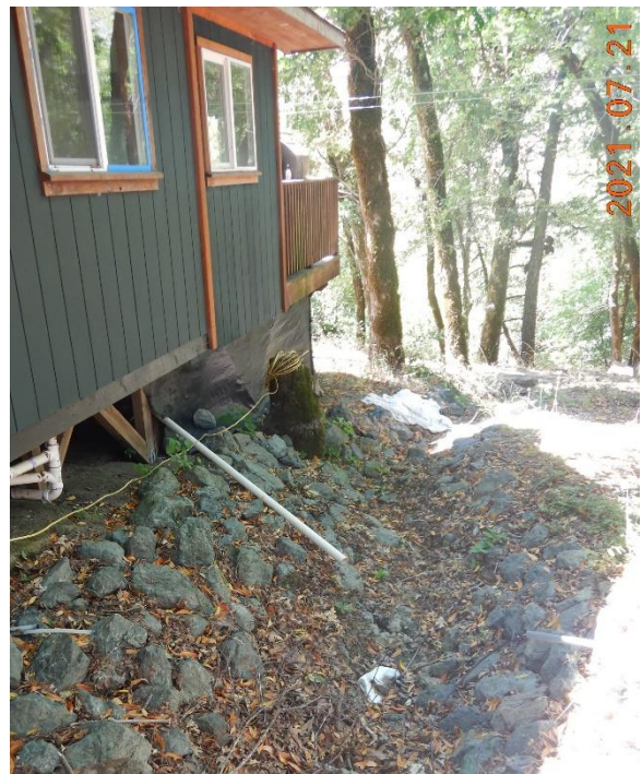
Figure 11. Looking downstream at WQ1 lower house, discharge pipe, and rocked watercourse channel. WQ3 crossing is in distance.