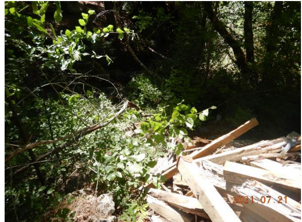
Figure 25. Outlet flows through lumber.