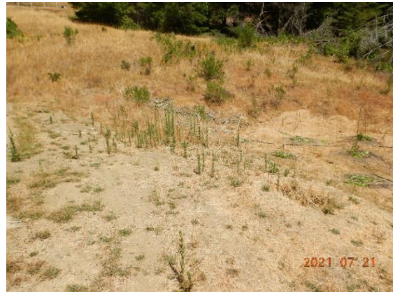
Figure 21. WQ6 Pond outlet overflows to native ground and through woods downslope.