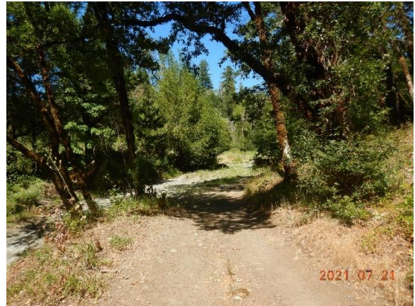
Figure 14. Road to Tosten Creek is hydrologically connected and merges with channel bed at WQ2.