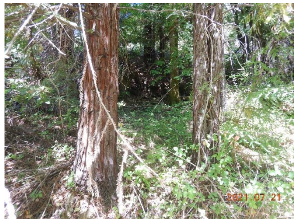
Figure 22. WQ6 Pond overflow travels through woods to road ditch.