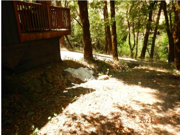
Figure 12. WQ3 crossing below lower house.

WQ3: Crossing, Road to watercourse, hydrologically connected road