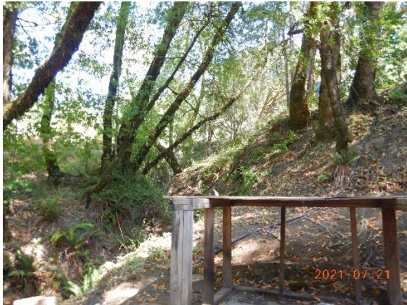
Figure 7. Watercourse near upper house at WQ1.