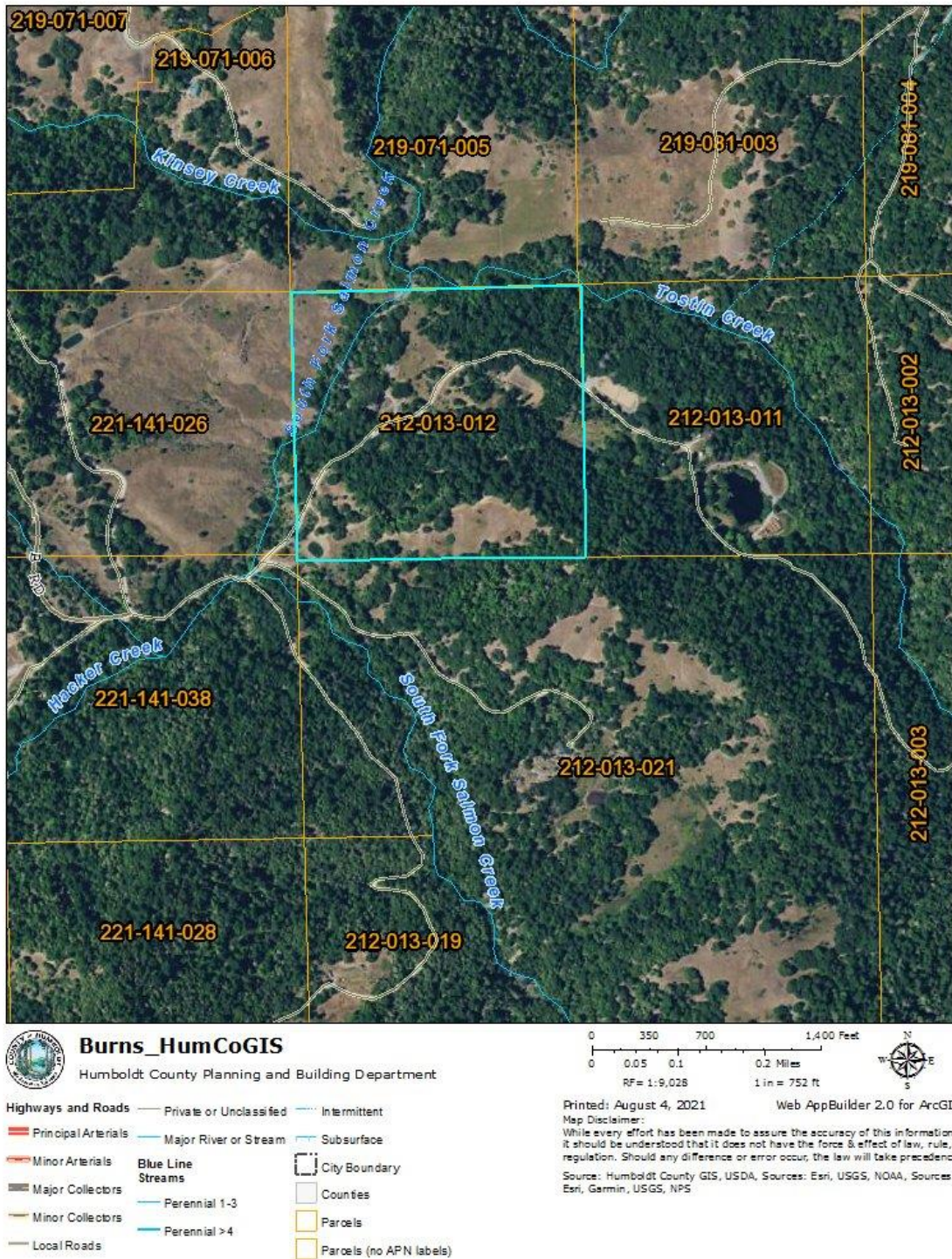
Figure 1. Parcel map of 212-013-012, located near the confluence of Tostin Creek, Hacker Creek, and South Fork Salmon Creek.