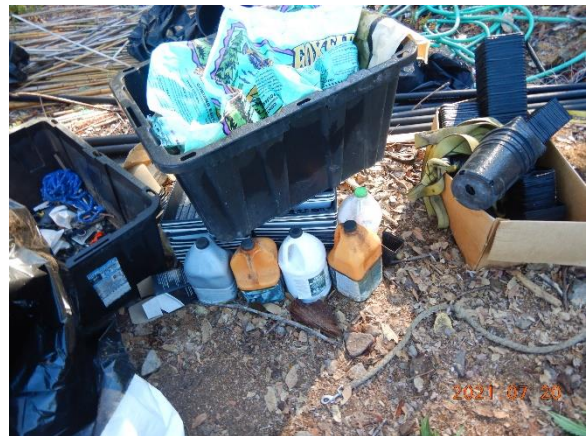
Figure 7. Cultivation-related refuse at WQ1.