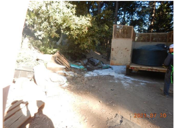
Figure 28. Spilled perlite on ground.