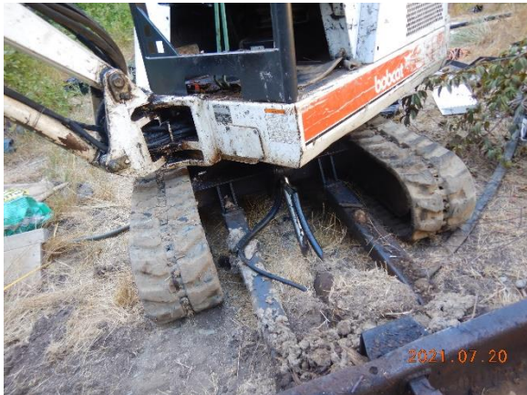
Figure 25. The underside of the excavator is covered in oil.