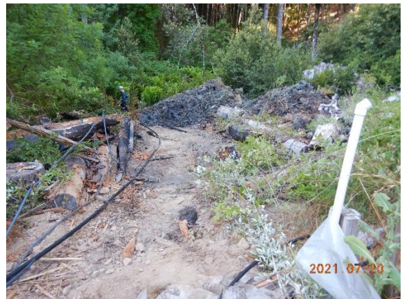
Figure 11. The watercourse is accessed from the Property driveway; a recent equipment track leads to the watercourse and spoils piles are located adjacent to the watercourse.