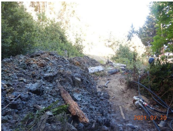
Figure 21. The spoils are fine grained, gray in color and are saturated.