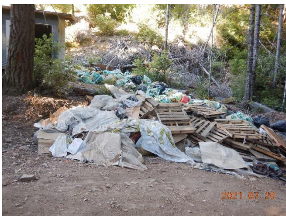
Figure 27. Refuse from pallets of soil bags.