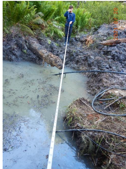
Figure 19. Excavation dimensions were measured as 20 feet long, and 18 feet wide.