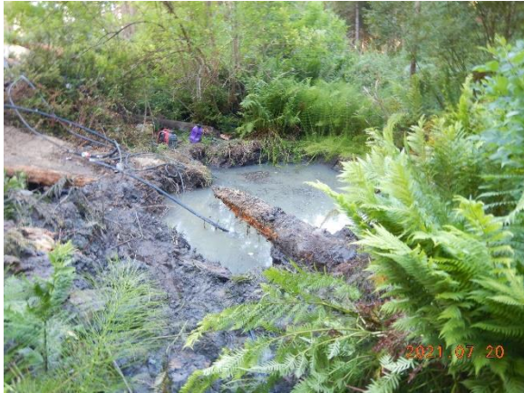
Figure 16. Excavated watercourse and wetland.