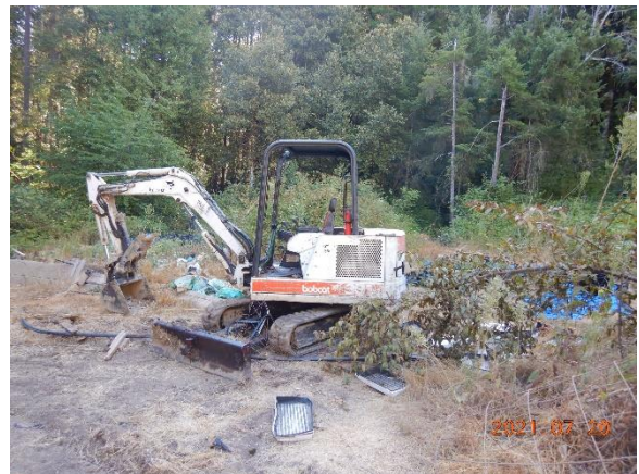
Figure 24. Excavator onsite.