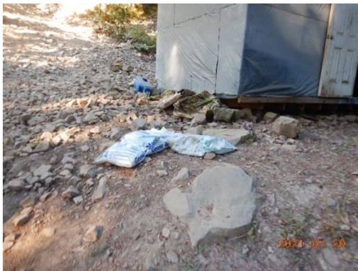
Figure 26. High concentration water soluble fertilizer on the ground.