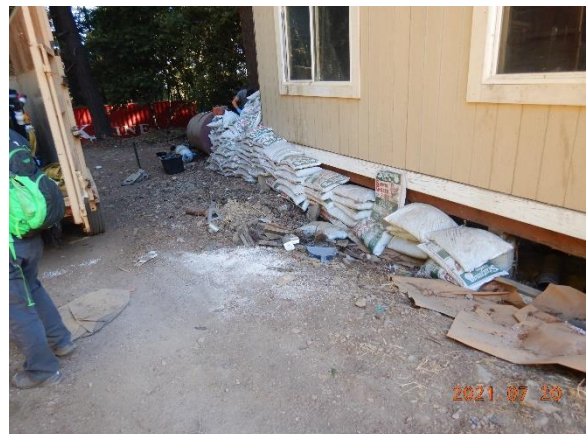
Figure 29. Stockpile of chicken manure.