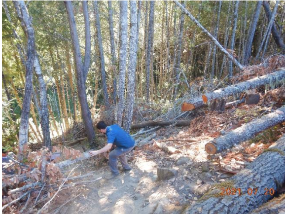
Figure 8. The ridgetop gives way to very steep slopes. Trees were recently felled around the clearing.