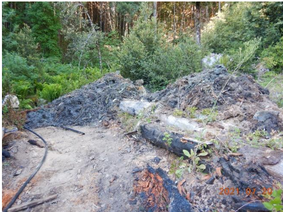
Figure 20. The dimensions of the spoils piles were measured with a measuring tape. The dimensions of the piles were measured as follows: Pile 1 (on left of photo) = 24 feet long, 13 feet wide, and 6.5 feet high. Pile 2 (on right of photo) = 14 feet high, 9 feet wide, and 4 feet high.