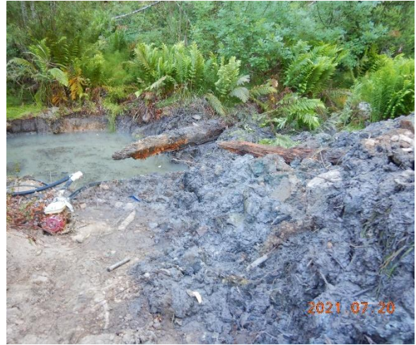
Figure 18. The spoils are on the edge of the excavation.