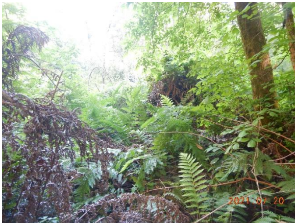
Figure 13. Vegetation upstream of excavation is chain ferns and Oregon ash.