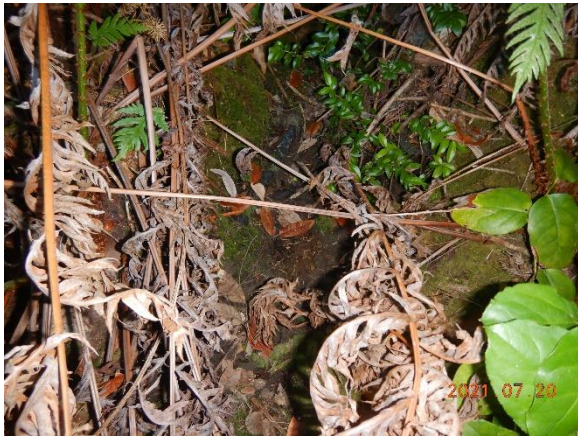
Figure 12. GPS 521, Upstream extent of observed stream channel.