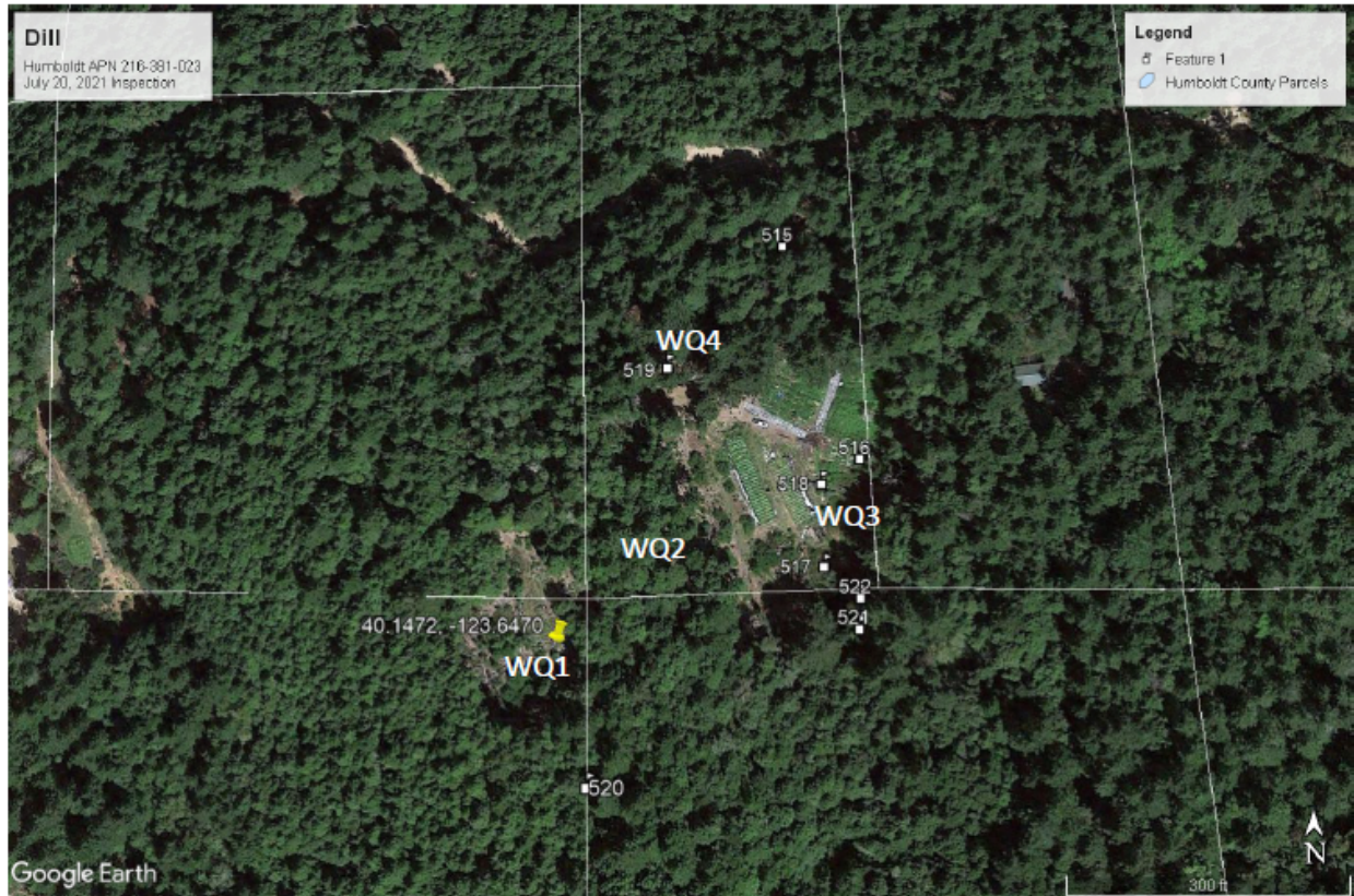
Figure 3. Water Quality inspection map. Numbered locations correspond to GPS waypoints I collected during the inspection (515-522), and location of features and conditions of concern to water quality (WQ1-WQ4).