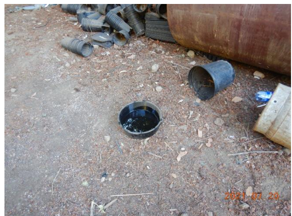
Figure 30. Waste oil in open container on ground.