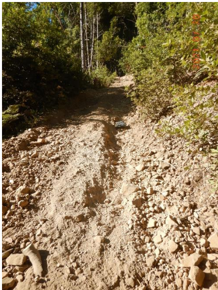
Figure 9. The road from the residence to the ridgetop cultivation area is steep, rutted, and dusty. Runoff from the road could discharge to the watercourse discussed as WQ3.