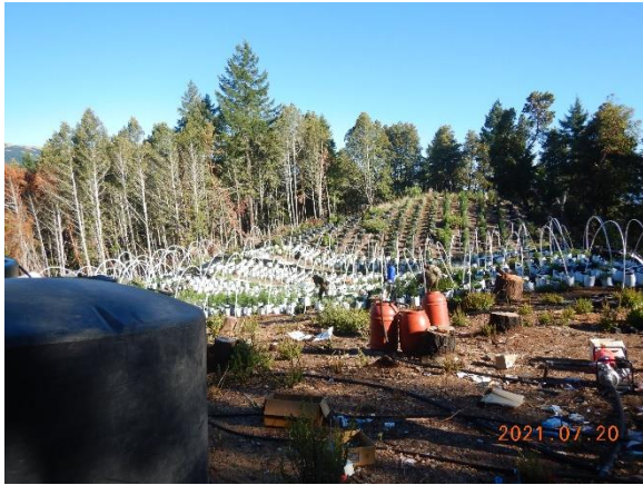
Figure 4. Ridgetop cultivation area.