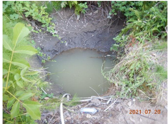
Figure 22. Downstream, at GPS 516, a second small excavation was observed.