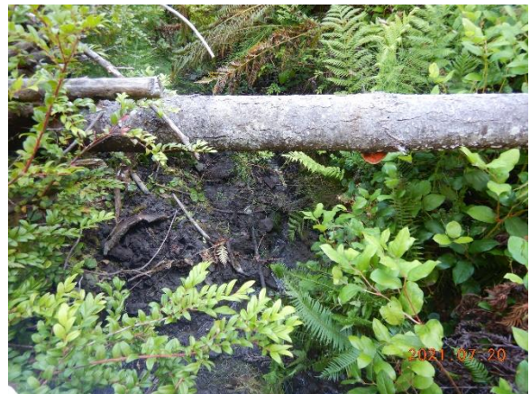
Figure 15. Hand clearing of channel to daylight seepage was observed upstream of the excavation, where the vegetation includes solal and huckleberry.