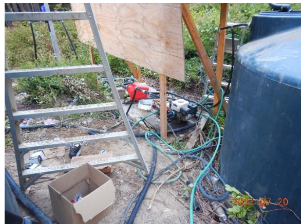
Figure 23. Tanks and pump to service the cultivation.