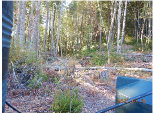
Figure 6. Recently felled trees.