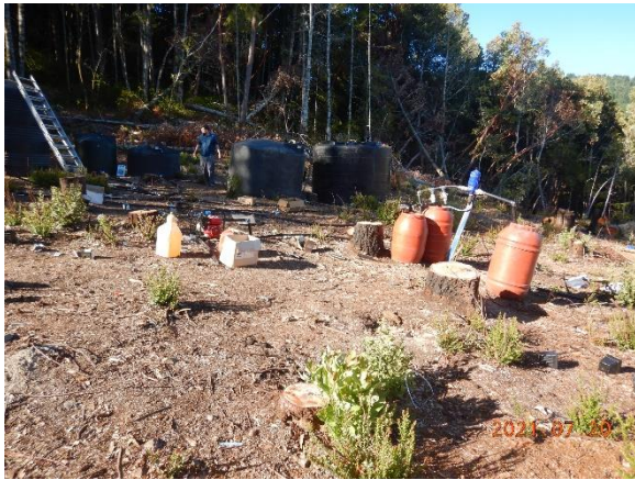
Figure 5. Feed tanks at edge of clearing.