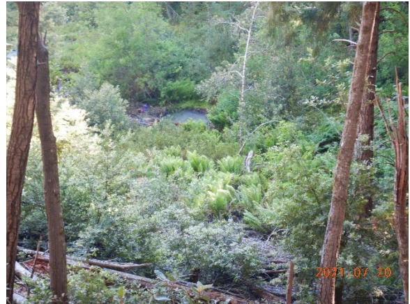
Figure 10. The watercourse and wetland is located in a broad topographic swale, otherwise surrounded by primarily fir and tan oak trees.