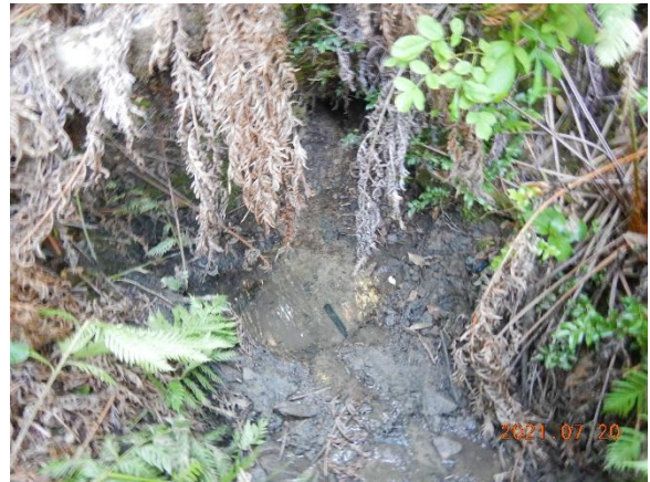
Figure 14. Hand clearing of channel to daylight seepage was observed upstream of the excavation.