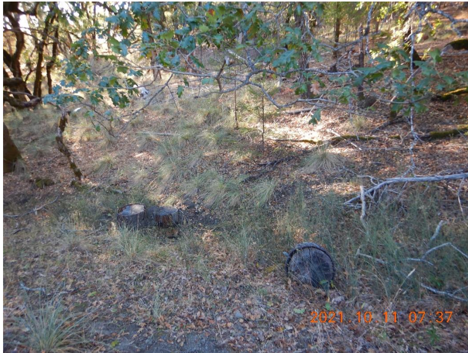
Photo 7—Looking at swale upslope from channelized watercourse southeast of WQ4 and pictured in below image.