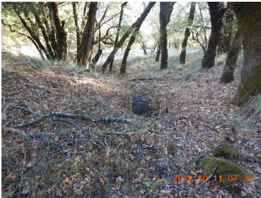
Photo 8—Looking east and downslope where watercourse transitions from a swale to a channel with a defined bed and bank.