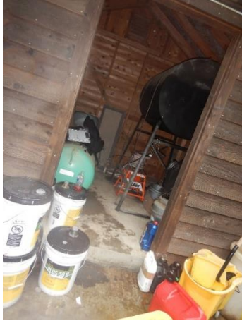
Figure 20. Fuel shed near residence.