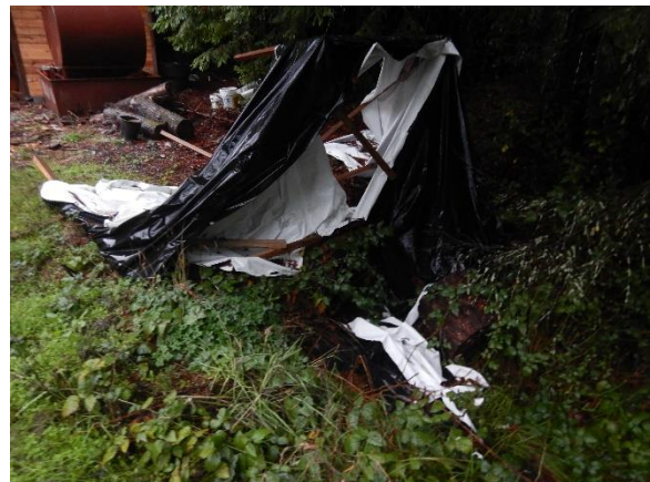
Figure 6. Fuel storage and light deprivation tarp in watercourse at WQ2.