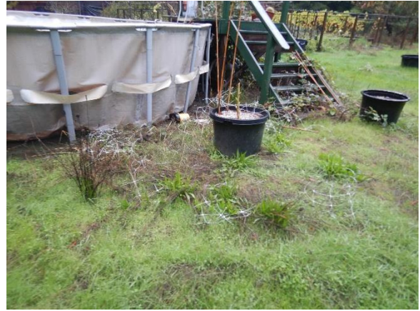
Figure 17. Empty pool near WQ4 with plastic mesh strewn on ground.