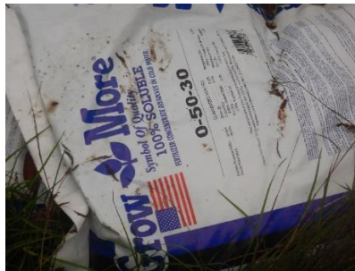
Figure 12. High concentration water soluble fertilizer on ground in rain.