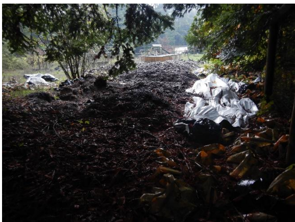
Figure 16. Soil pile as viewed from edge of Class IV ditch.