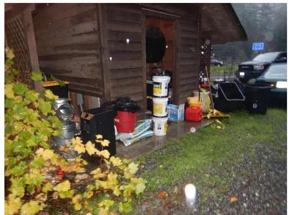
Figure 19. Fuel shed near residence.