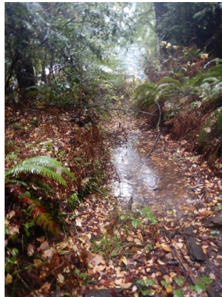
Figure 24. Class IV watercourse.