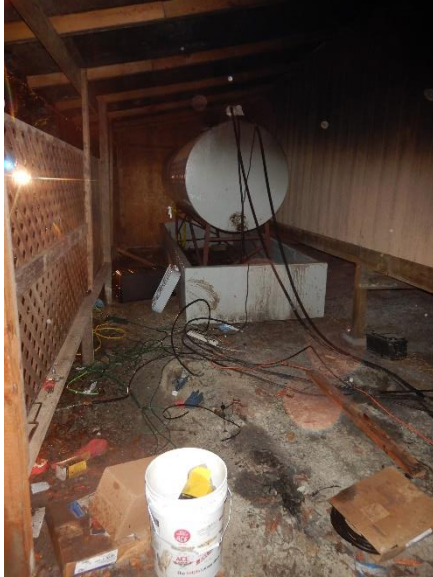
Figure 3. Even though it appears that the Property has PGE power hookups, I observed several areas of fuel storage and use, including WQ1, associated with generators to power the indoor cultivation facilities.