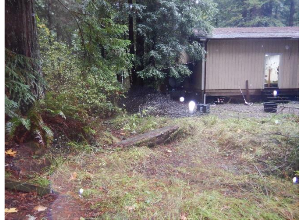
Figure 23. Building next to Class IV watercourse.