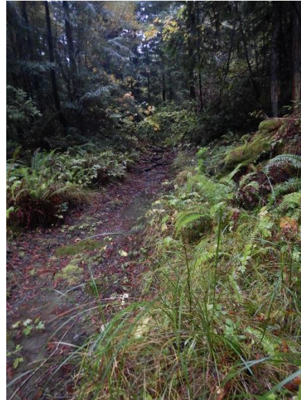
Figure 5. Class IV watercourse near WQ1.