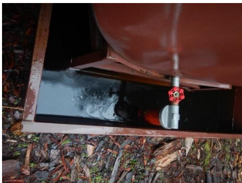
Figure 9. Fuel storage on top of culvert at WQ2.