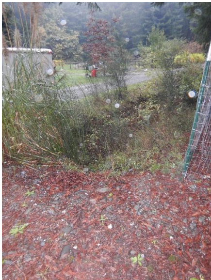
Figure 10. Downstream end of culverted section of Class IV at WQ2.