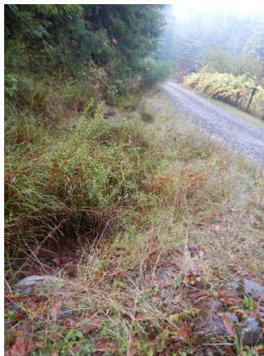
Figure 13. Culvert under HWY 36 near Property entrance gate.