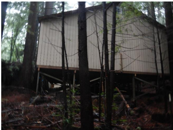
Figure 22. Indoor cultivation building.