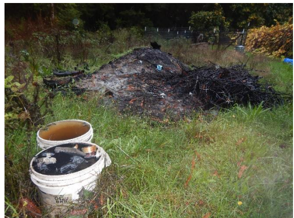
Figure 18. Waste oil buckets full of stormwater and burned garbage near WQ4.