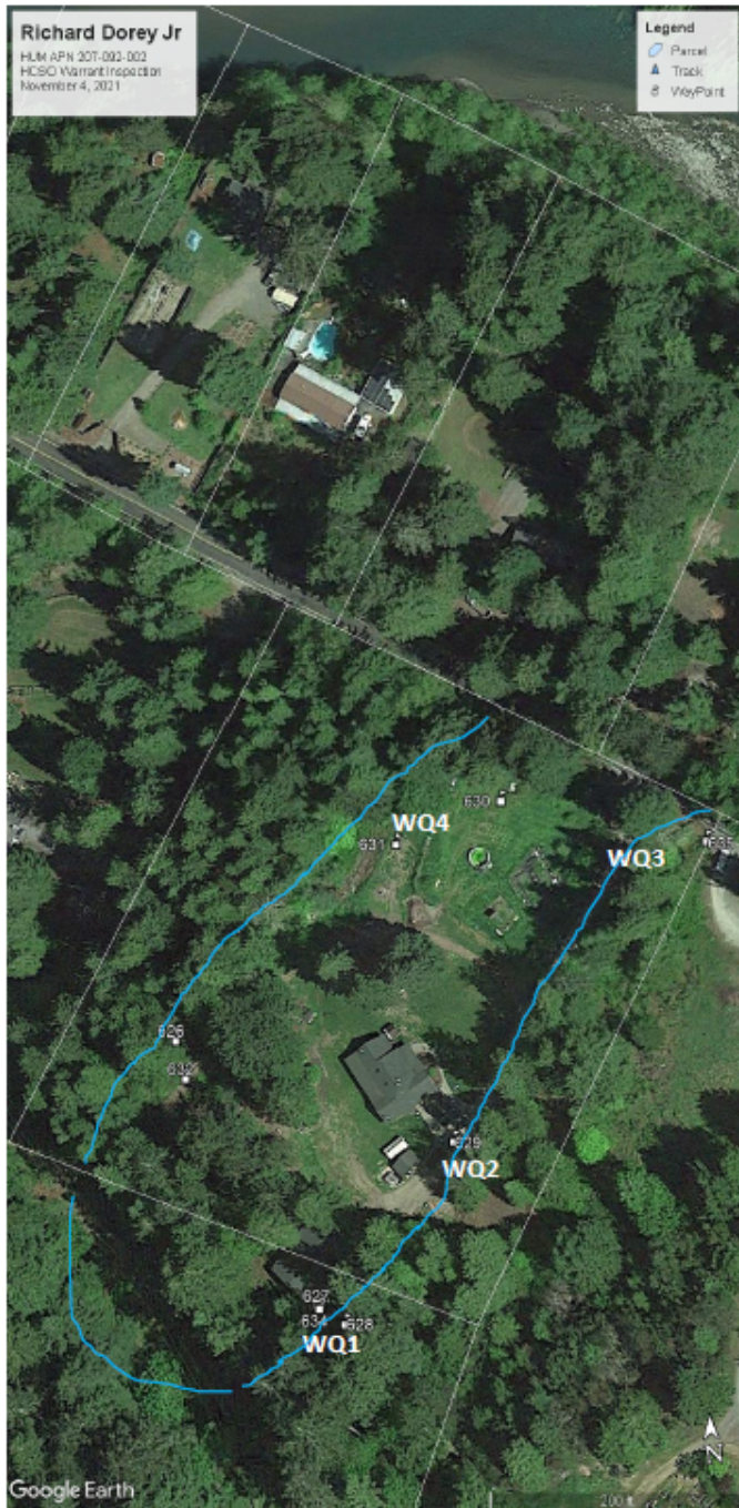
Figure 2. Inspection map of November 4, 2021. The majority of the Property is flat, with rural residential development, including a driveway, house, garden, and outbuildings, many of which were being used for indoor cannabis cultivation and processing. Older Class IV ditches are constructed around Property, draining under Hwy 36 toward the Van Duzen River at the northeast corner of the Property, near the front gate. The blue line indicates the approximate location of the observed Class IV watercourse along the Property perimeter. WQ1-WQ4 are locations of features that pose threats to water quality.