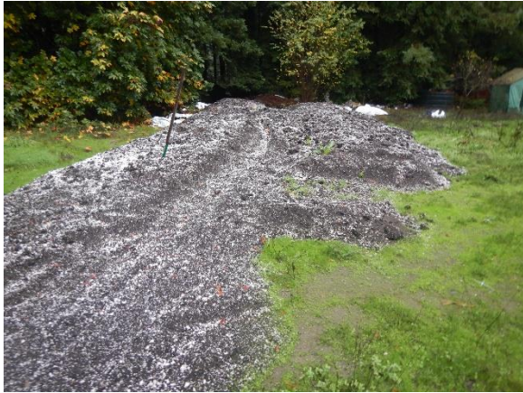
Figure 15. Soil pile is unprotected at WQ4.