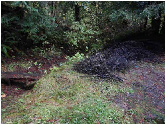
Figure 4. Class IV watercourse near WQ1, with cultivation waste on bank.