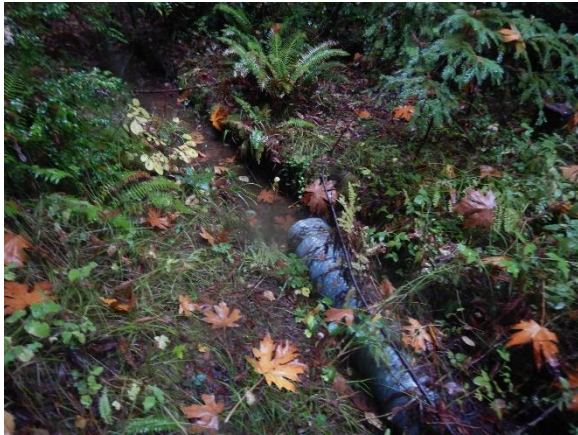
Figure 21. Culvert under road to Class IV watercourse.