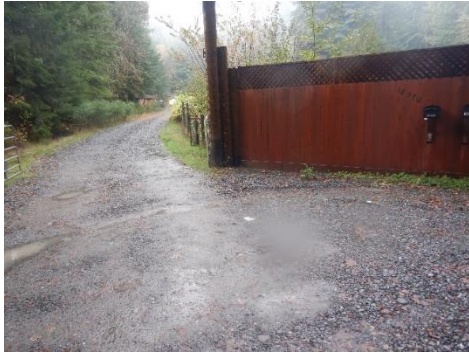
Figure 14. Gate into Property from HWY 36.