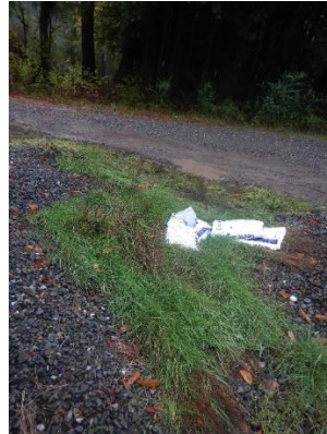
Figure 11. Fertilizer bags on ground near Class IV watercourse.