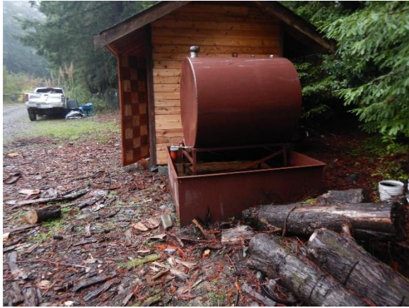
Figure 7. Figure 8. Fuel storage on top of culvert at WQ2.