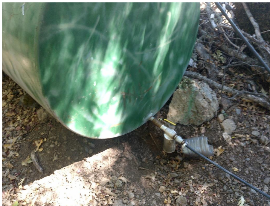
Photo 4—Diesel tanks without secondary containment in the vicinity of WQ3.