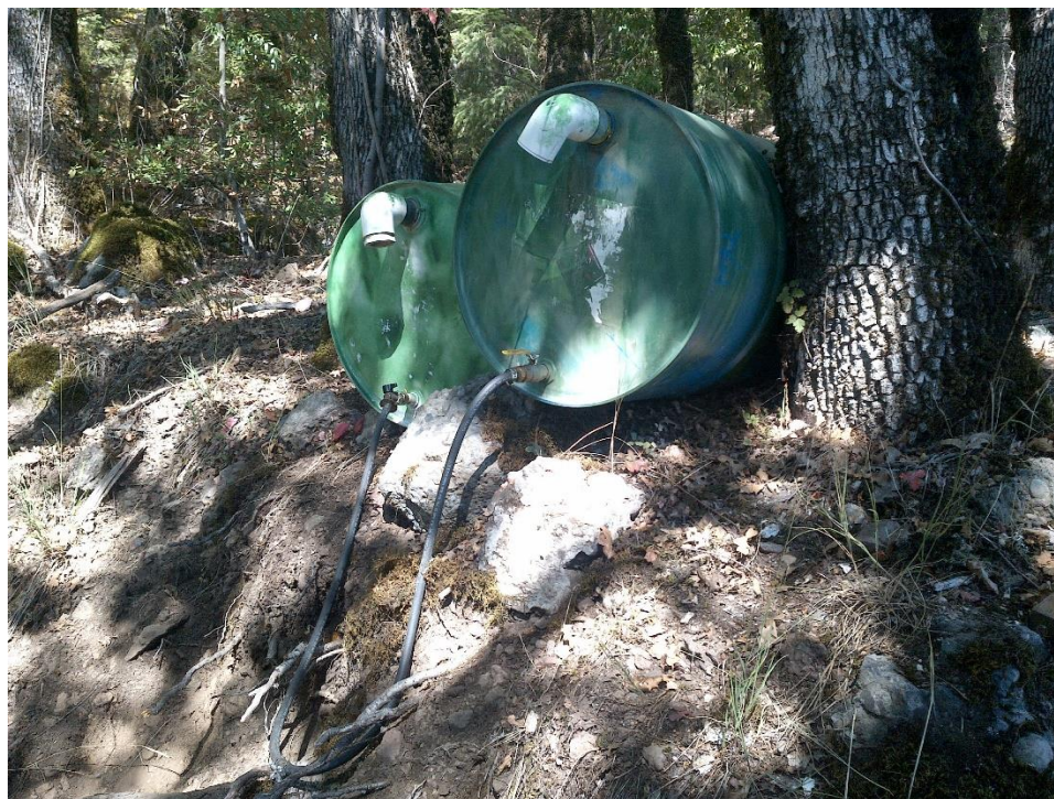
Photo 5—Diesel tanks without secondary containment in the vicinity of WQ3.