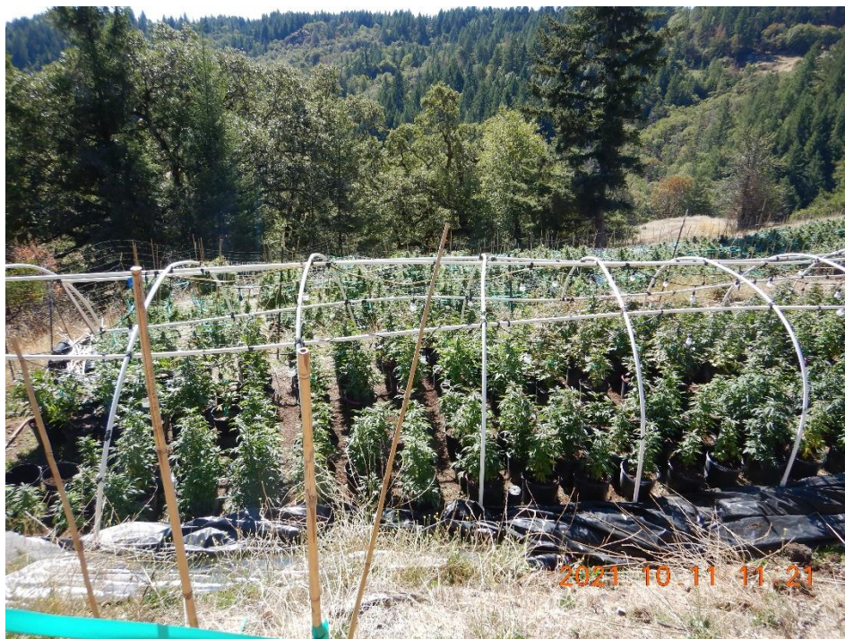
Photo 3—Hoop-type greenhouses with cannabis plants immediately south of cannabis cultivation pictured in the previous image.