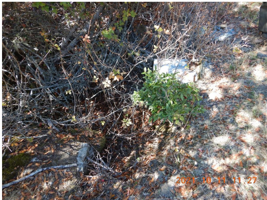
Photo 8—Culvert outlet perched 3.5 feet above the receiving watercourse's bed at WQ4.