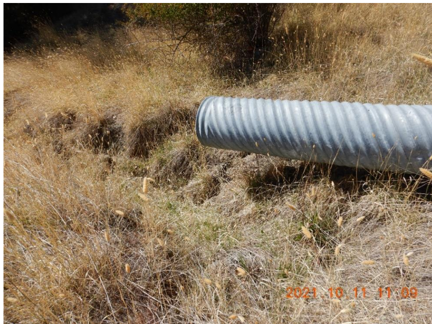
Photo 1—Looking south at reservoir outlet located at WQ1. The pipe is 18 inches in diameter and perched 3.5 feet above the locally scoured channel. The scoured channel is vegetated and appears to have stabilized given the age of the culvert.