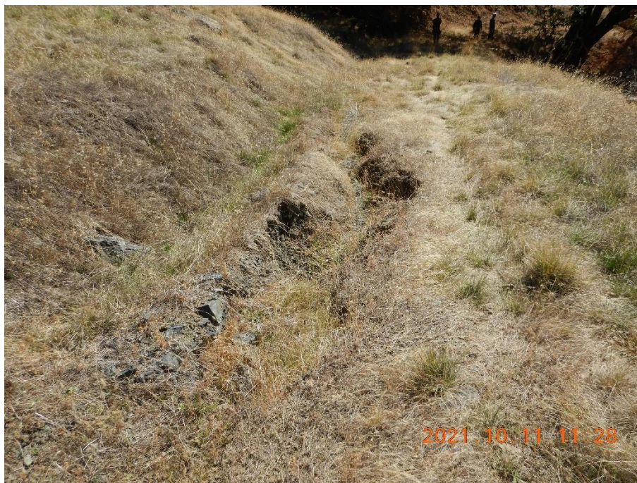
Photo 9—Looking south east at a one-foot deep scour hole on the road-surface at WQ5 where stormwater concentrates before discharging to the watercourse crossing the road at WQ6.