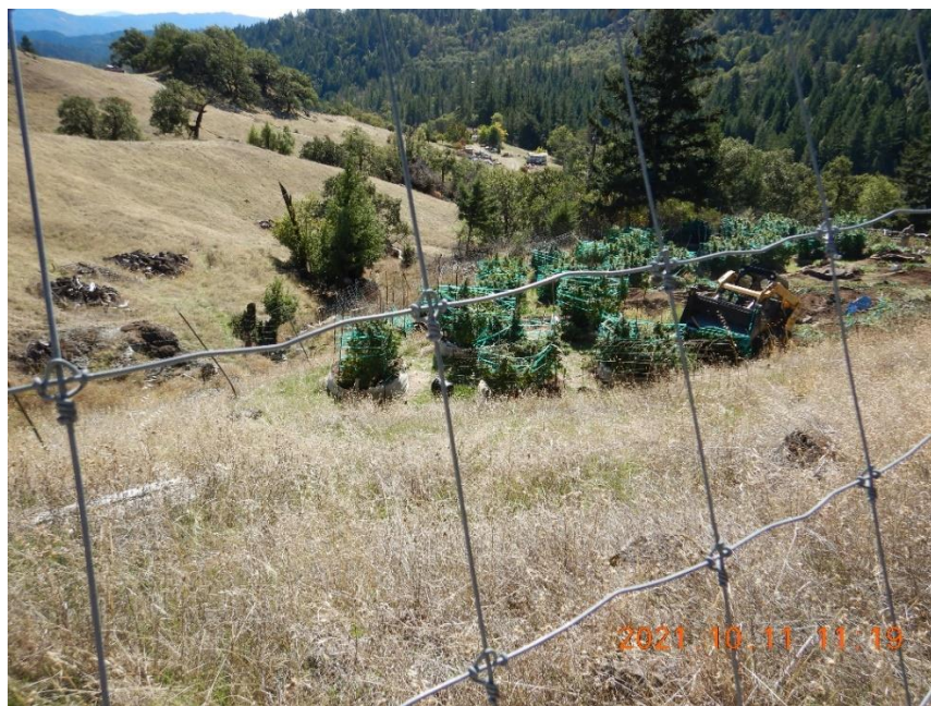
Photo 2—Looking southeast toward WQ2. The topographic form of an ephemeral watercourse is visible in the middle back of the image with a cannabis cultivation area less than 50 feet from the watercourse.