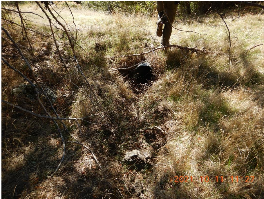
Photo 7—Culvert inlet at watercourse crossing located at WQ4. The culvert is 18 inches in diameter.