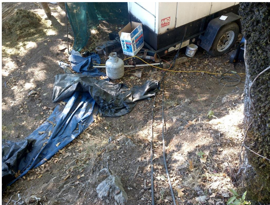
Photo 6—Fuel lines from tanks in two previous images connected to a diesel powered generator in the vicinity of WQ3.