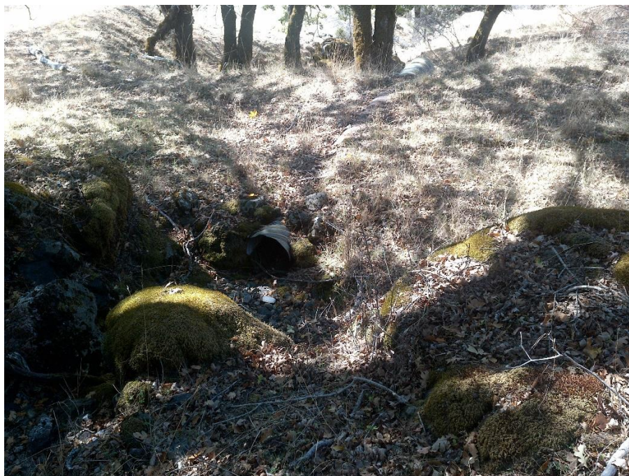
Photo 10—Looking south at a shallowly buried, 18-inch diameter corrugate metal pipe culverting a watercourse across the road at WQ6. The watercourse upslope has a four to 6-foot bank-full width and a substrate consisting of small boulder steps and pools. The culvert outlet is perched two feet above the channel bed.