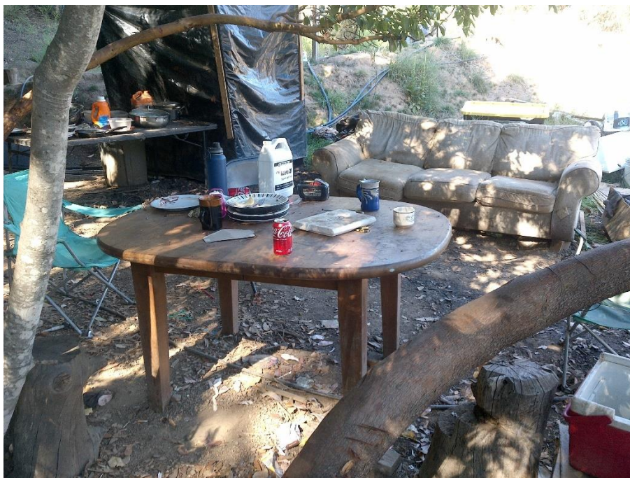
Photo 5—Food preparation area at WQ3. A gallon jug of neem oil is visible in the eating area.