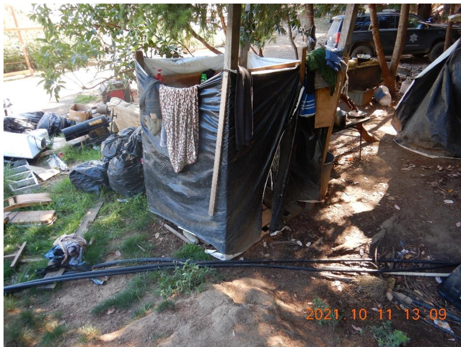
Photo 7—Refuse in black plastic bags surrounding a shower area in the vicinity of WQ3.