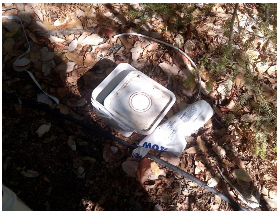
Photo 8—Chemical fertilizers uncovered at WQ4 where they are susceptible to being transported by stormwater.