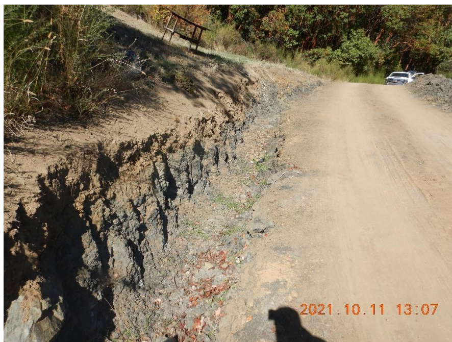
Photo 3—Looking north at excavated roadside ditch in the vicinity of WQ2.