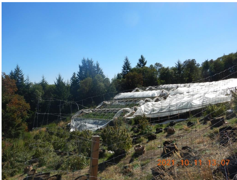
Photo 2—Looking south from WQ2 at outdoor cannabis cultivation area.