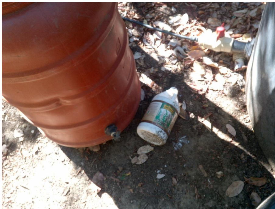
Photo 9— Chemical fertilizer container open and on its side at WQ4 where it is susceptible to being transported by stormwater.