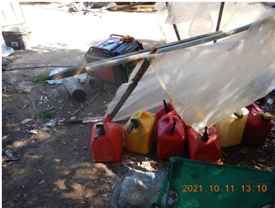
Photo 6—Fuel containers stored at WQ3 without secondary containment.