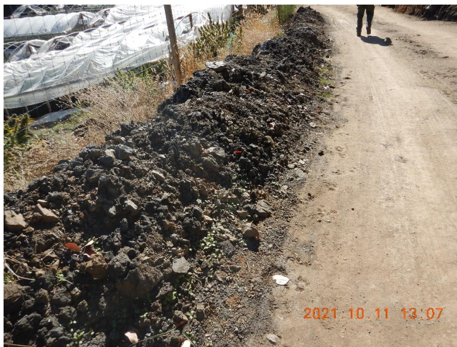
Photo 4—Looking south, in the vicinity of WQ2, where earthen spoils from excavation in previous image were placed. The spoils have not been covered or protected from stormwater.