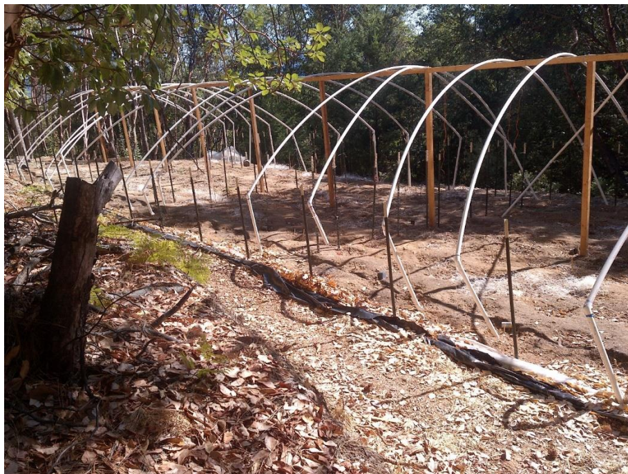
Photo 10—Outdoor cannabis cultivation area without plants or grow medium present. Clumps of plastic netting are visible uncontained within the frame of the hoop-type greenhouse.