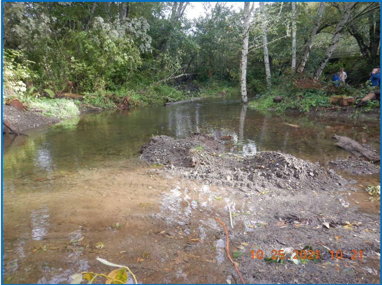
Photograph 3. High Prairie Creek, facing upstream. The photograph shows equipment tracks on the channel bottom of High Prairie Creek that extend to the right of the picture where channel has been modified by grading and vegetation has been cleared.