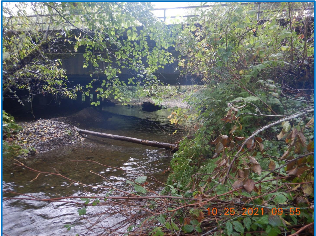
Photograph 1. High Prairie Creek, facing upstream. The photograph shows channel modification where the excavator was driven down the creek channel and under the Highway 101 bridge.