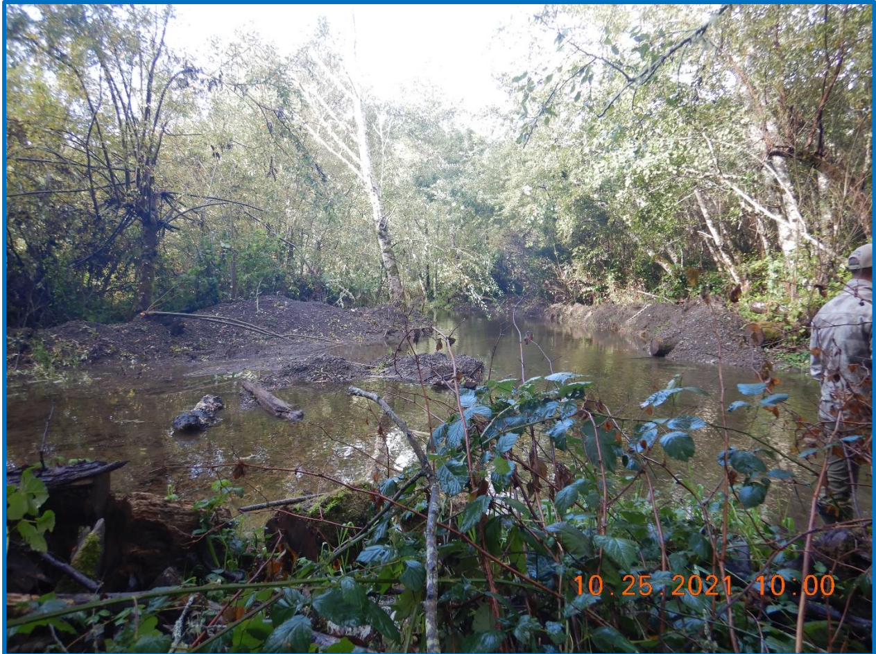
Photograph 2. Photograph taken by Amanda Piscitelli, at High Prairie Creek, facing downstream. The photograph shows berm at right of channel, channel modification, cleared vegetation, and soil piles along the left bank.