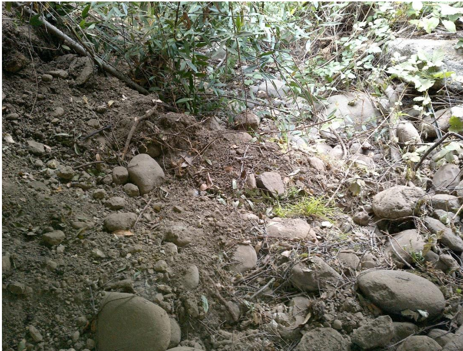
Photo 16—Looking downstream below recently installed bridge at WQ8. Finer earthen material from the left bank is overlying the cobble bedded substrate of the channel.