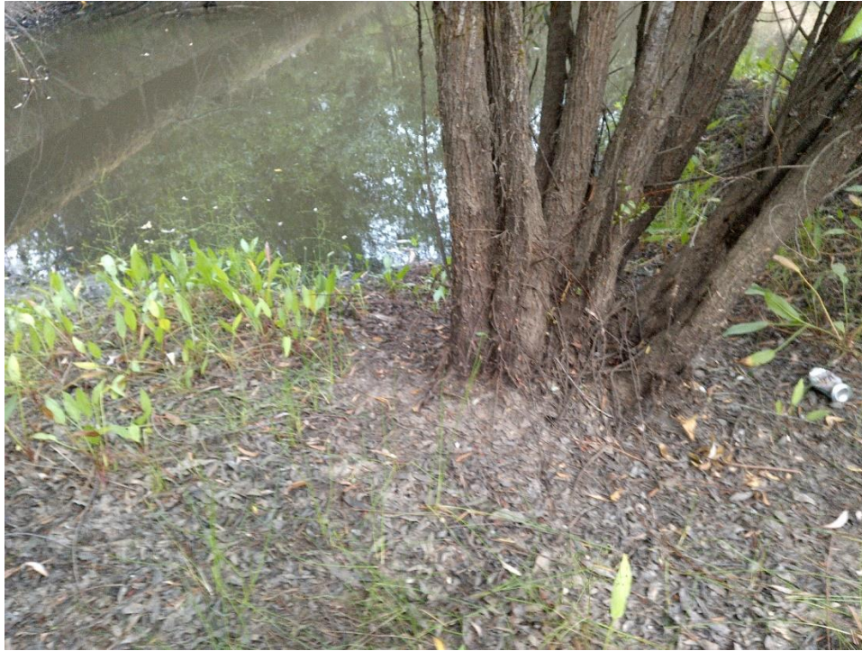
Photo 11—Looking west and downstream where water from the culvert at WQ5 would flow into the reservoir in the background of the image.