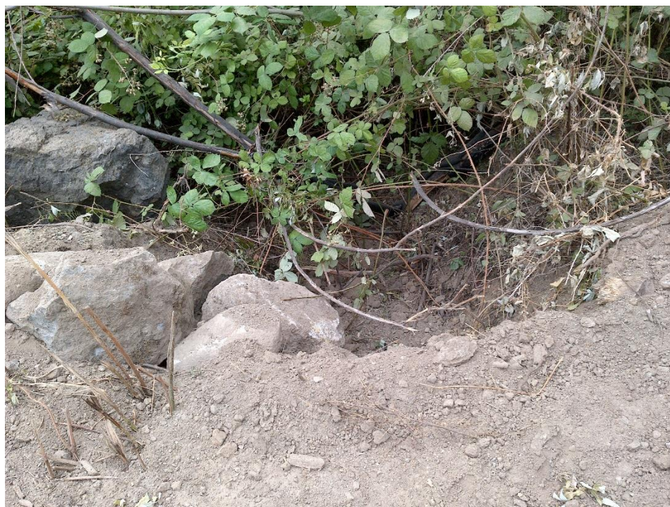
Photo 8—Looking east and upstream at culvert inlet located at WQ5. The watercourse upstream is not visible behind dense vegetation.