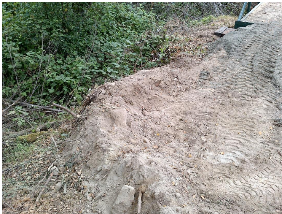
Photo 17—Earthen spoils on the road approaching the recently installed bridge from the west.