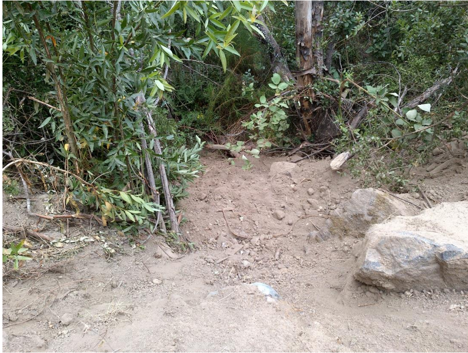
Photo 9—Looking west and downstream at culvert outlet located at WQ5. Earthen spoils cover the ground from the culvert outlet to the line of dense vegetation.