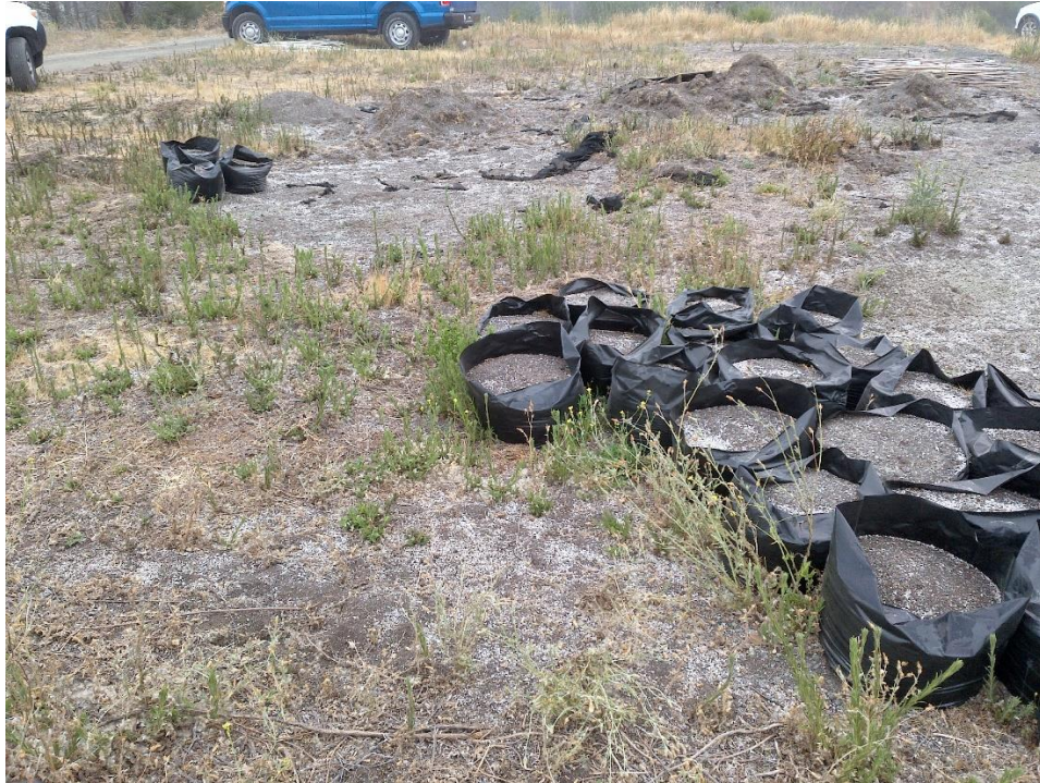
Photo 1—Historical cultivation area at WQ1. Imported potting soils are uncontained.