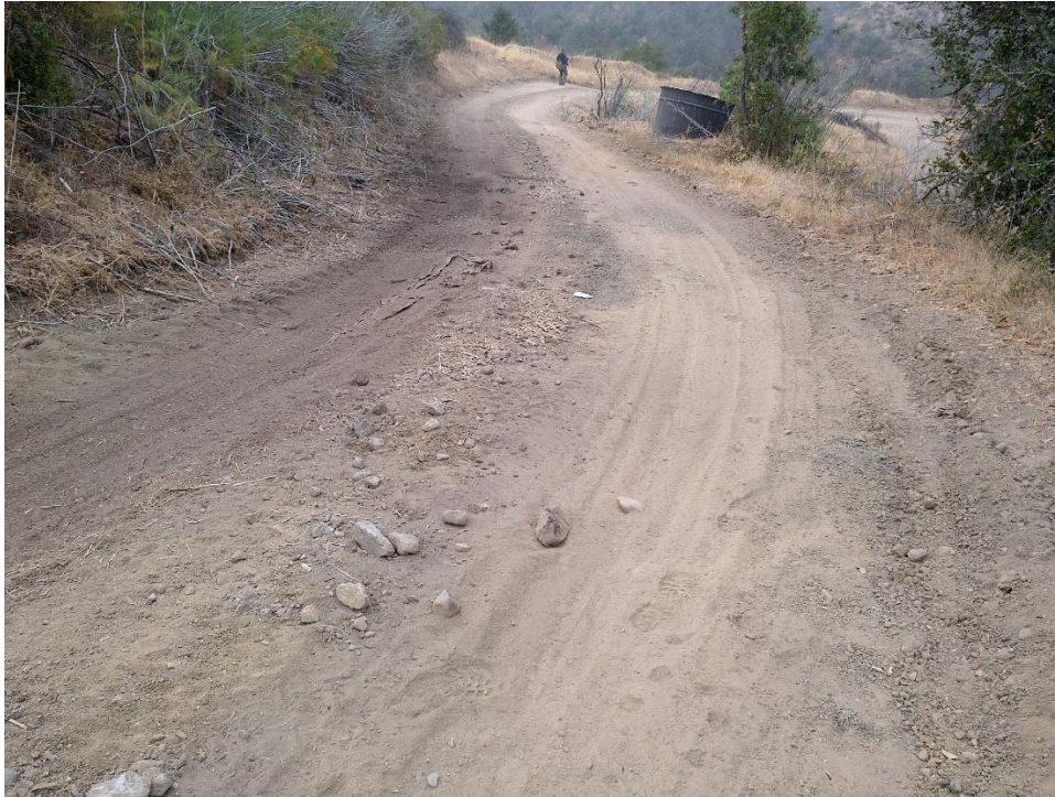
Photo 3—Looking south on road west of WQ1. The road is steep with a surface of fine material.