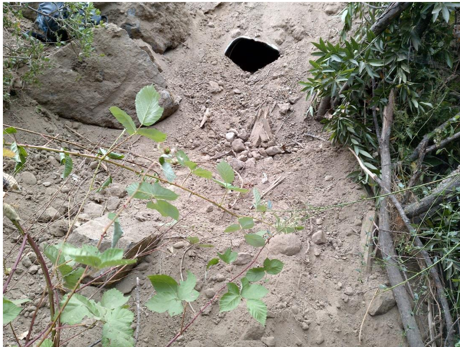
Photo 10—Looking east and upslope at culvert outlet located at WQ5.