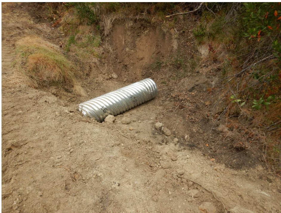
Photo 19—Looking west at upstream end of recently installed culvert at WQ9. The culvert is eighteen inches in diameter.