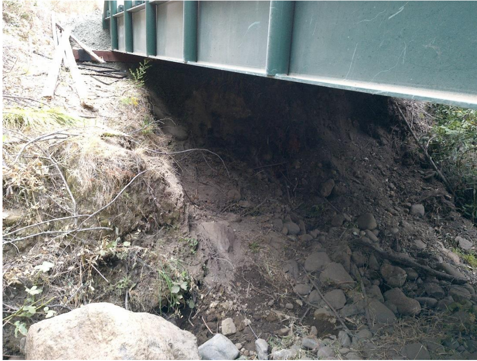
Photo 15—Looking east at the left embankment of a recently installed bridge at WQ8.