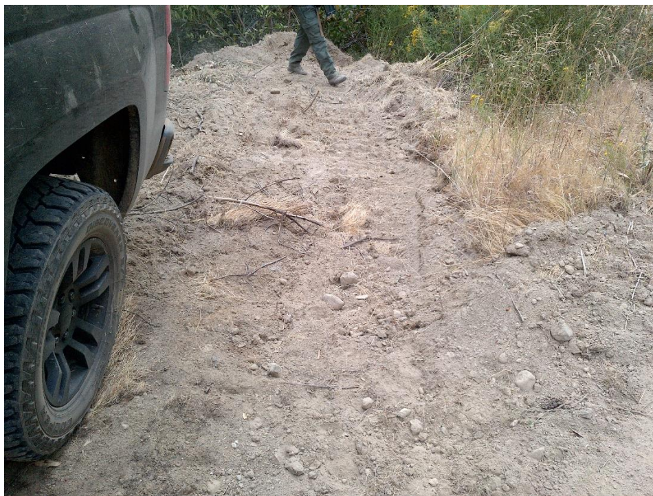
Photo 7—Looking north at earthen spoils east of WQ4. The reservoir pictured in later photos is out of view in the background of the image.