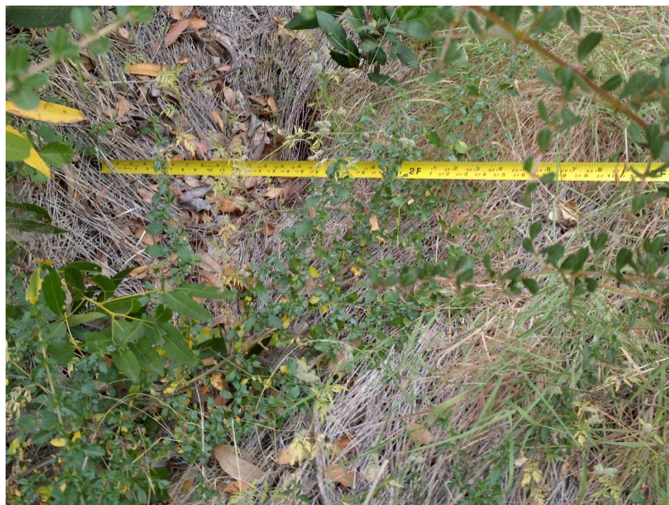
Photo 18—Channelized watercourse, approximately two feet wide upstream from recently installed culvert at WQ9.