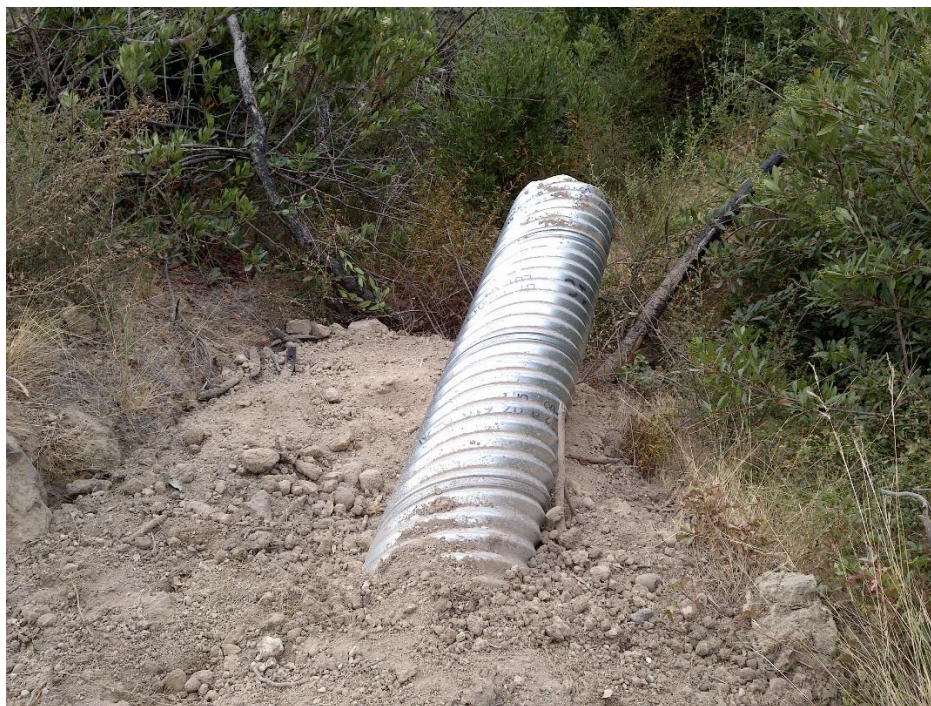
Photo 20—Looking south and downstream at recently installed culvert at WQ9. The culvert outlet is perched five feet above the watercourse downstream.