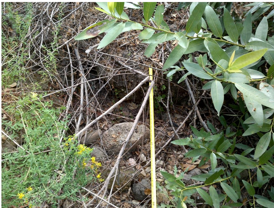
Photo 13—Looking west at cobble bedded channel with defined banks at WQ6. The channel is immediately downslope from the reservoir's impounding berm.