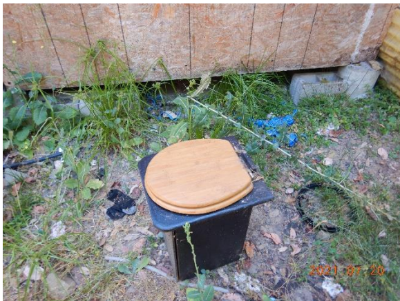
Figure 6. Makeshift latrine next to shed on bank of watercourse at WQ1.