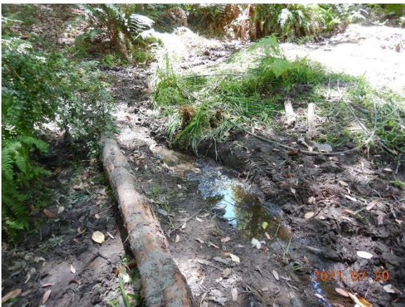
Figure 12. Surface water is concentrated by hand dug channels at WQ3.