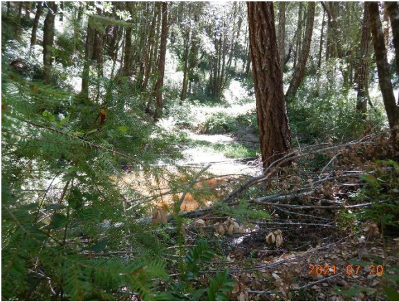
Figure 10. Impoundment of surface water at WQ3.