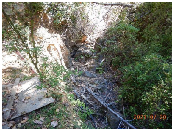
Figure 3. Refuse on bank and in incised watercourse.