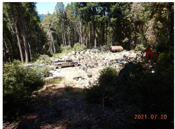
Figure 9. Looking down on cultivation area, WQ2. Dwelling is on right. Watercourse is on left, off of photo.