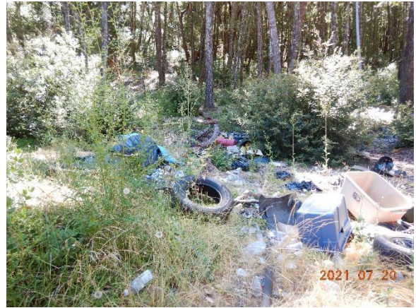
Figure 7. Refuse between WQ1 and WQ2.