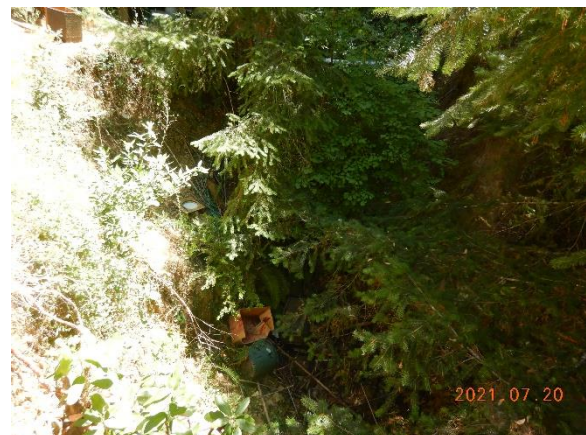
Figure 4. Picture of refuse in watercourse at WQ1.