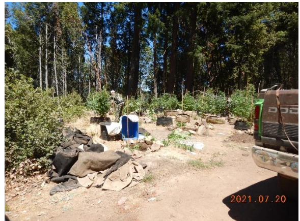
Figure 8. Cultivation area at WQ2.