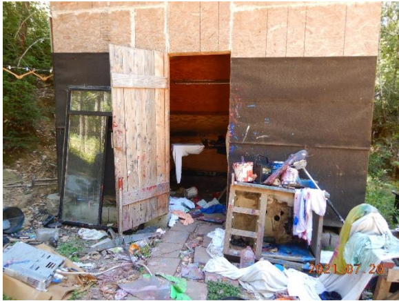
Figure 5. Picture of shed built on bank of watercourse with paint and refuse inside and outside, WQ1.