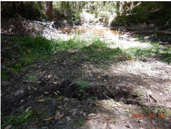
Figure 11. Cannabis clones planted in wetland at WQ3.