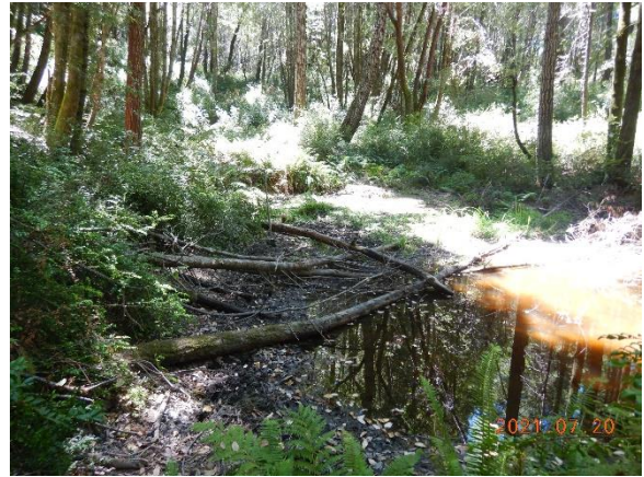
Figure 13. Surface water impoundment at WQ3.