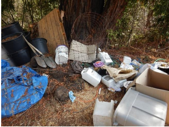
Figure 9. Refuse accumulation.