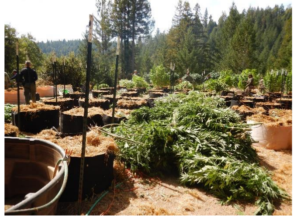
Figure 6. Outdoor cultivation area.