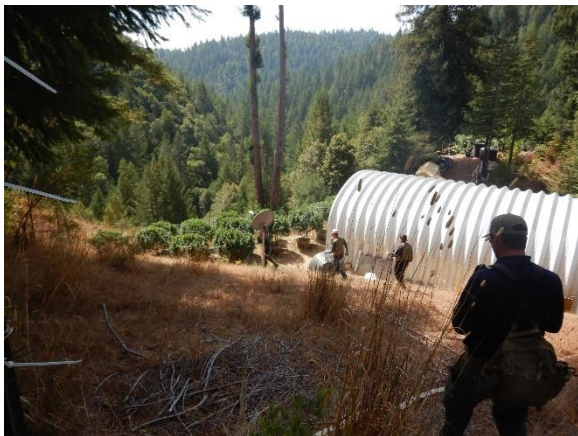
Figure 5. Outdoor cultivation area.