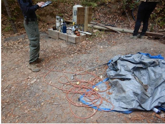
Figure 3. Well