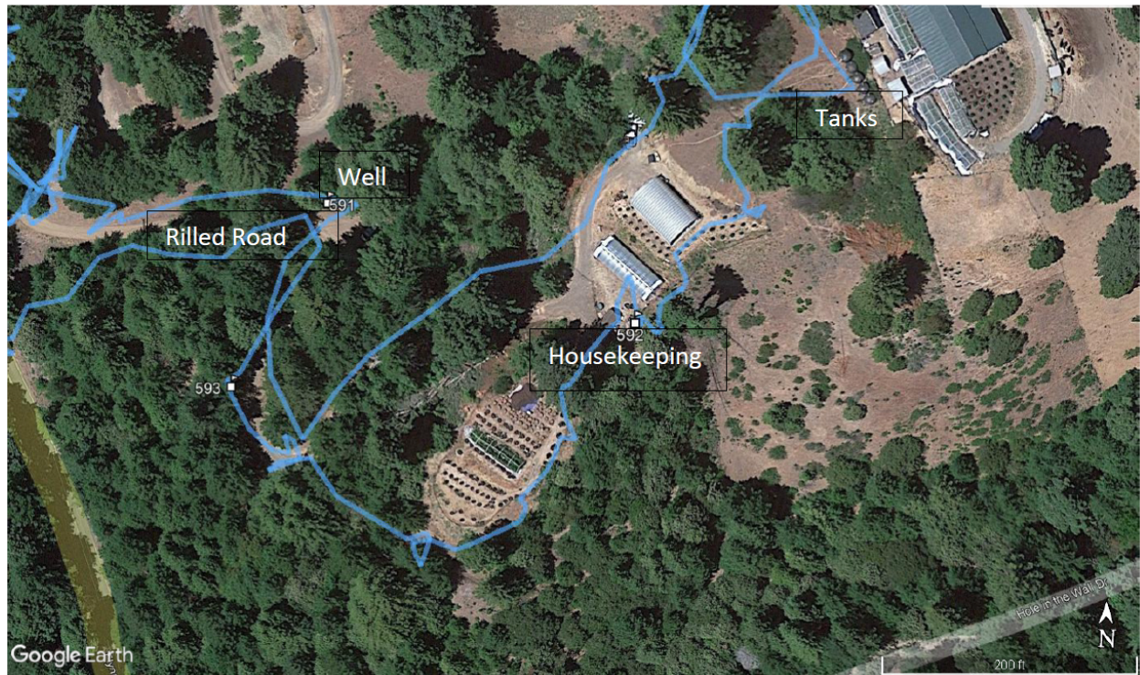
Figure 2. Inspection Map of Property associated with September 8, 2021, Inspection.