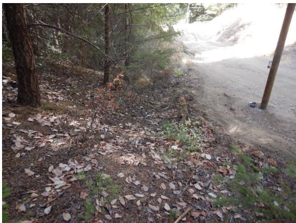
Figure 11. Concentrated stormwater runoff has resulted in sediment erosion and transport but not delivery to a watercourse.