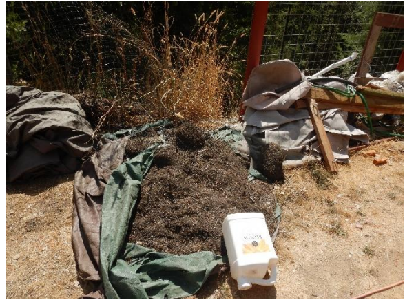
Figure 7. Housekeeping at edge of cultivation area above steep slope.