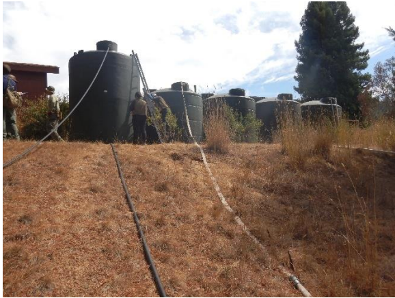
Figure 4. Tanks