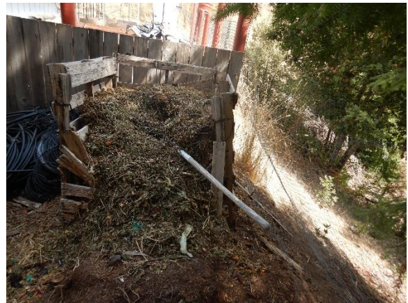
Figure 8. Composting of cultivation waste at edge of steep slope.