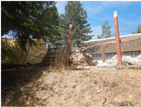
Figure 10. Steep slope below disturbed area.