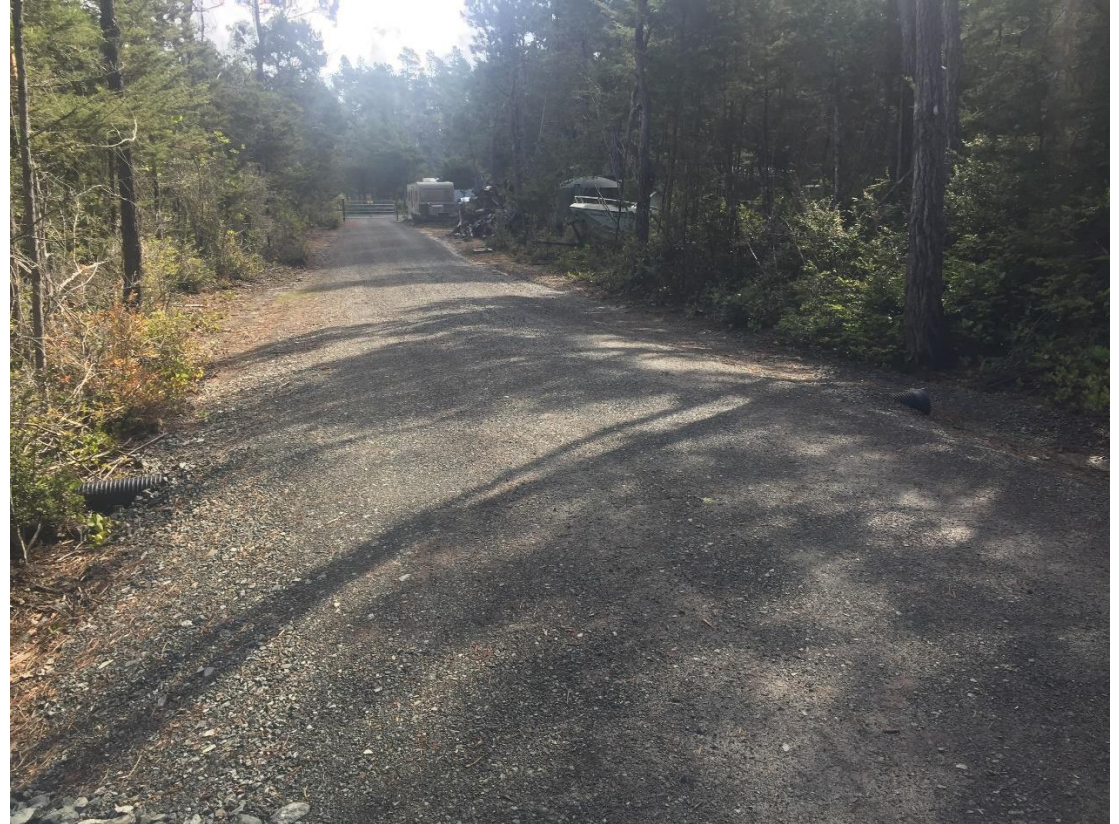
Photo 9: New culvert installed on gravel access road near Deixler property. The culvert appears to outlet toward Deixler property (left side of photo).