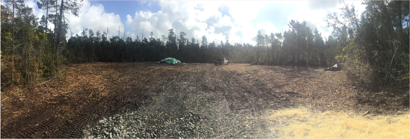
Photo 3: Cleared Area #1 in central portion of southern half of property (end of rocked driveway visible in foreground)