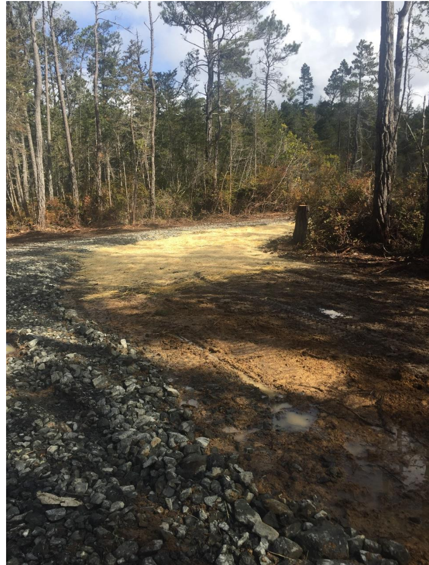
Photo 2: Cleared area east of driveway is muddy and partially covered with straw, looking northeast