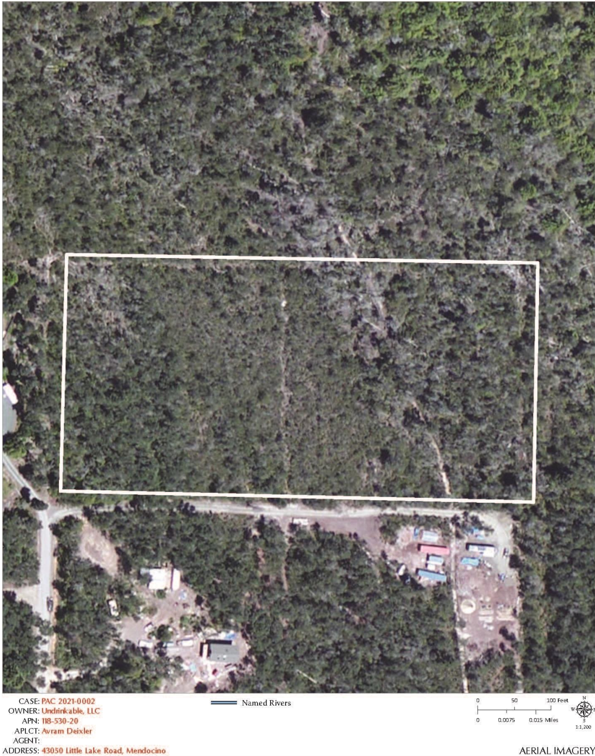
Map 1: Deixler Property, 43050 Little Lake Road, Mendocino