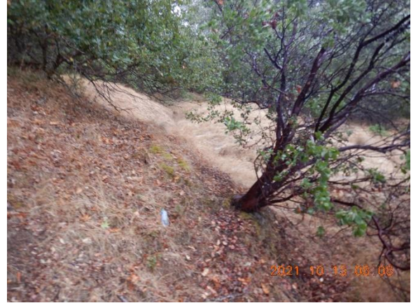
Figure 6. Within the cultivation area, another channel comes down the slope.