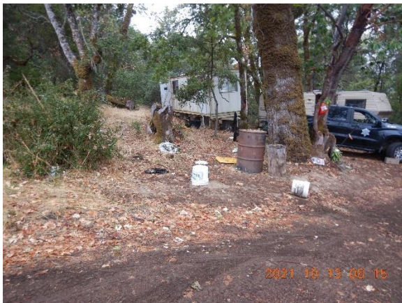
Figure 11. Empty fertilizer containers and domestic trailers.