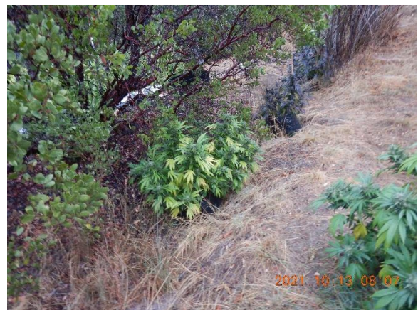
Figure 8. Cannabis cultivation in a channel at CA1.