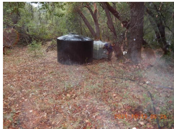
Figure 13. Water appears to be purchased from a neighbor who has a well, and delivers the water for purchase and use at the Property.