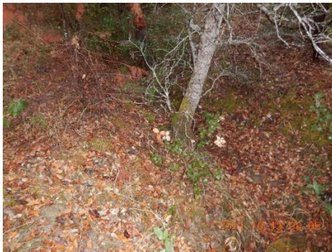
Figure 4. To the west of CA1, I observed a Class III watercourse. The cultivation was within 20' of the streambank.