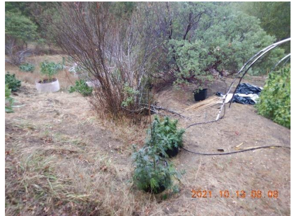
Figure 7. I observed cannabis cultivation in pots within the channel.