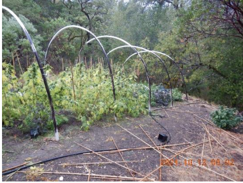
Figure 3. Cultivation area, CA1.