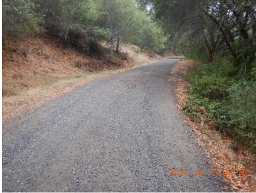
Figure 9. Upslope of the CA1 is the main road, Steelhead Drive. A ditch diverts water that would have gone through the middle channel, but is diverted to a culvert and delivered to the class III to the west, associated with WP 603.