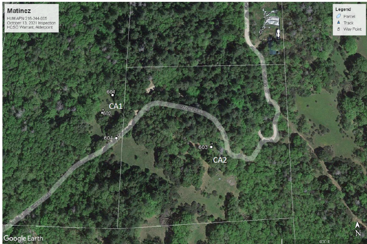
Figure 2. Inspection map of Property.