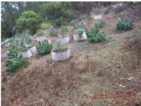
Figure 5. View of the cultivation area, CA1, located within 20' of the streambank.