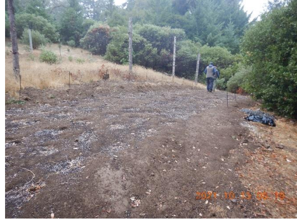
Figure 12. Former cultivation area above CA2, that has been largely cleaned up. Inspection participants told me that they had been on a warrant inspection there in July of 2020 as well, and this area was cultivated then, but not as of my inspection.