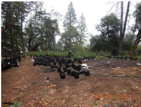
Figure 10. Cultivation at CA1 is on a ridgetop.