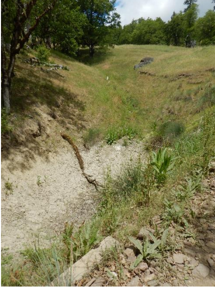
Photo 7: West Road: view of fill and fine sediment in upstream side of watercourse while standing on dam