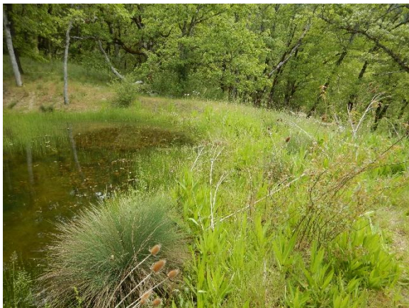
Photo 3: East Pond: small pond fed by spring diversion on neighboring parcel