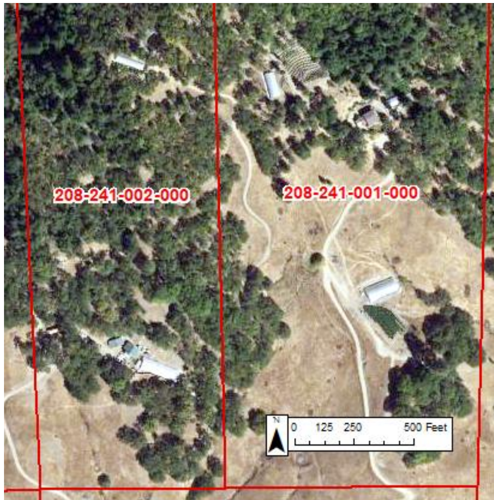
Figure 1: Map showing West Road originating on parcel 208-241-002-000, crossing onto the west side of parcel 208-241-001-000, and terminating at a cultivation area on parcel 208-241-002-000. Red lines are Humboldt County parcel boundaries.