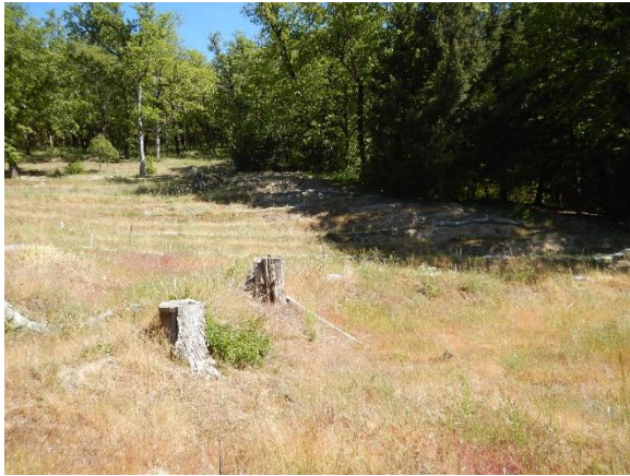
Photo 1: Remediated Cultivation Area: former cultivation site on hillside with wattles and some cultivation related waste