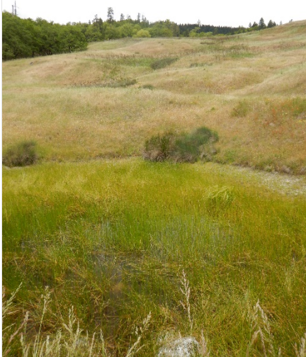
Photo 9: Pond (not mapped): small pond at base of hillside wetland complex, not used by landowner