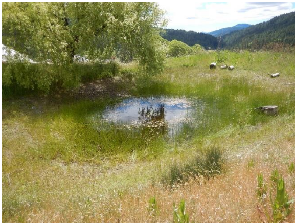
Photo 5: West Pond: small pond with earthen embankment receiving hillside and road runoff