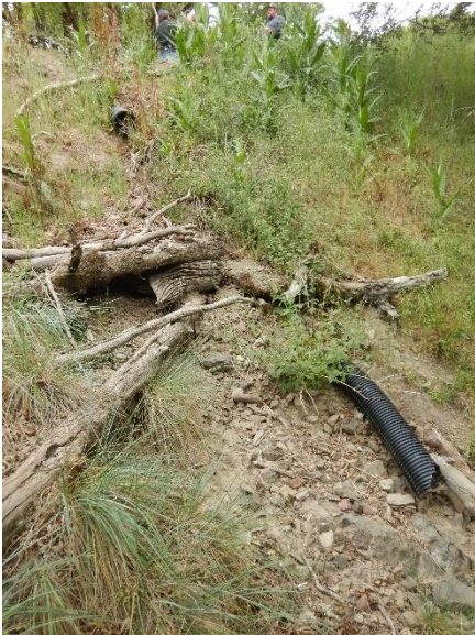
Photo 8: West Road: view of dam fill while standing in downstream side of watercourse