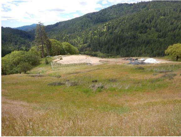
Photo 4: Greenhouse: looking downhill at previous cultivation site covered in straw, and stockpiled cultivation related waste