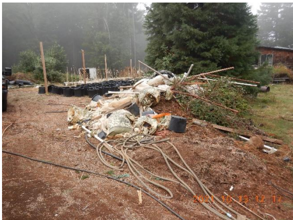
Figure 4. Piles of cultivation related refuse.