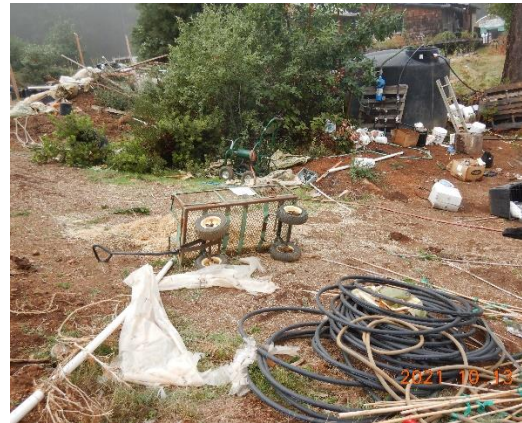
Figure 6. Cultivation-related refuse