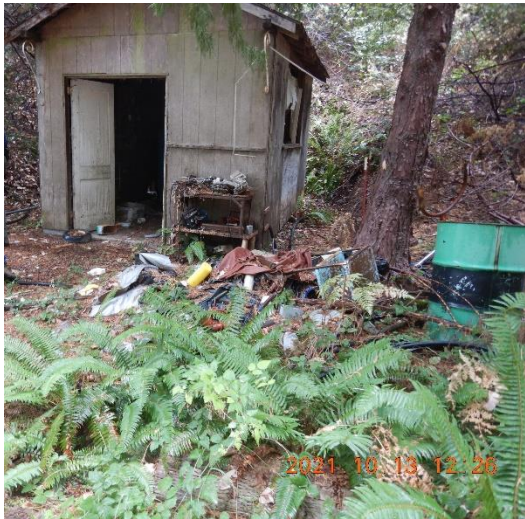
Figure 8. Well house.