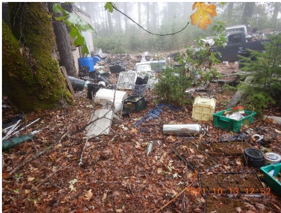
Figure 13. Refuse