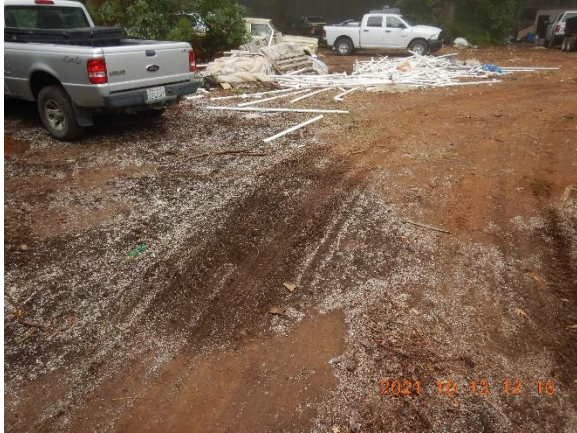
Figure 3. The Property has lots of old grow materials.

All photographs taken by Adona White on October 13, 2021.