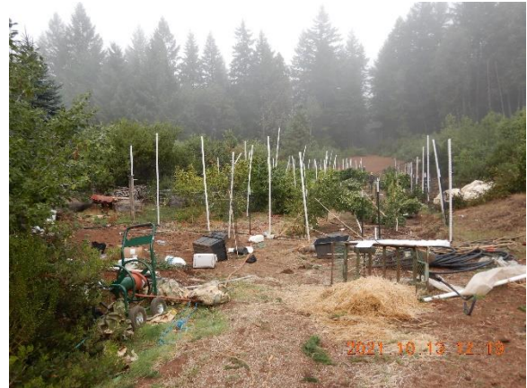
Figure 5. Cultivation area, CA1 exceeds 2000 square feet in area.