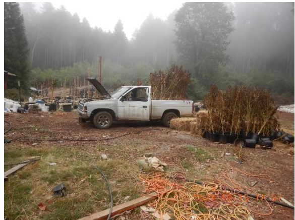
Figure 10. Old plants in back of truck.