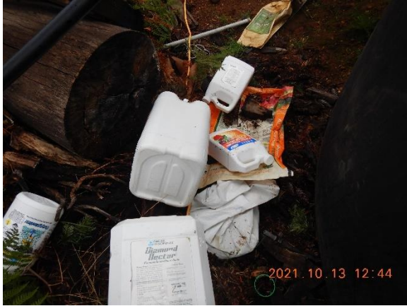
Figure 12. Discarded fertilizer jugs.