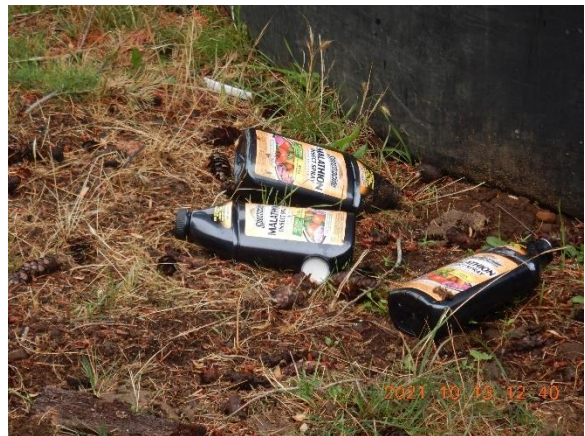
Figure 11. Discarded bottles of Malathion near feed tank.