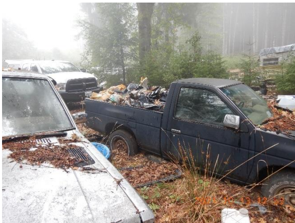
Figure 14. Abandoned vehicles with refuse in back of truck.