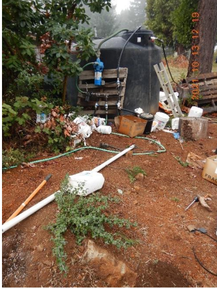
Figure 7. Feed tank with discarded fertilizer jugs.