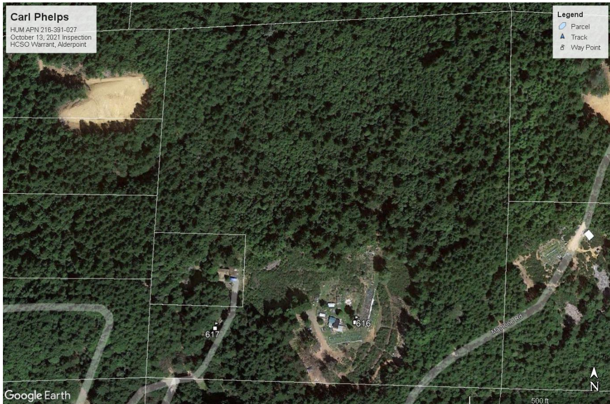
Figure 2. Inspection map of Property.