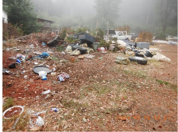
Figure 9. Refuse.