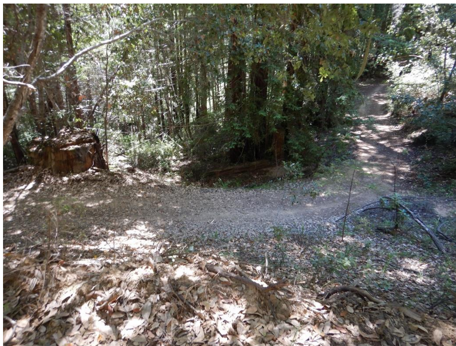
Photo 13—Looking east from northern fork of road towards WQ8 in the center of the image. The road to the west is shaped such that it will collect stormwater for a long distance and direct it to a topographic swale in the right of the image.