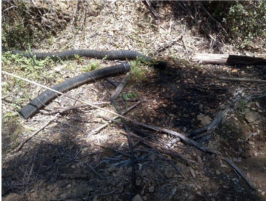
Photo 7—Location, at WQ5, where wastewater discharges from residence on the Property. Staff noted the ground was saturated at the end of the pipe and smelled the odor of waste food and soap.