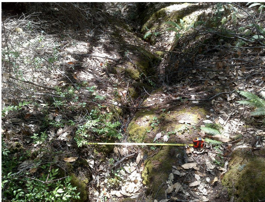
Photo 11—Watercourse at the end of the road at WQ7. The road did not cross the watercourse.