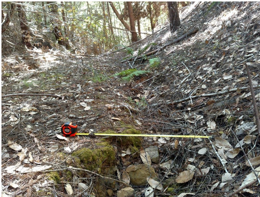
Photo 6—Channelized watercourse located, at WQ4, in the topographic swale pictured in the previous image. The watercourse is the upstream extent of the tributary to Johnson Creek Mapped as a blueline stream in the USGS National Hydrography Dataset.