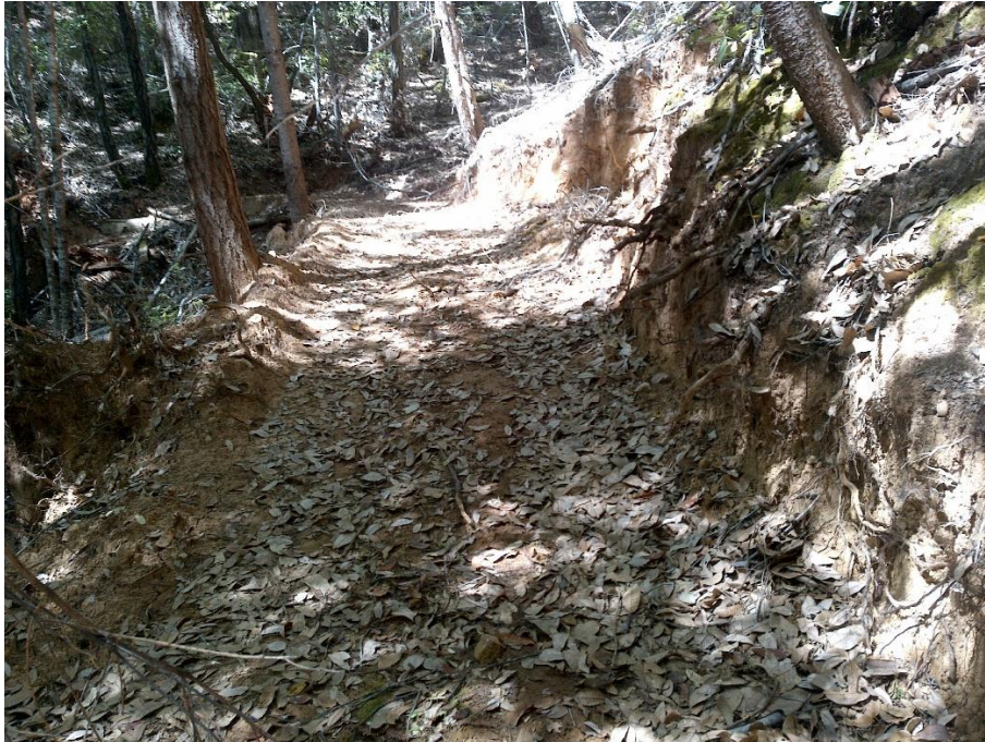
Photo 3—Looking west along road in the vicinity of WQ3. The road is six feet wide and the catface on the opposite side of the road averages three feet high. A berm of earthen spoils borders the out-slope edge of the road, which will concentrate stormwater and erode the road surface.