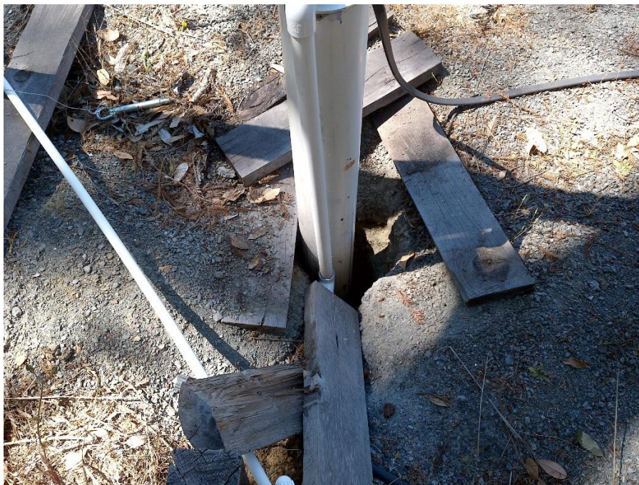
Photo 1—Groundwater well located at WQ1. Cavity where the well protrudes from the ground may allow pollutants from the service to pollute groundwater.