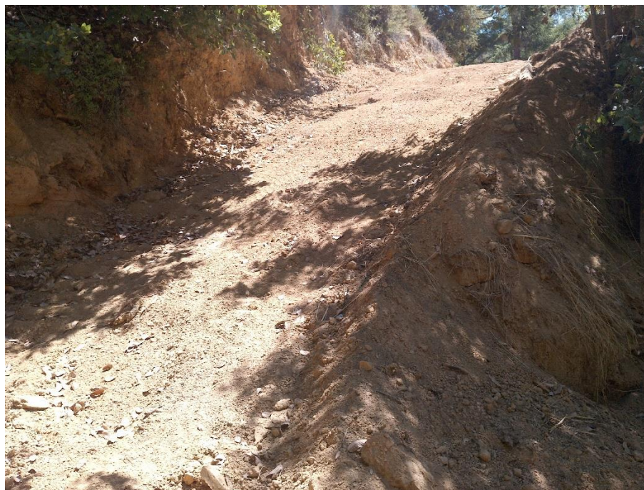
Photo 9—Looking east at earthen spoils on the downslope edge of the road in the vicinity of WQ6.