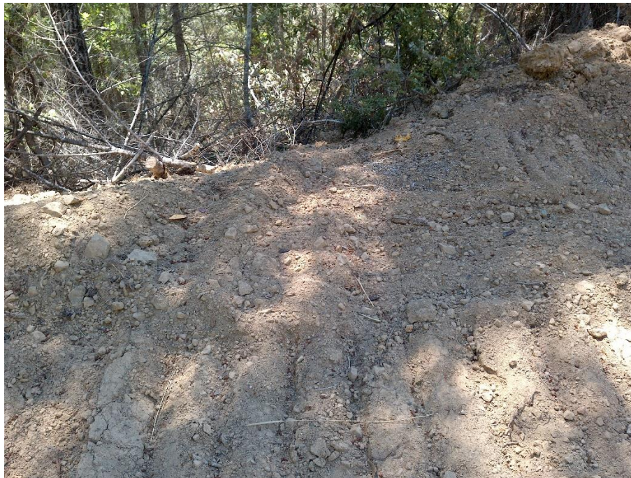
Photo 8—Earthen spoils on the downslope edge of the road in the vicinity of WQ5.