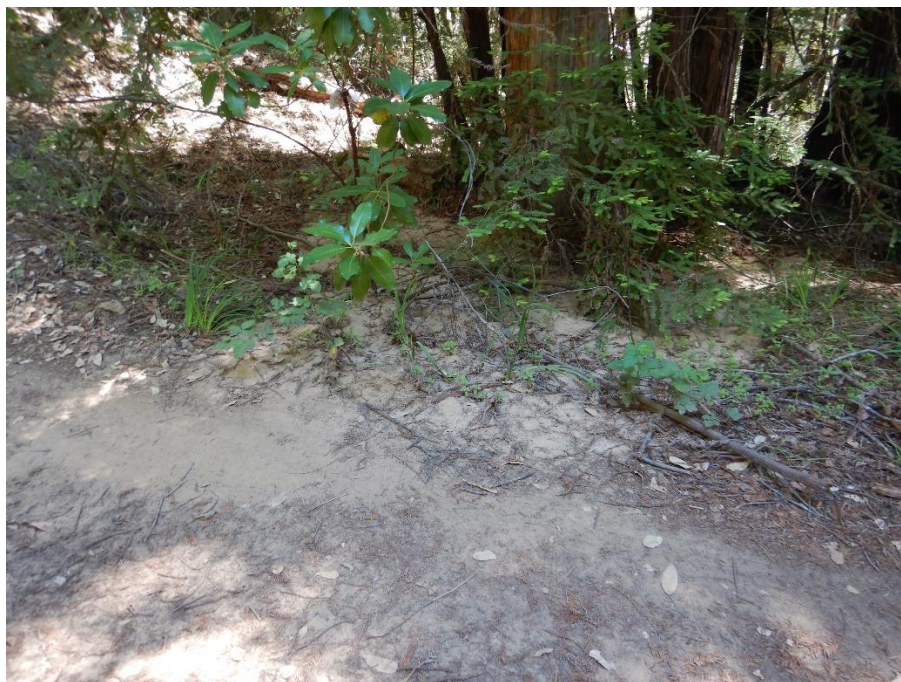
Photo 12—Fine sediment uniformly deposited on out-slope edge of the road at WQ8.