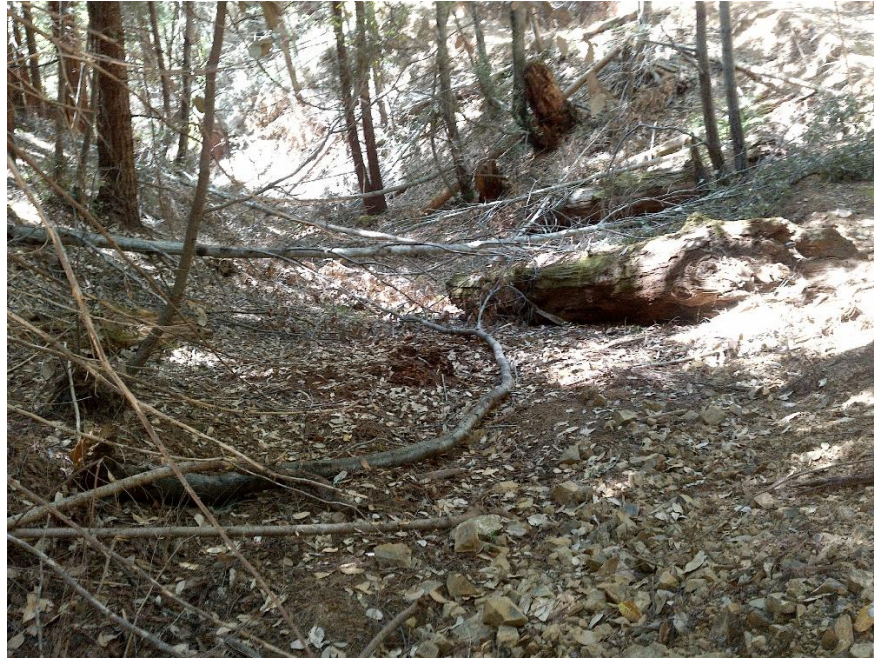
Photo 5—Looking south east from the road pictured in the previous image. Cobbles from creating the road are in the foreground of the image. A channelized channel, that is pictured in the following image, is visible in the middle back of this photo.