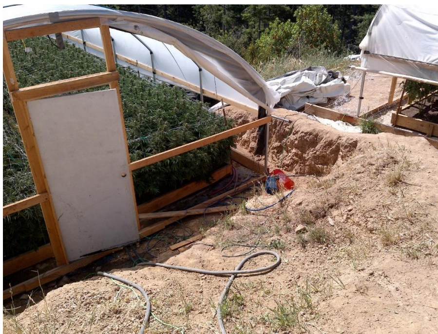
Photo 2—Looking south between two hoop-type greenhouses with growing cannabis plants at WQ2.