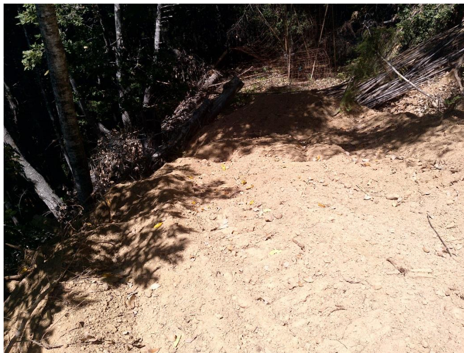
Photo 10—Looking west at earthen spoils on the road in the vicinity of WQ6.