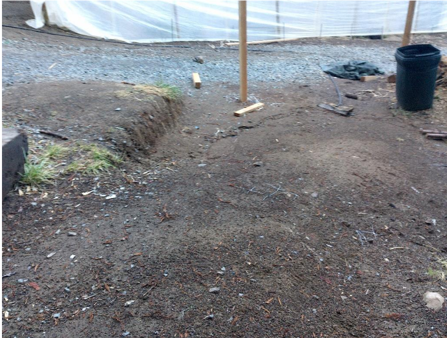
Photo 5—Looking southwest at rilling from stormwater on a graded road surface at WQ4.