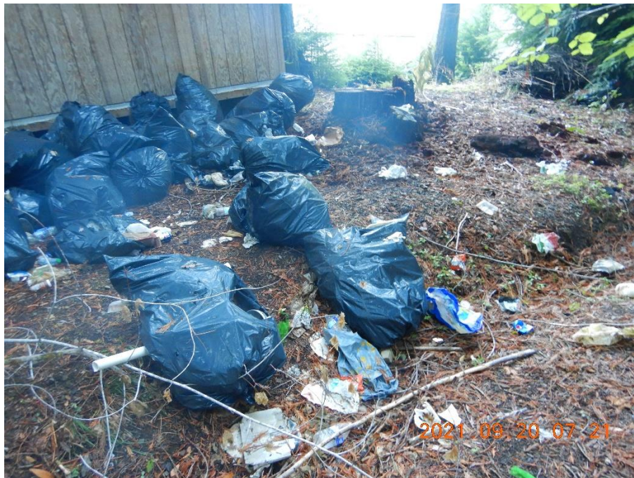
Photo 6—Refuse located at WQ5. The tributary the South Fork Eel River that passes through WQ2 is visible passing from the bottom of the image to the right of the image. The refuse is within the tributary and where it threatens to discharge into the tributary.