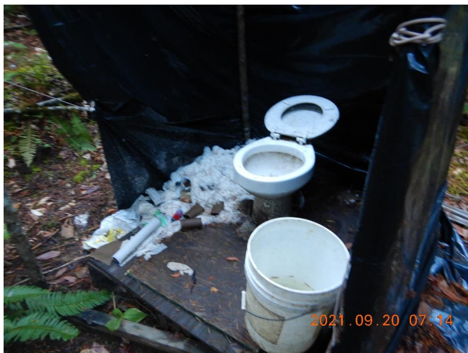
Photo 7—Toilet located at WQ6. The human waste collected at the toilet threatens to discharge to the tributary to the South Fork Eel River to the south.