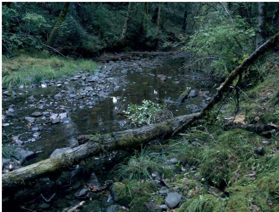
Photo 1—Looking northwest and downstream at the South Fork Eel River in the vicinity of WQ1.