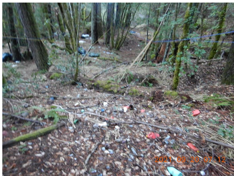
Photo 8—Refuse, including unlabeled chemical containers, located at WQ7.