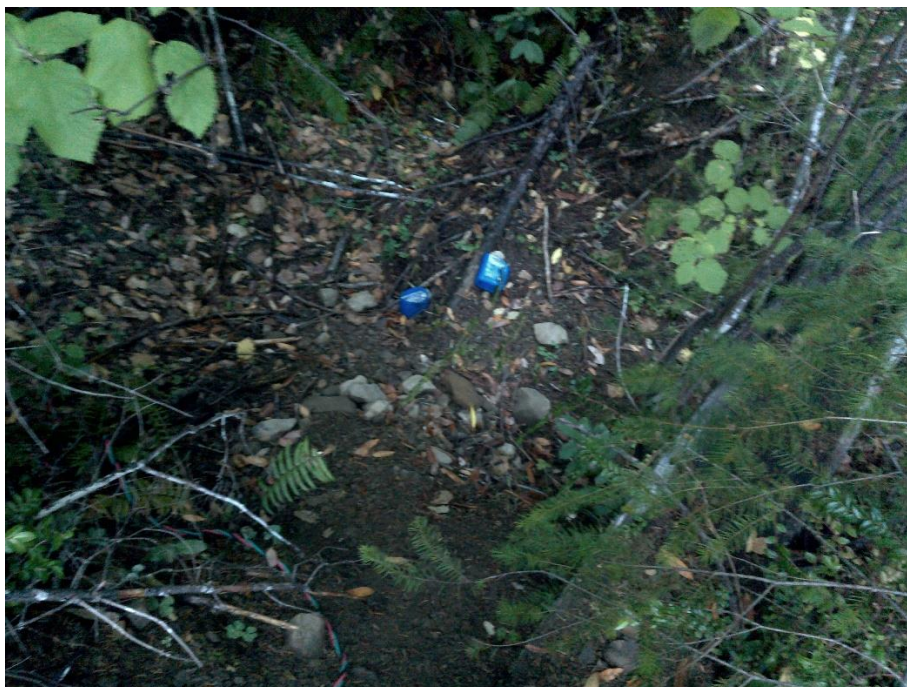
Photo 3—A tributary to the South Cork Eel River at WQ2. Motor oil containers are within the banks of the watercourse and the same electrical wire that was visible at WQ1 is visible at the bottom of the image.