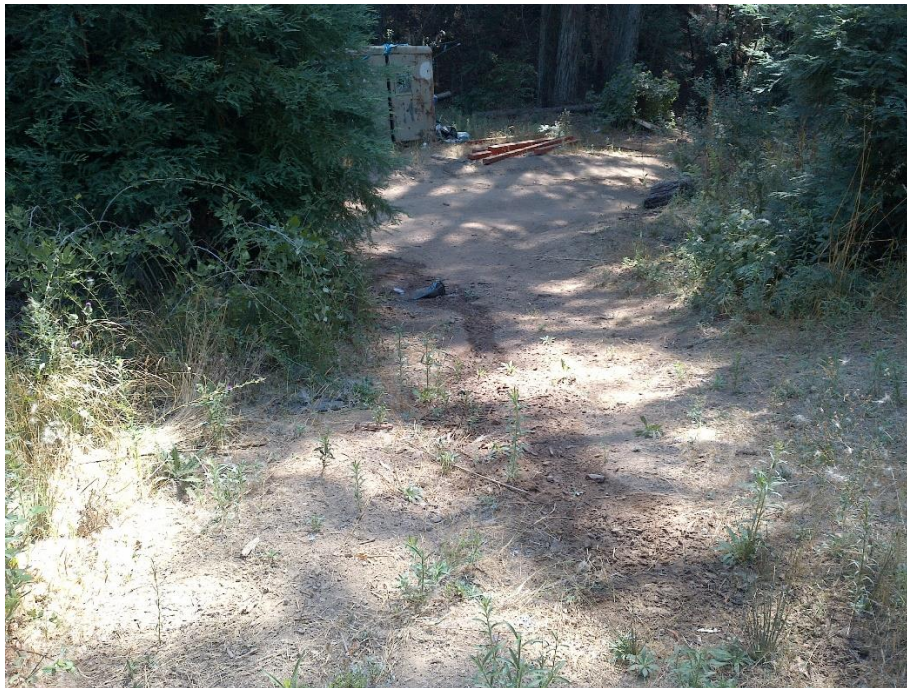
Photo 2— Looking east toward WQ1. A shipping container is visible in the top-middle of the image.