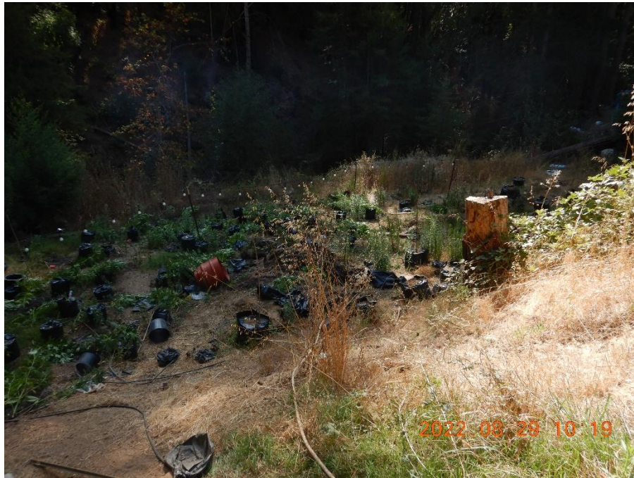
Photo 5— Cannabis cultivation areas east of WQ2, Hulbert Creek runs from left to right in the top of the image.