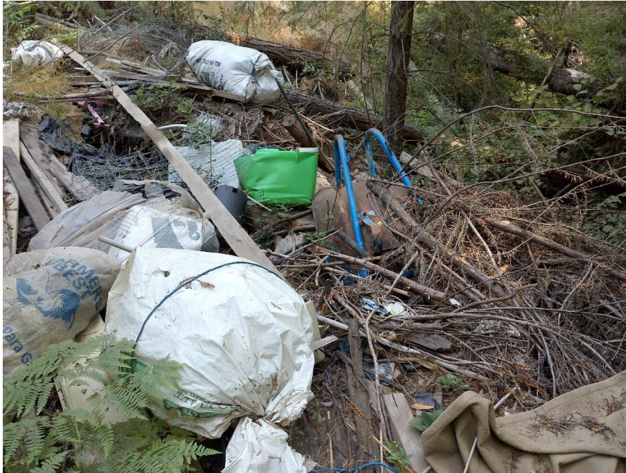
Photo 3—Waste materials and slash located between shipping container at WQ1, pictured in previous image, and Hulbert Creek.