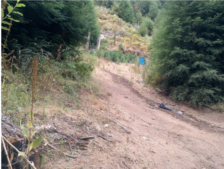
Photo 1— Looking north-west from WQ1 toward a pad with cannabis plants growing in the top center of the image. Water from excess irrigation is visible in the middle of the image.