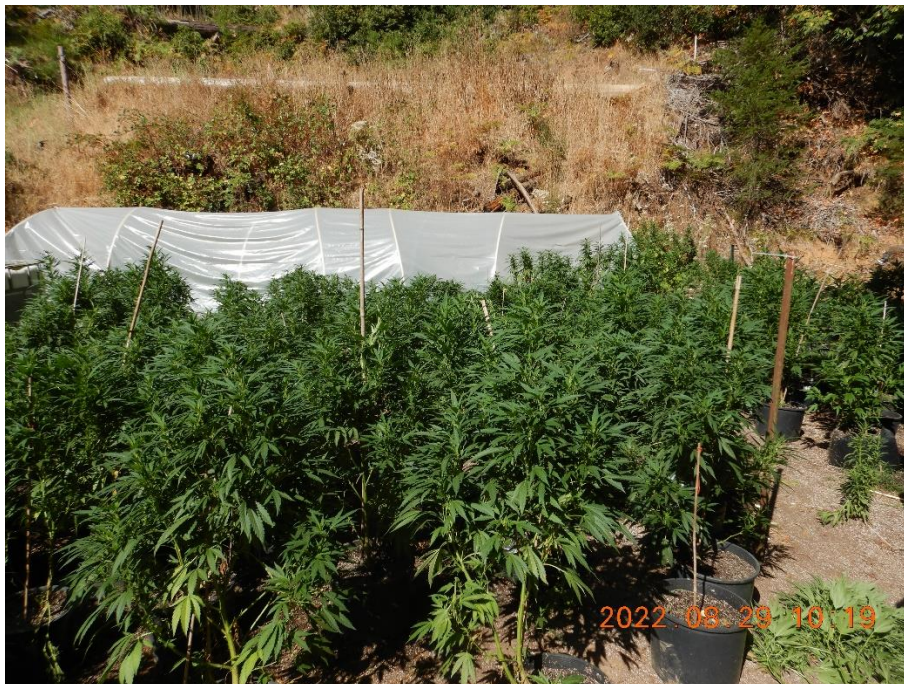
Photo 4—Cannabis cultivation areas adjacent to the road north of WQ1 and west of WQ2.