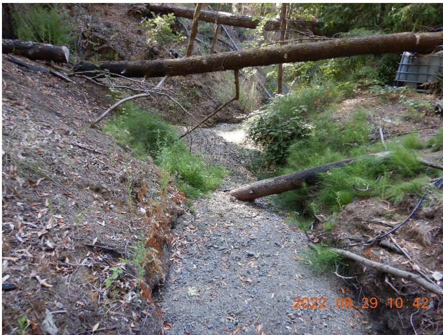
Photo 6— Looking south and downstream at Hulbert Creek in the vicinity of WQ2. A crushed fluid storage tank, which is commonly used for mixing agricultural chemicals, is visible in the top right of the image.