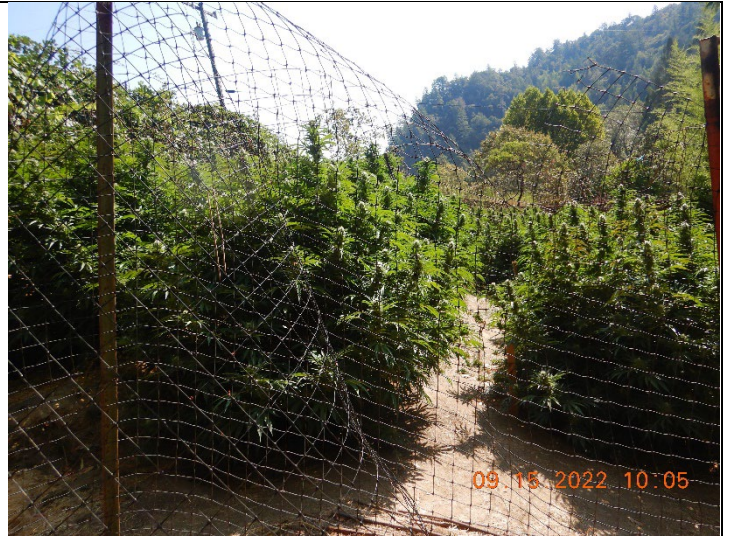
Photo 2: Outdoor cannabis cultivation southeast of inspection point WQ2