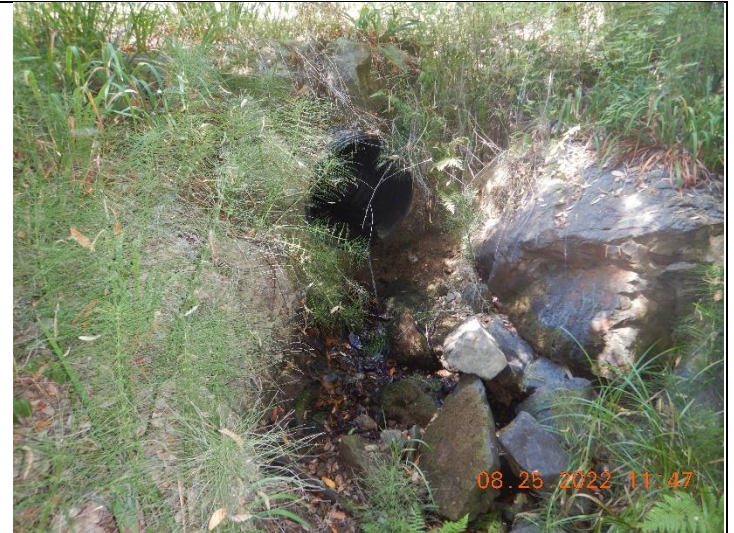
Photo 2: Outlet of an improperly installed culverted stream crossing at inspection point WQ2