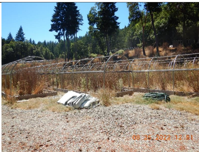
Photo 8: Cultivation area without active cultivation at Inspection point WQ8