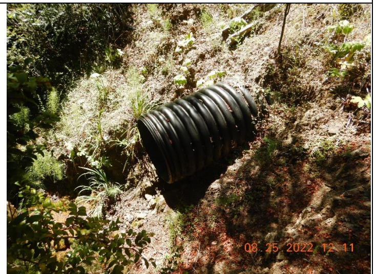
Photo 4: Outlet of an improperly installed culvert at inspection point WQ4