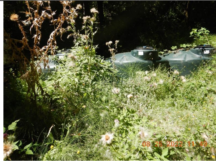
Photo 1: Water Storage tanks within riparian setback at inspection points WQ1