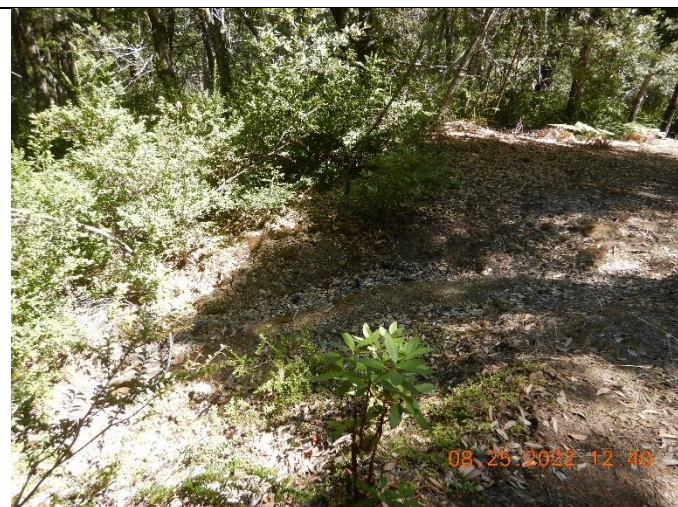
Photo 7: Road erosion near a rock ford stream crossing at Inspection point WQ7