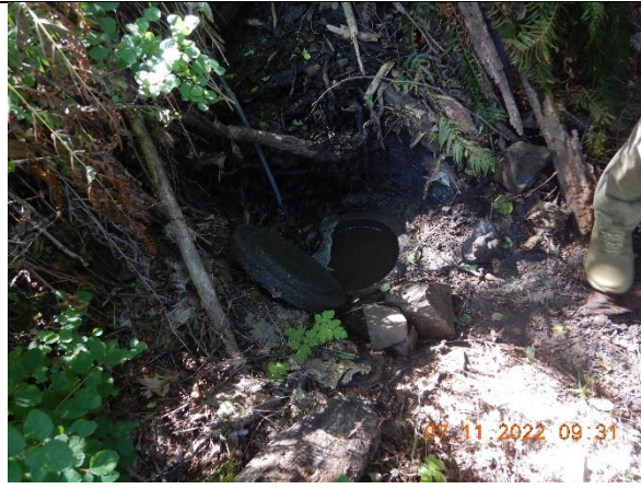
Photo 2: Point of diversion (POD) at a spring at inspection point WQ2