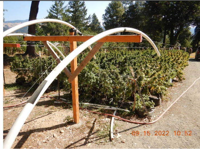
Photo 1: Outdoor cannabis cultivation south of inspection points WQ1