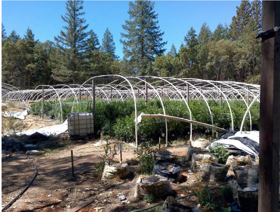
Photo 1— Looking north from southern edge of a one-acre cultivation area at WQ1.