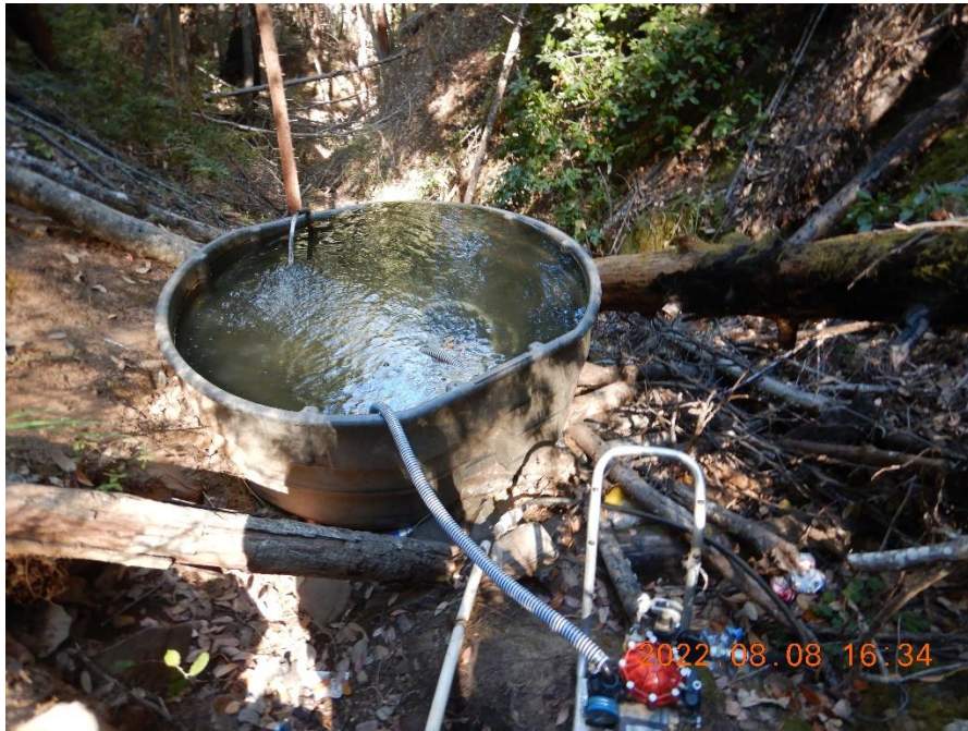
Photo 3—Water diversion infrastructure within a watercourse at WQ2.