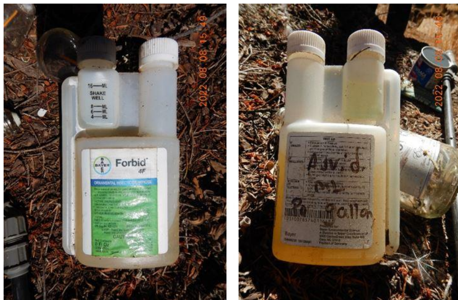
Photo 2—Shows the front and back of a pesticide container located at WQ1. The container contains Spiromesifen.