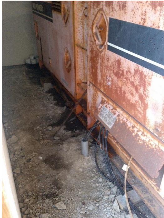
Photo 3— Looking inside structure at WQ3. The floor of the structure appears to be semi-permeable compacted earth. The structure houses two large generators and stains from leaking oil are visible below the generator towards the back of the image.