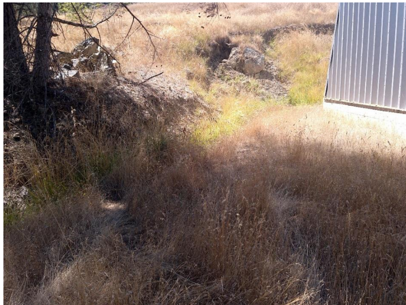
Photo 4— Looking west at the southern edge of the generator building located at WQ3. The hillside in the background of the image appears to have been cut into to accommodate the generator building. Plants from the genus Juncus are visible in the cut face of the hillslope and a trench leaves the cut-face to the bottom left of the image.