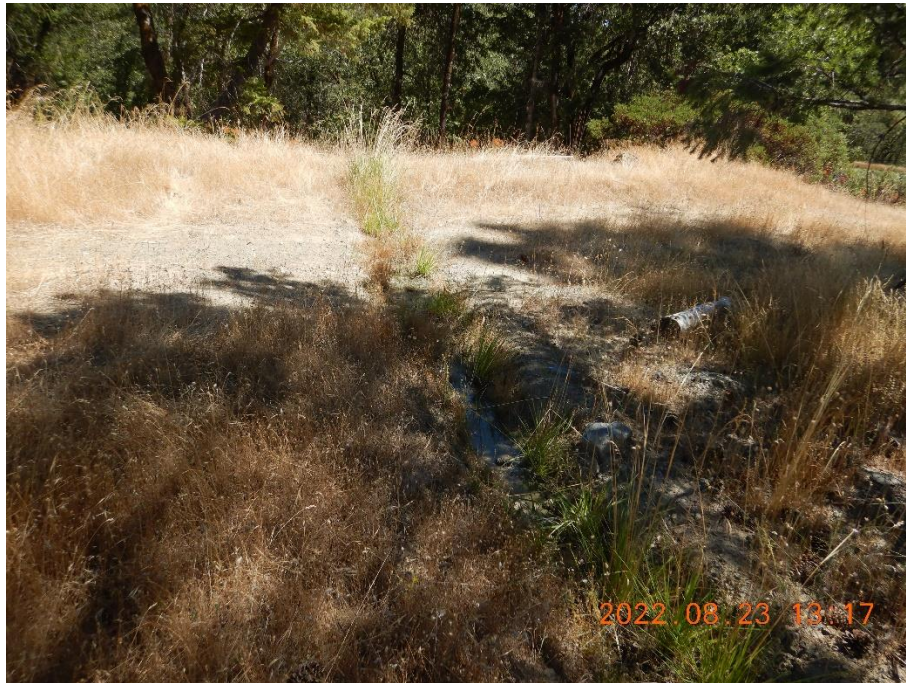
Photo 5— Looking east where a road fords the trench pictured in the previous image. Pooled water is visible in the trench and the plant genus is growing in the trench.