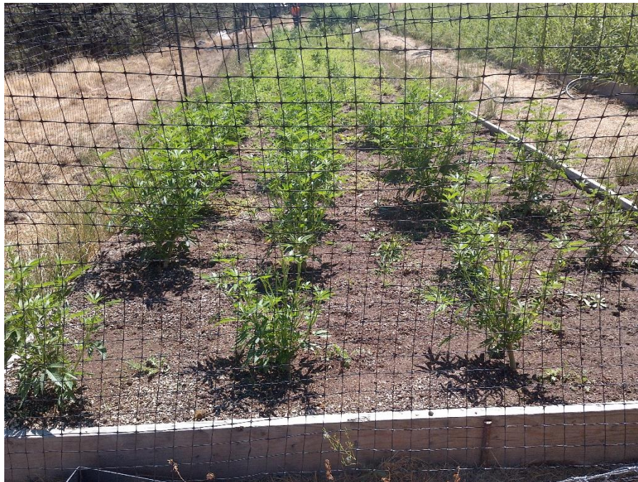
Photo 2— Cannabis plants being grown in raised garden beds at WQ2.