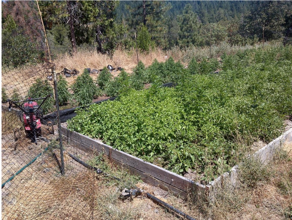
Photo 1— Cannabis plants, intermixed with other plants, in raised garden beds at WQ1.