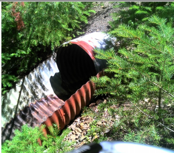
Photo 11: pond overflow culvert and downspout at inspection point WQ8