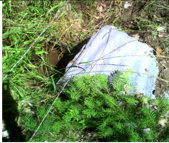
Photo 8: outlet of a culverted stream crossing at inspection point WQ4