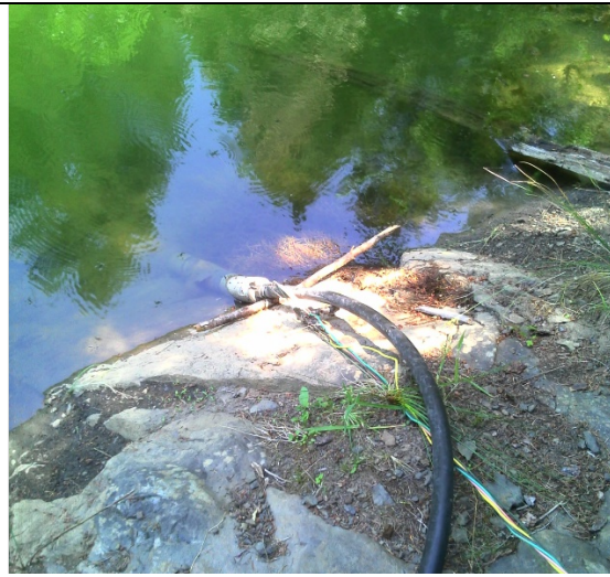
Photo 10: Point of diversion at an onstream pond at inspection point WQ7