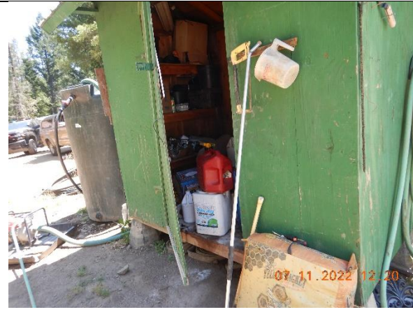
Photo 2: Properly contained petroleum products and fertilizers at inspection point WQ1