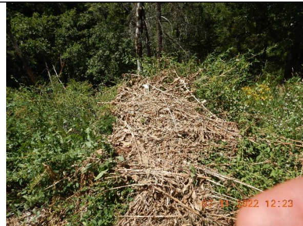
Photo 4: improperly disposed cannabis plant waste near inspection point WQ2