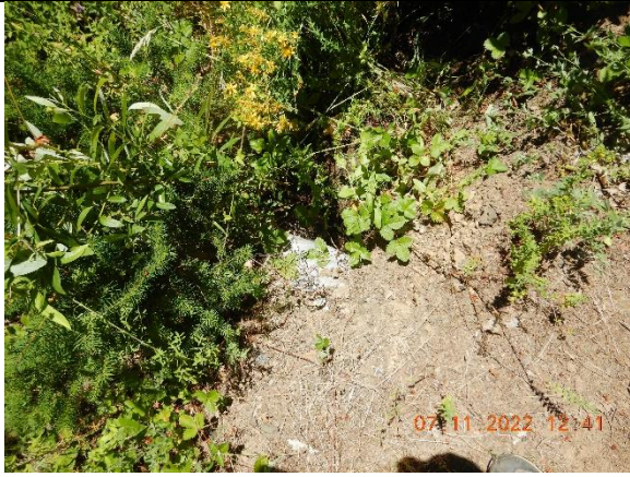
Photo 7: inlet of a culverted stream crossing at inspection point WQ4