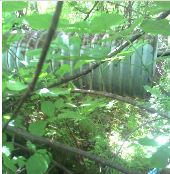
Photo 12: outlet of a culverted stream crossing installed high in the fill at inspection point WQ9