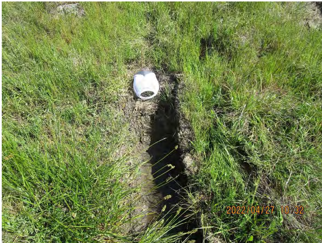
Closeup of approximately one-foot deep rut adjacent to stream channel with cap for scale.