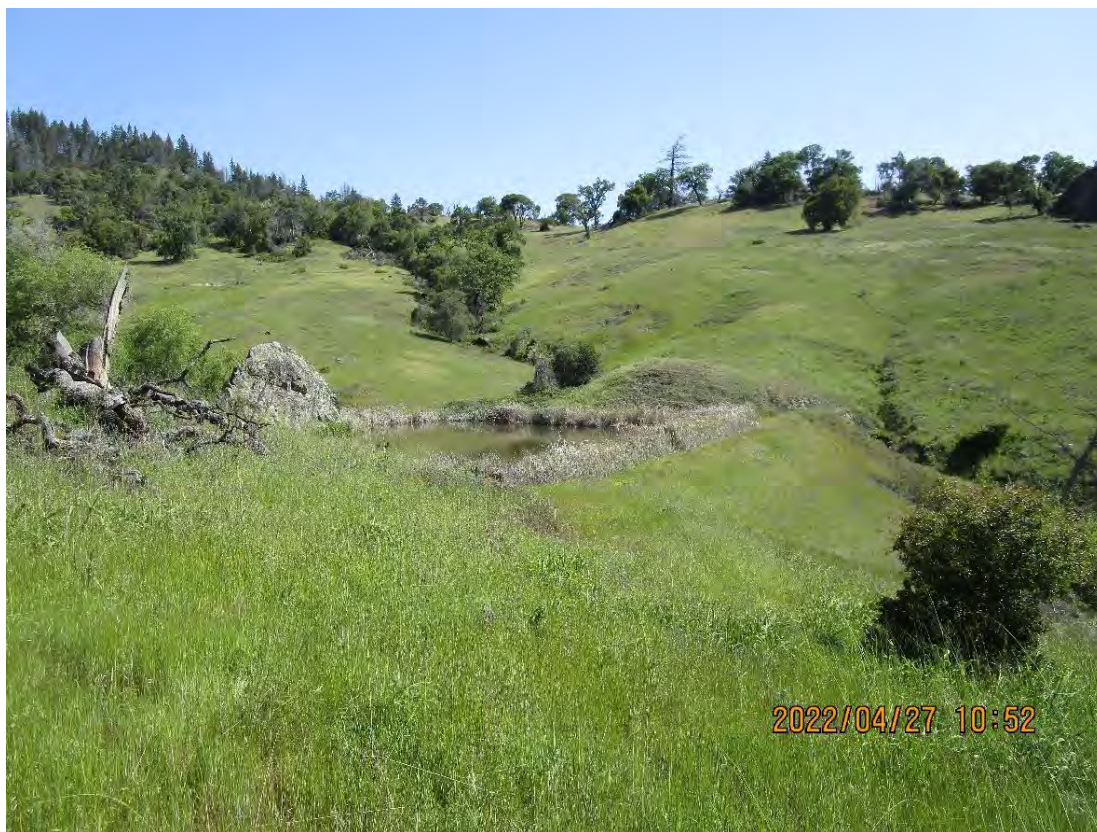
Photo of area upslope of offroad stream crossing taken from approximate location where offroad path leaves the grass covered seasonal road leading to the pond. The recommended access road with a culverted stream crossing is located near the top of the photo.