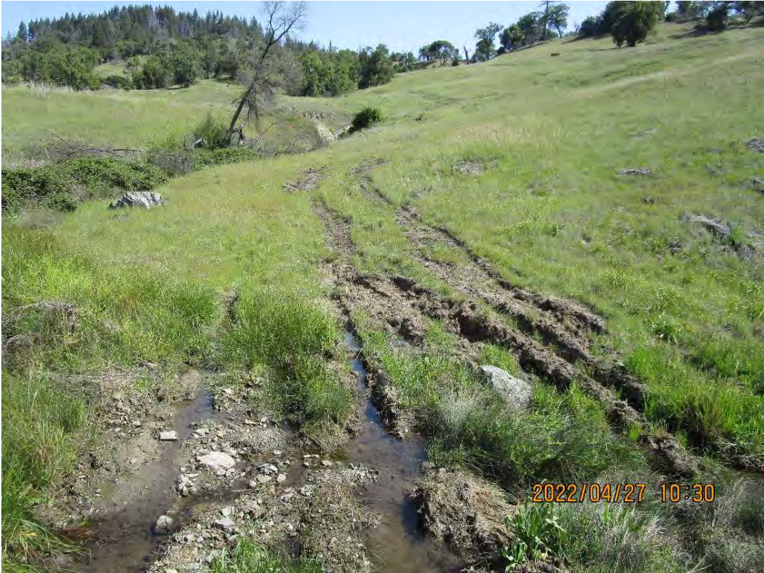
View facing north of north side of stream and damage to channel and banks.