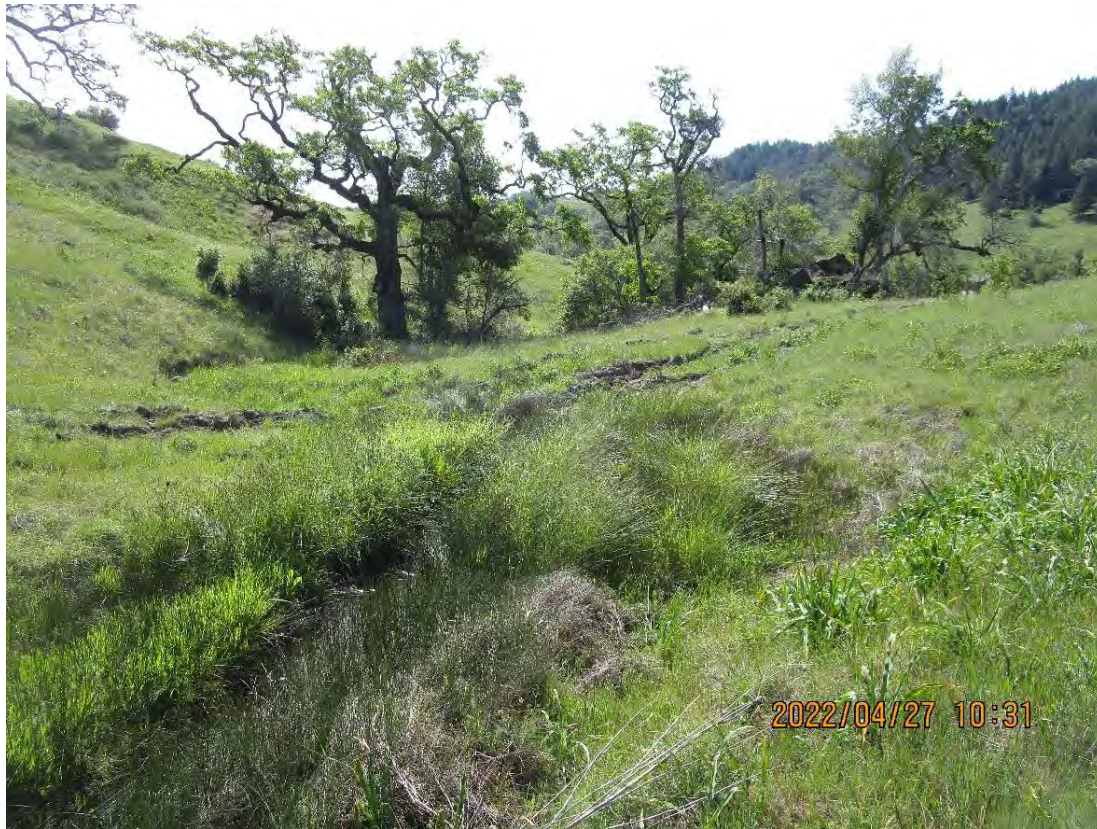
View of stream crossing area facing downstream.