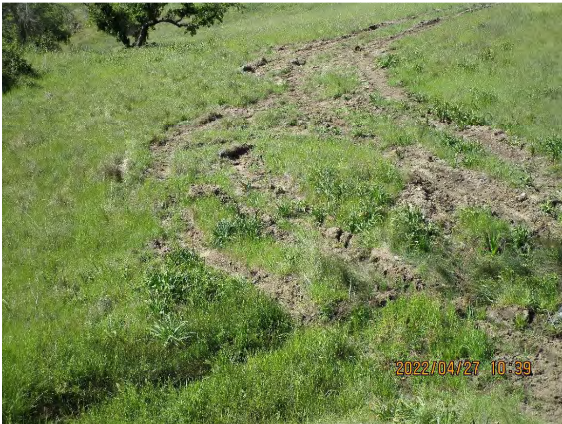
View facing south showing damage to channel and banks on south side of stream.