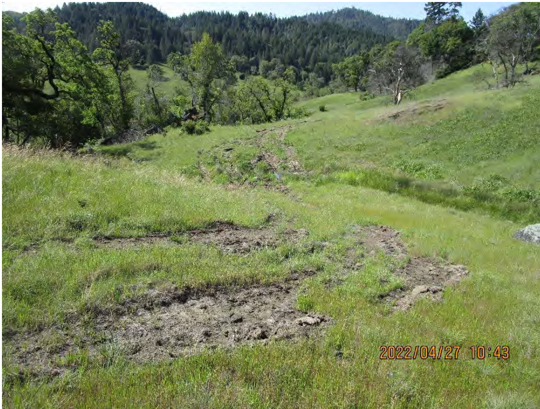
Overview of stream crossing damage facing southwest showing channel and slope damage and evidence of multiple offroad stream crossings.