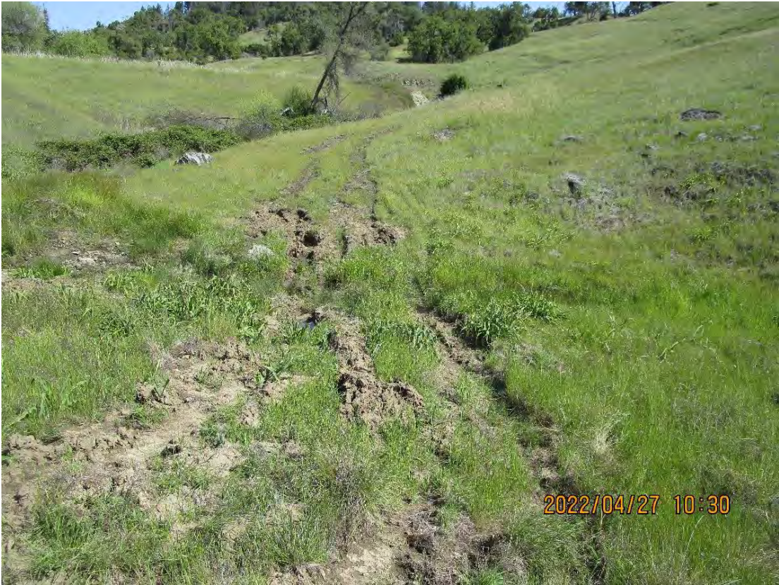
View of stream channel crossing and associated damage facing north.