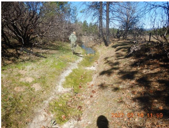
Figure 24. Pond overflow ditch with algae.