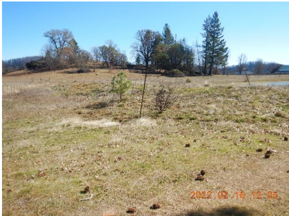
Figure 17. The downstream pond berm is not overly steep and I did not see any cracking or other signs of instability or erosion.