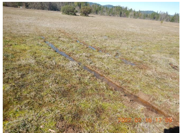
Figure 21. Pooled water in tire tracks near pond.