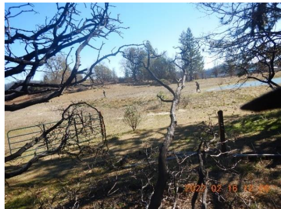
Figure 16. View of downstream pond berm.