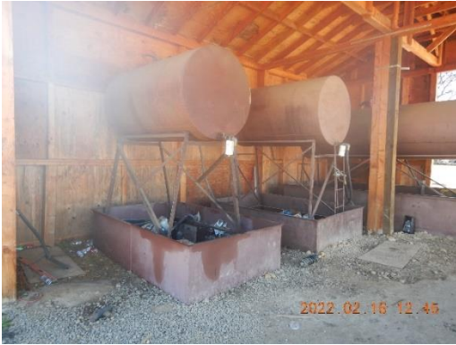
Figure 11. Three above ground fuel storage tanks under roof, items stored in containment vessel.