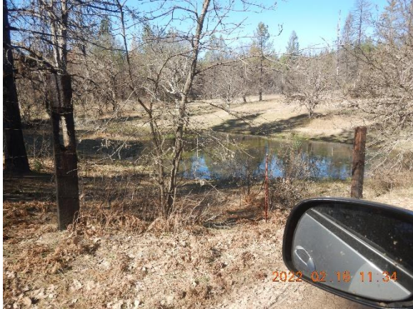
Figure 5. Unnamed tributary to Kettenpom Creek at stream crossing on access road to Property.

All photographs taken by Adona White on February 16, 2022.