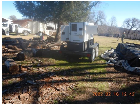
Figure 9. Generator on a trailer.