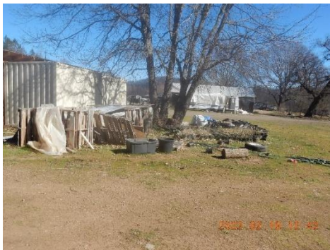
Figure 7. Shipping container, with greenhouses in distance.