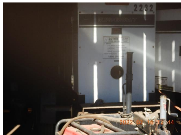
Figure 10. Generator in a shed.