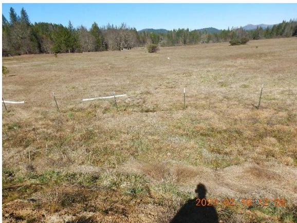
Figure 19. View of ground from base of berm.