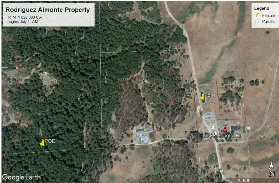
Figure 4. Map showing reported point of diversion relative to the Property, with parcel boundaries and pond.