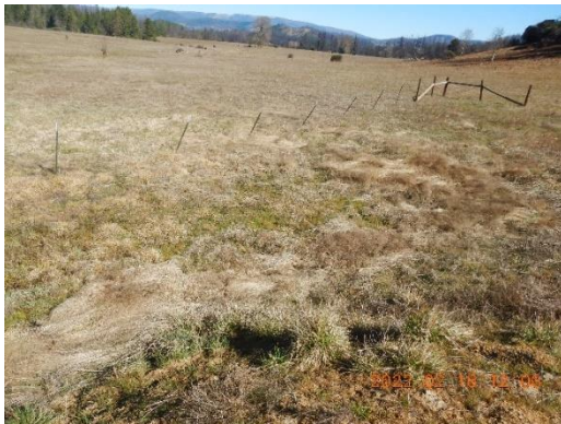
Figure 18. View of ground from base of berm.