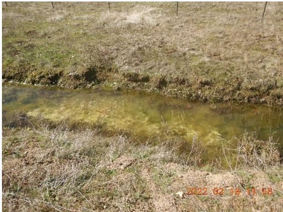
Figure 23. The pond overflows via a ditch to hydrologic divide to the north. The ditch is full of algae.