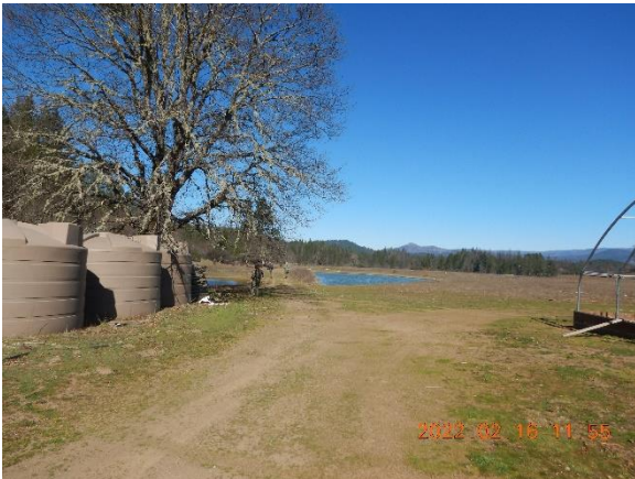
Figure 12. Access road, water tanks, pond, and corner of greenhouse on photo right.