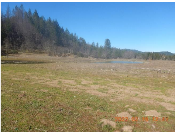
Figure 13. View of pond with access road dividing them, on the left upstream.