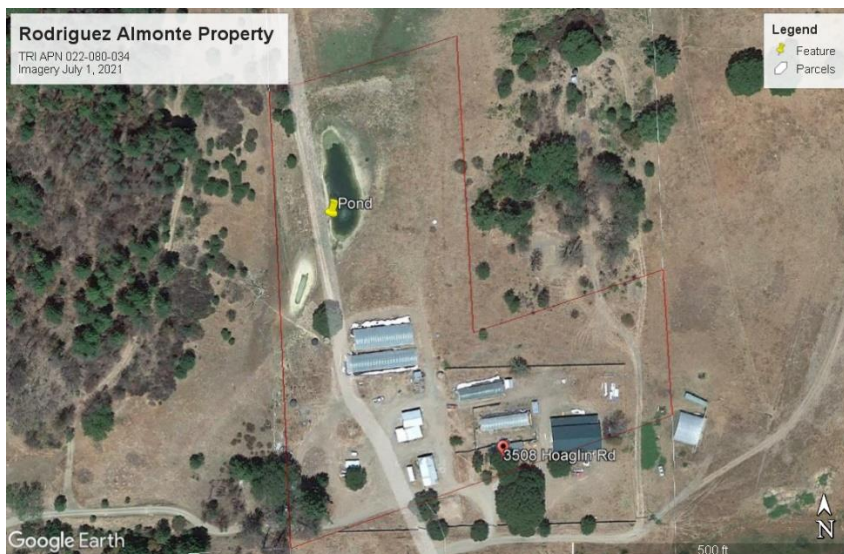
Figure 2. In 2020 the August Complex wildfire burned through the Property. Property development includes a residence, outbuildings, greenhouses, a pond, and an access road to the parcels to the north.