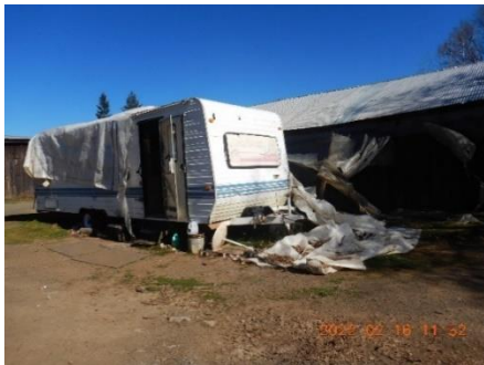
Figure 6. The Property includes a series of outbuildings, shipping containers and trailers.