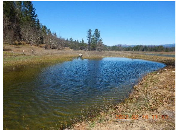
Figure 15. Upstream pond, upstream of access road, looking downstream.