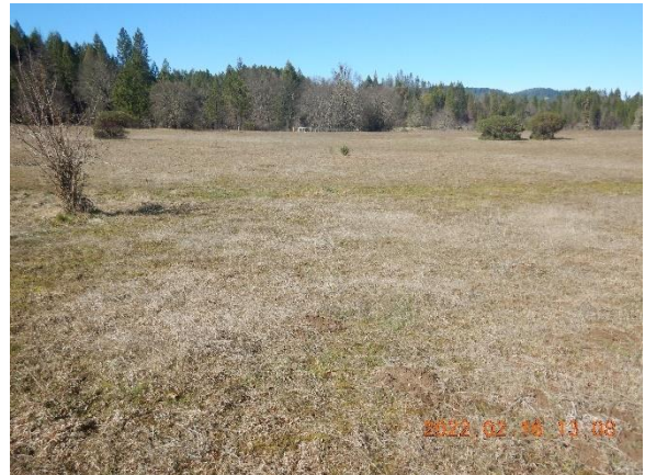
Figure 20. Swath of potential wetland near pond.