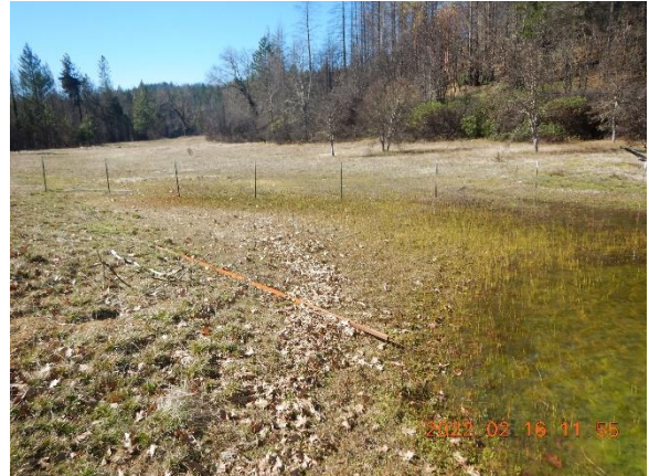
Figure 14. Upstream portion on pond, looking upstream.