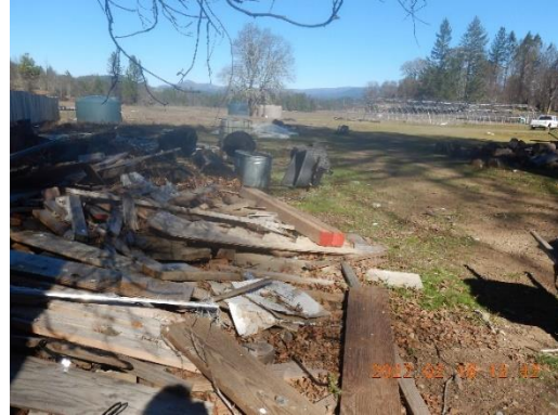
Figure 8. Burned boards with greenhouses in distance.