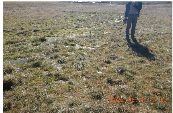
Figure 22. Surface water flowing downgradient, downstream of pond.