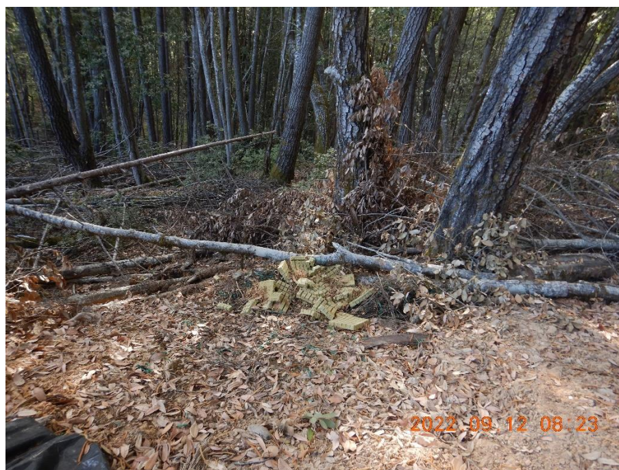
Photo 16—Cannabis cultivation waste, including plant growth media between WQ6 and WQ7.