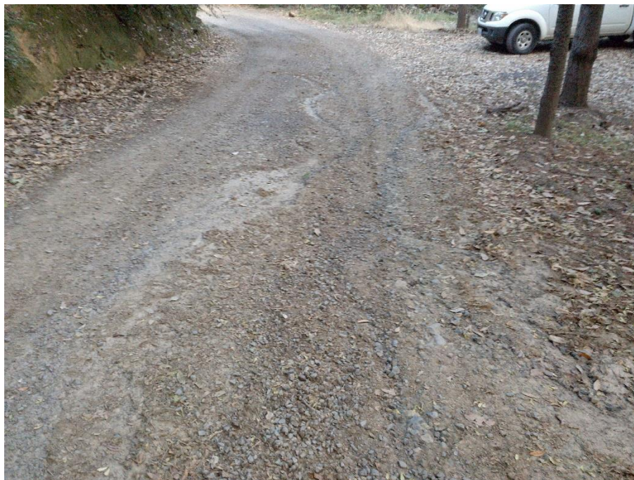
Photo 1—Looking north along the road accessing the property west of WQ1. Sinuous scour marks on the road surface are visible in the middle of the image.