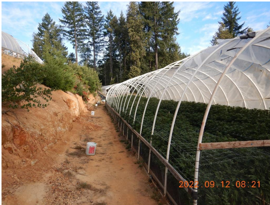
Photo 13—Looking west from WQ6 at terraced pads with cannabis hoop-type greenhouses.