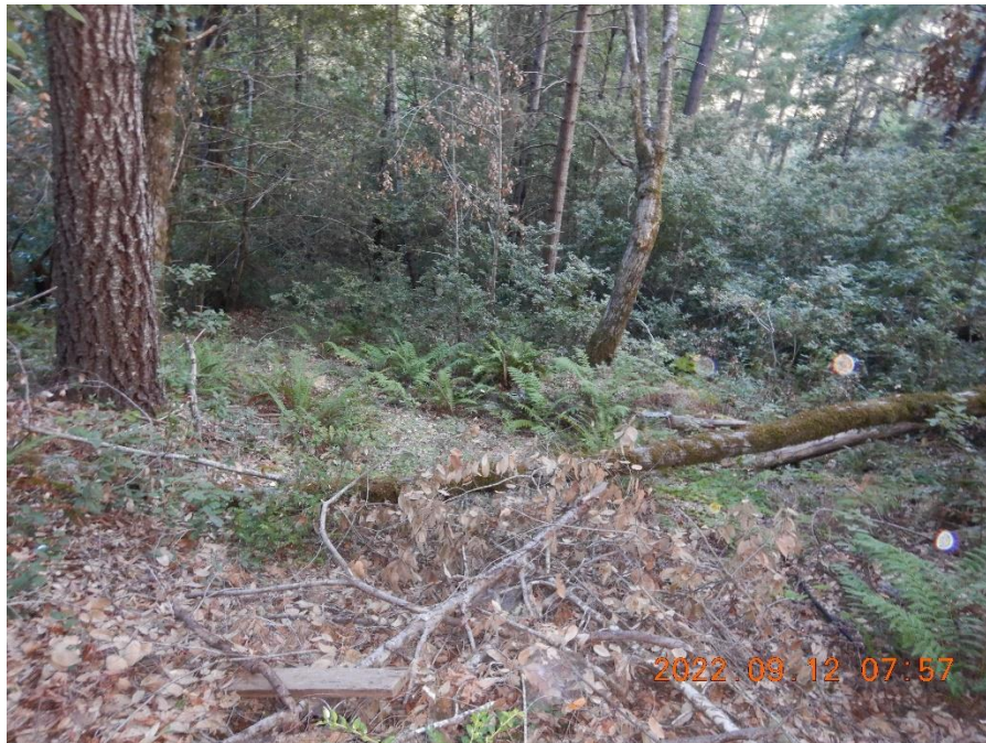
Photo 8—Looking north from WQ4. There is no surface water visible immediately downslope from the excavated pits that are behind the photographer.