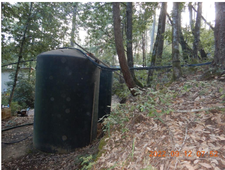
Photo 6—Looking east from WQ3. Water tanks with black water lines extending from the top of the tanks to the south, (right side of the image).