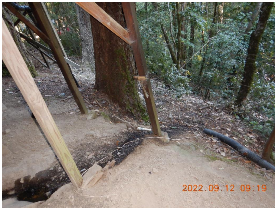
Photo 3—Looking north from WQ1. Sewage is visible leaking from the septic tank in the lower left of the image and flowing north toward Broaddus Creek which is out of view to the right of the image.