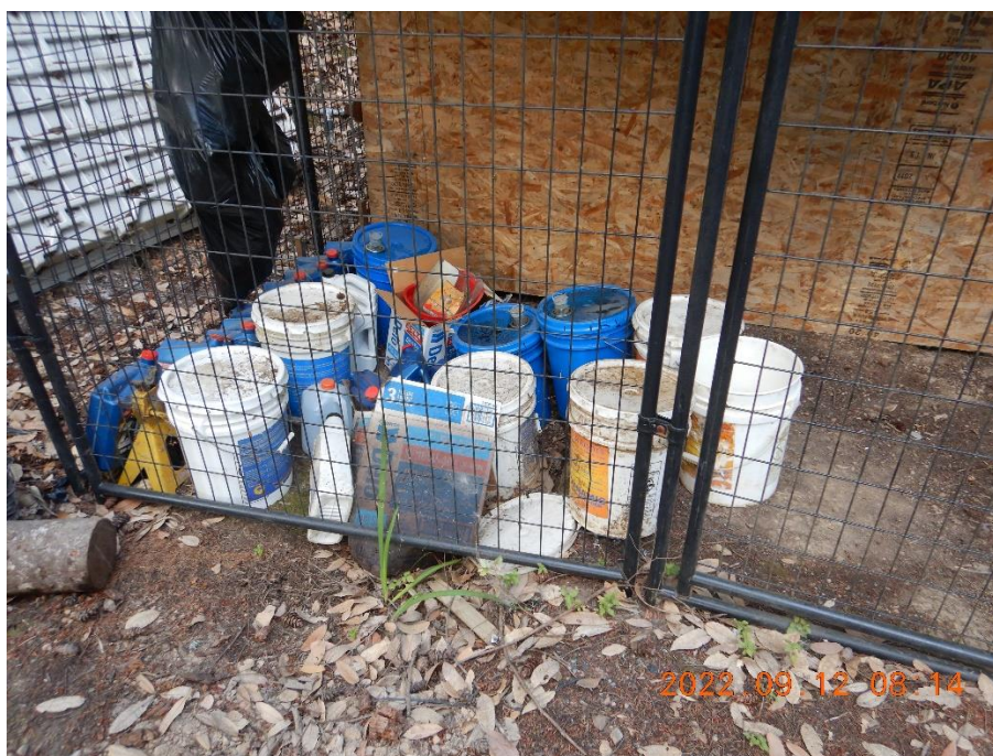
Photo 10—Closer view of the shed pictured in the previous image at WQ5. Petroleum products are being stored without secondary containment.