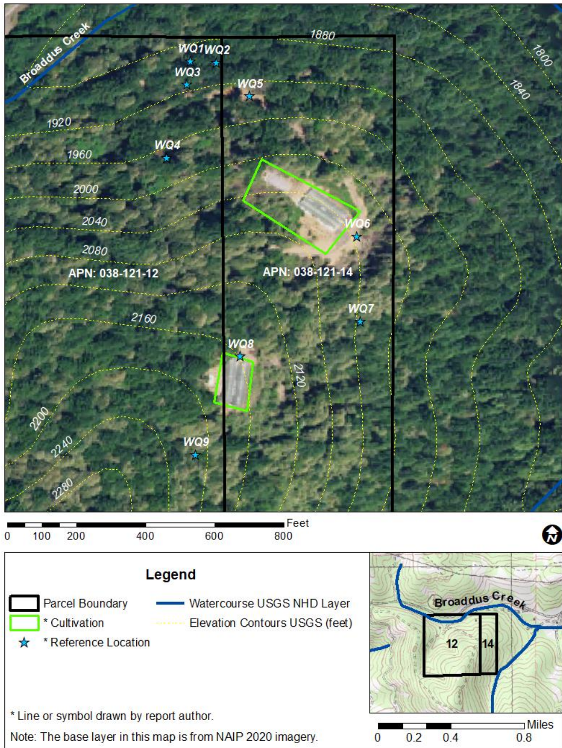
Figure 1: Aerial image/map showing inspection points discussed in this report.