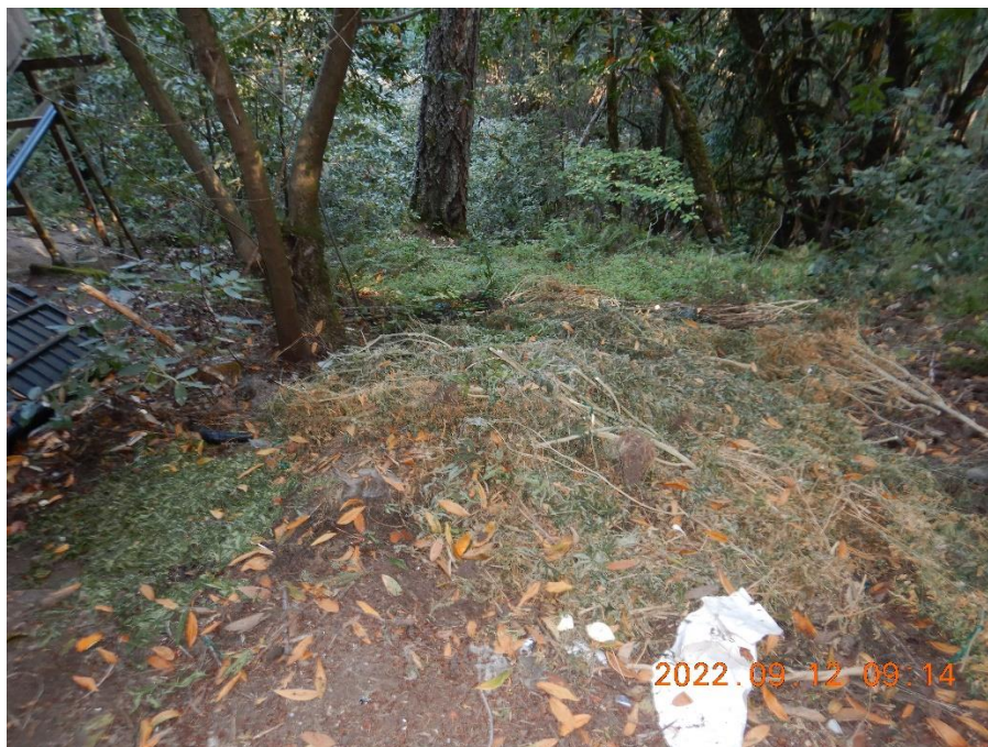
Photo 5—Looking north in the vicinity of WQ2. A pile of cannabis cultivation waste, including plant stalks, covers a 10-foot by 16-foot area on the hillslope south of Broaddus Creek.