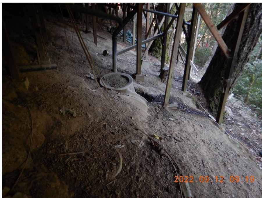
Photo 2—Looking west at WQ1. A partially buried septic tank is visible in the middle of the image.