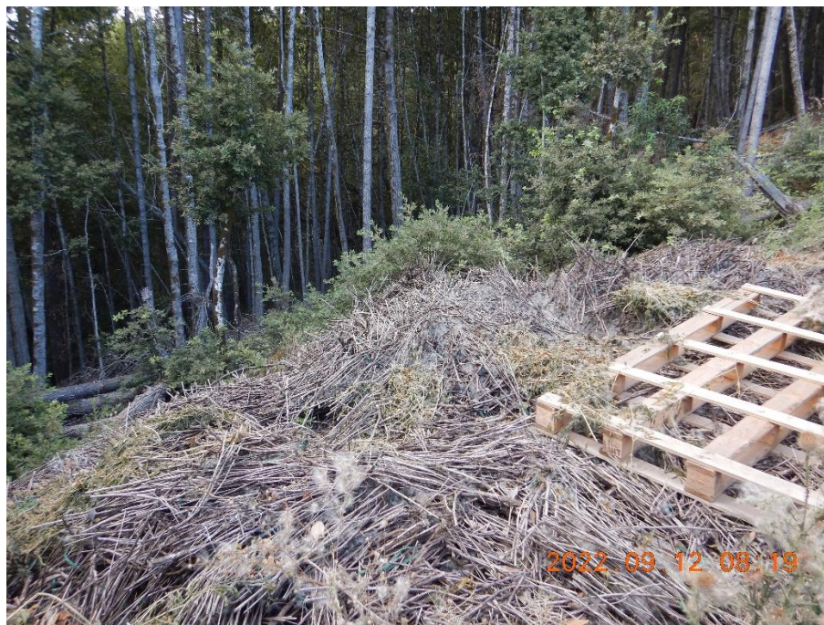
Photo 15—Waste cannabis stalks on the hillside east of the road in the vicinity of WQ6.