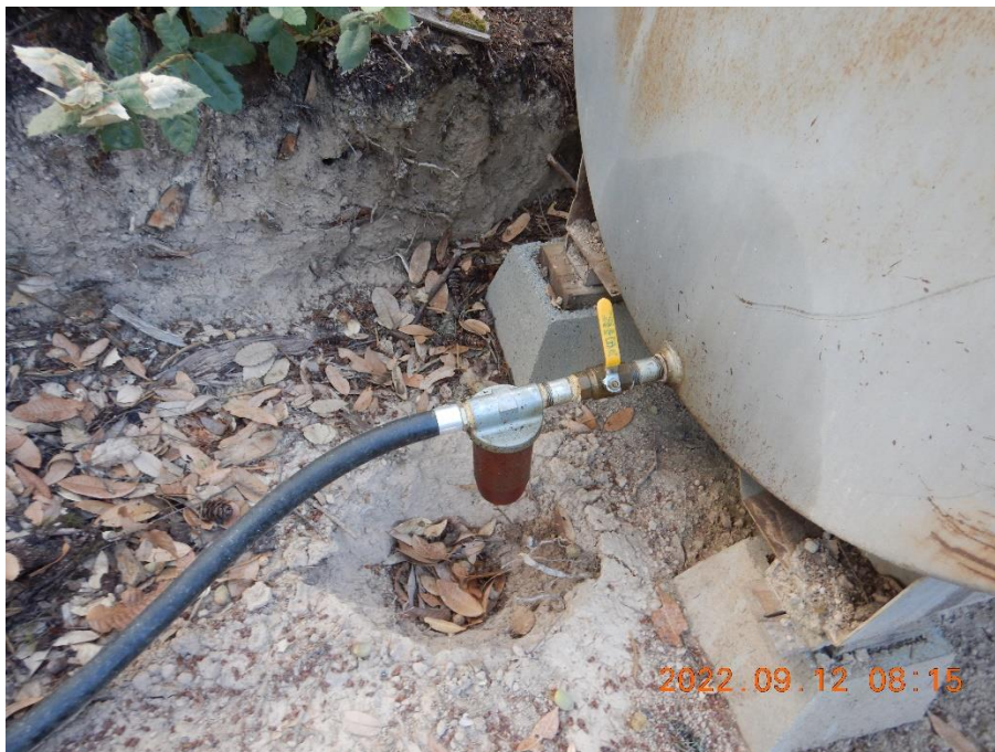
Photo 12—Fuel storage tank pictured in previous image. The fuel tank does not have secondary containment.