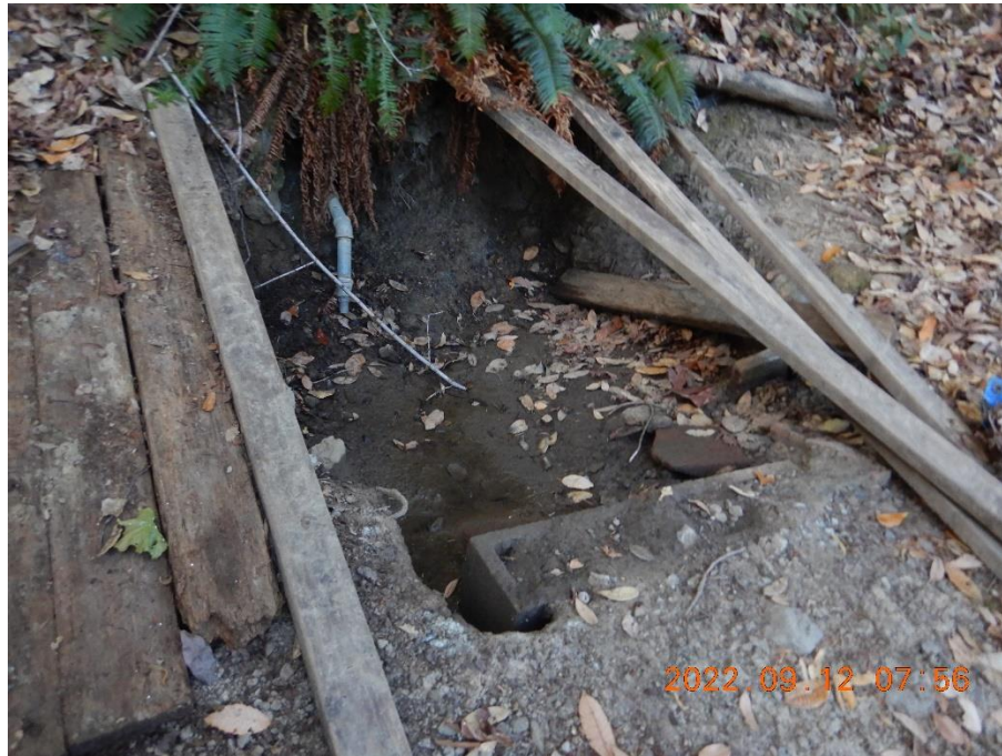
Photo 7—Looking south at WQ4. One of several pits excavated to access shallow groundwater.