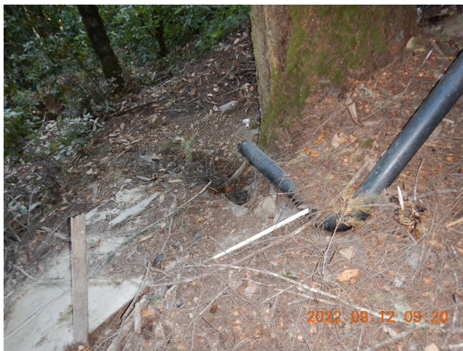
Photo 4—Looking north-east in the vicinity of WQ1. The leaf litter is darker in the middle of the image where a black pipe discharges waste water from the residence.