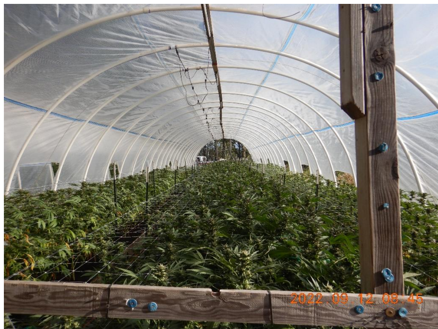
Photo 20—Cannabis plants growing in a hoop-type greenhouse at WQ8.