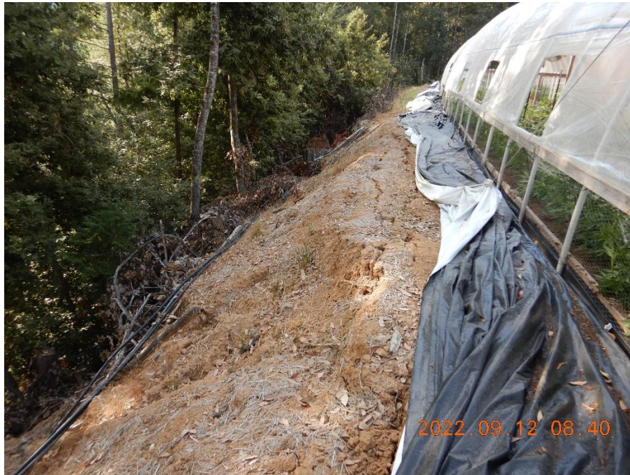
Photo 19—Looking south along the eastern edge of a terraced pad at WQ8. Tension cracks are visible along the top of the slope face and the area of the slope face visible in the bottom middle of the image displays a concave-up shape resulting from a previous slope failure.