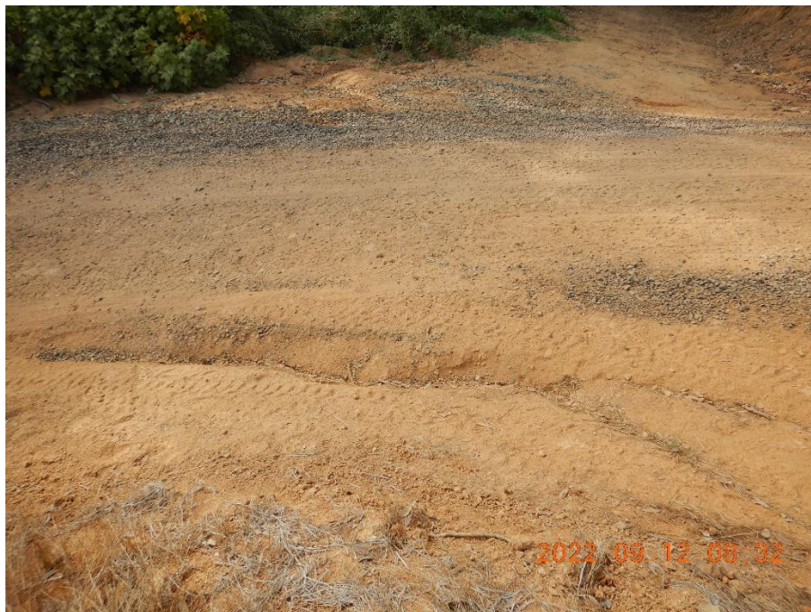
Photo 14—A road in the vicinity of WQ6. Ruts are visible on the road surface.