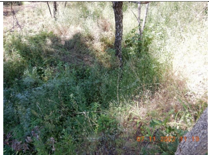
Photo 7: A watercourse nearby a burned structure at inspection point WQ6