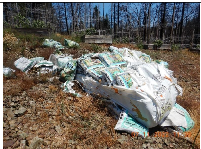
Photo 9: Improperly placed fertilizer at inspection point WQ8, threatening waste delivery to nearby watercourse downstream.