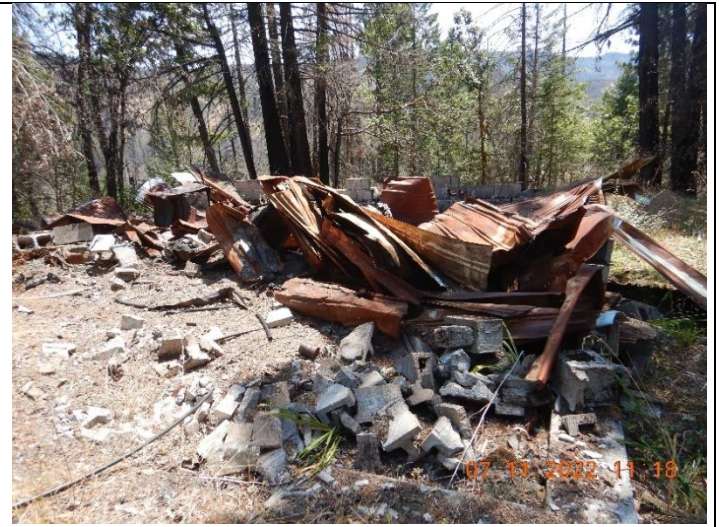
Photo 6: burned structure in the riparian setback of a watercourse at inspection point WQ5