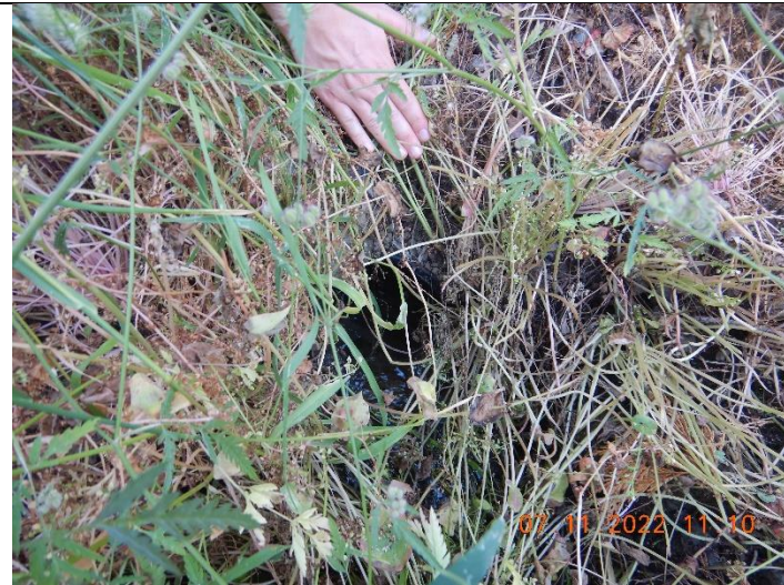
Photo 5: Outlet of a culverted stream crossing at inspection point WQ4