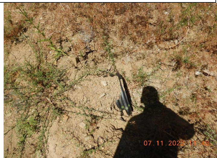
Photo 10: Improperly installed culverted stream crossing at inspection point WQ9, threatening sediment delivery to watercourse downstream.