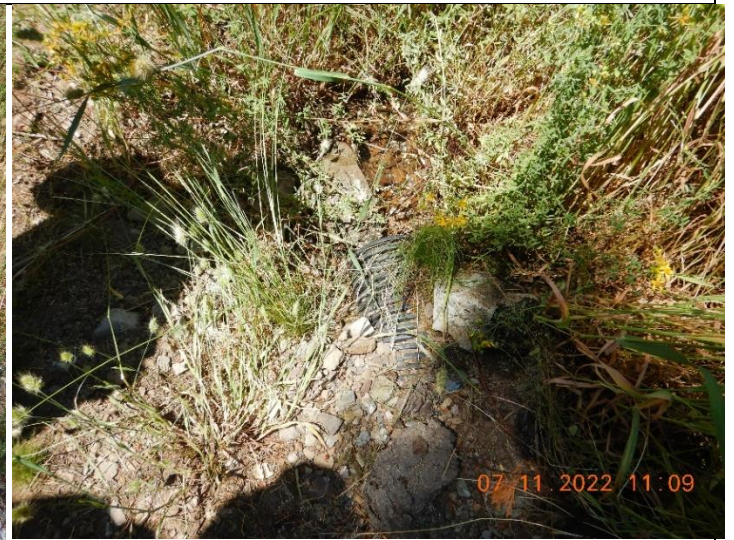
Photo 4: Inlet of a culverted stream crossing at inspection point WQ4