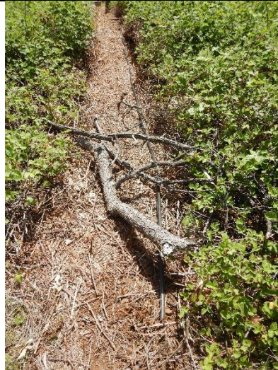
Photo 14: A partially buried water pipe connected to the second water storage tank at WQ10 and potentially diverting water from a spring