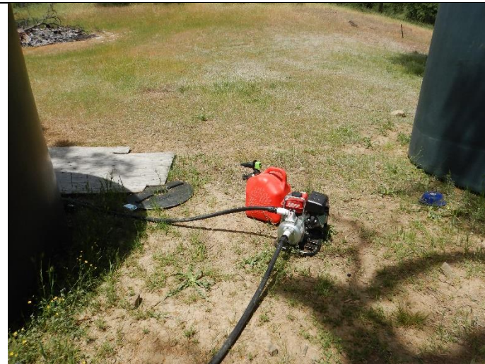
Photo 3: Uncontained gasoline tank pump near water storage tanks at WQ3