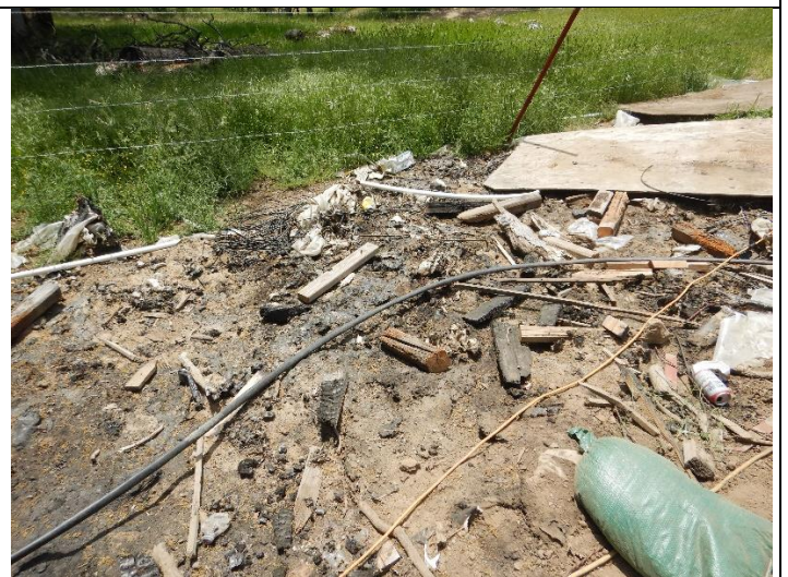
Photo 6: Soil and trash in the vicinity of cultivation area at WQ4