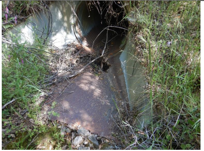
Photo 22: Inlet of a partially rusted culverted watercourse crossing at WQ14