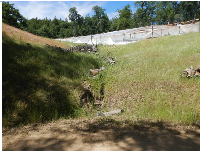
Photo 17: Cultivation area within the riparian setback of the headwaters of a watercourse at WQ11