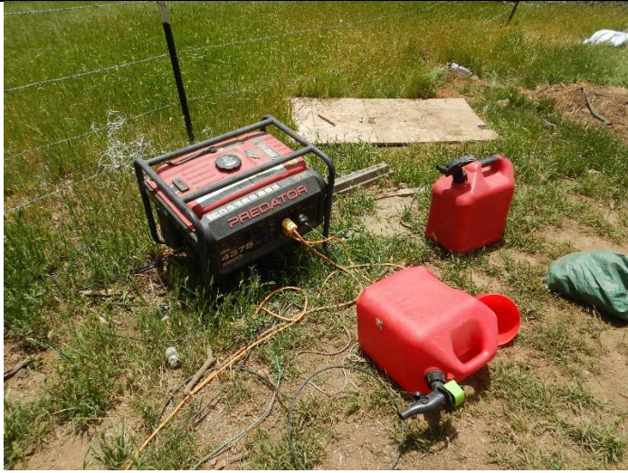
Photo 7: Uncontained gasoline containers, and a generator in the vicinity of cultivation area at WQ4