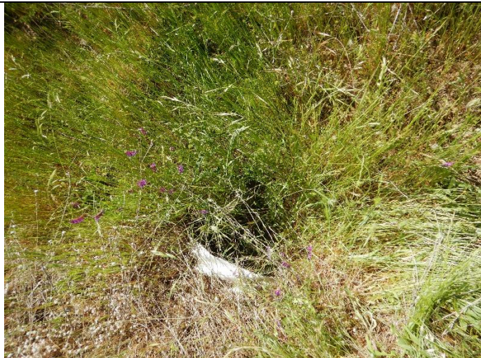
Photo 24: Inlet of a culverted watercourse crossing at WQ15, appears to be functioning well but needs clearing of the vegetation