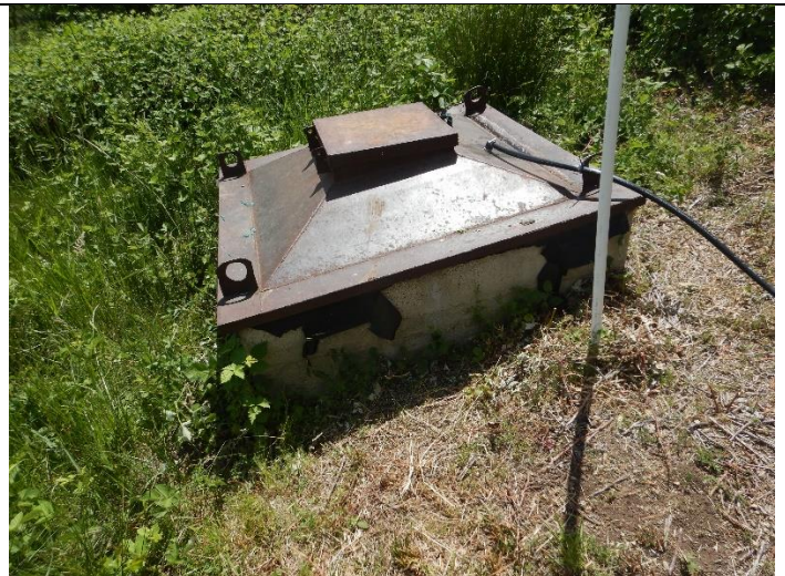
Photo 12: A second water storage structure connected to a water supply pipe in the vicinity of WQ9