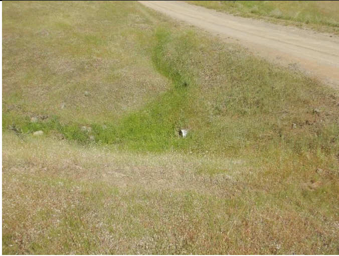
Photo 19: Inlet of a culverted watercourse at WQ12; it appears to be functioning properly