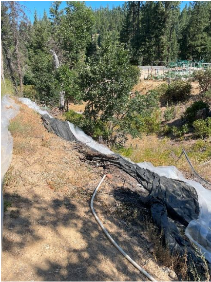
Photo 6: Cultivation related waste and sediment perched above dry stream.