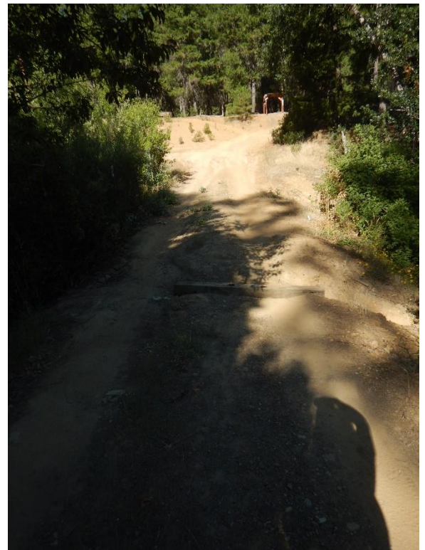
Photos 3 and 4: Onstream pond with plastic tarps and tires in stream and in berm (left). Bare dirt berm/ road prism (right).