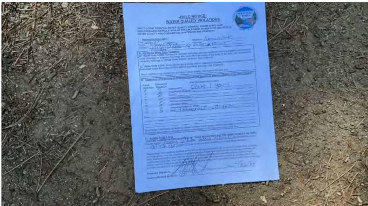
Figure 9. Field Notice I left onsite with case agent. In response, I received a call, as requested, from Johanas Colby.