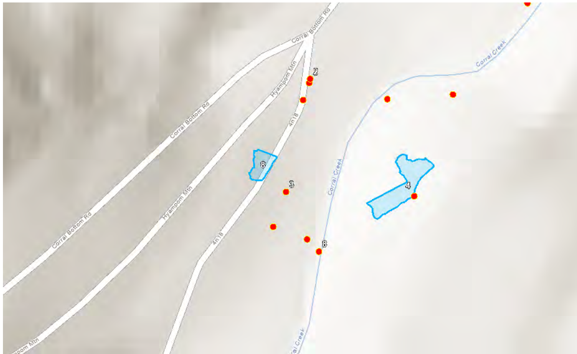
Figure 4 Inspection map with terrain showing features of interest described in the text.