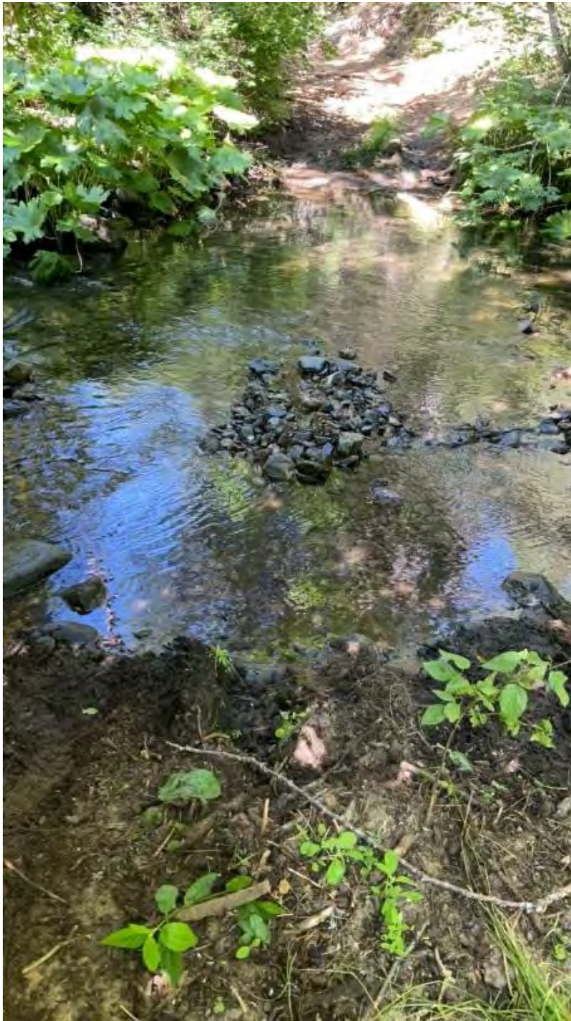
Figure 7. Ford. Both left and right bank road approaches are hydrologically connected with threat of sediment delivery to Corral Creek. The stream banks have been impacted by the road.