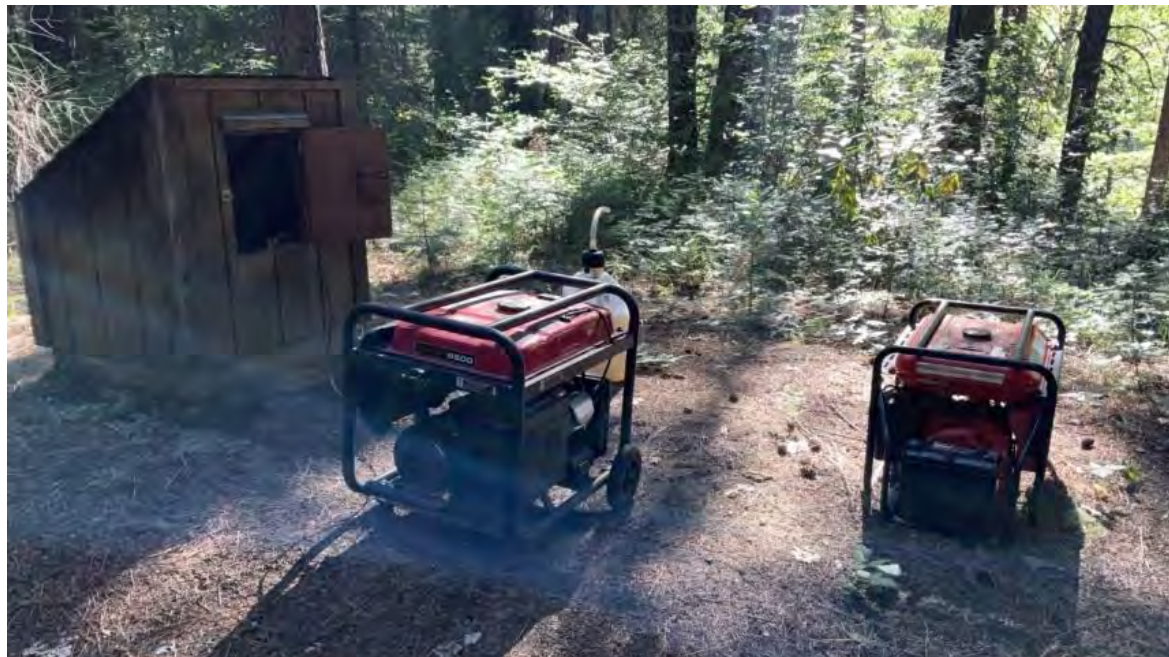
Figure 5. Well and gas pumps.