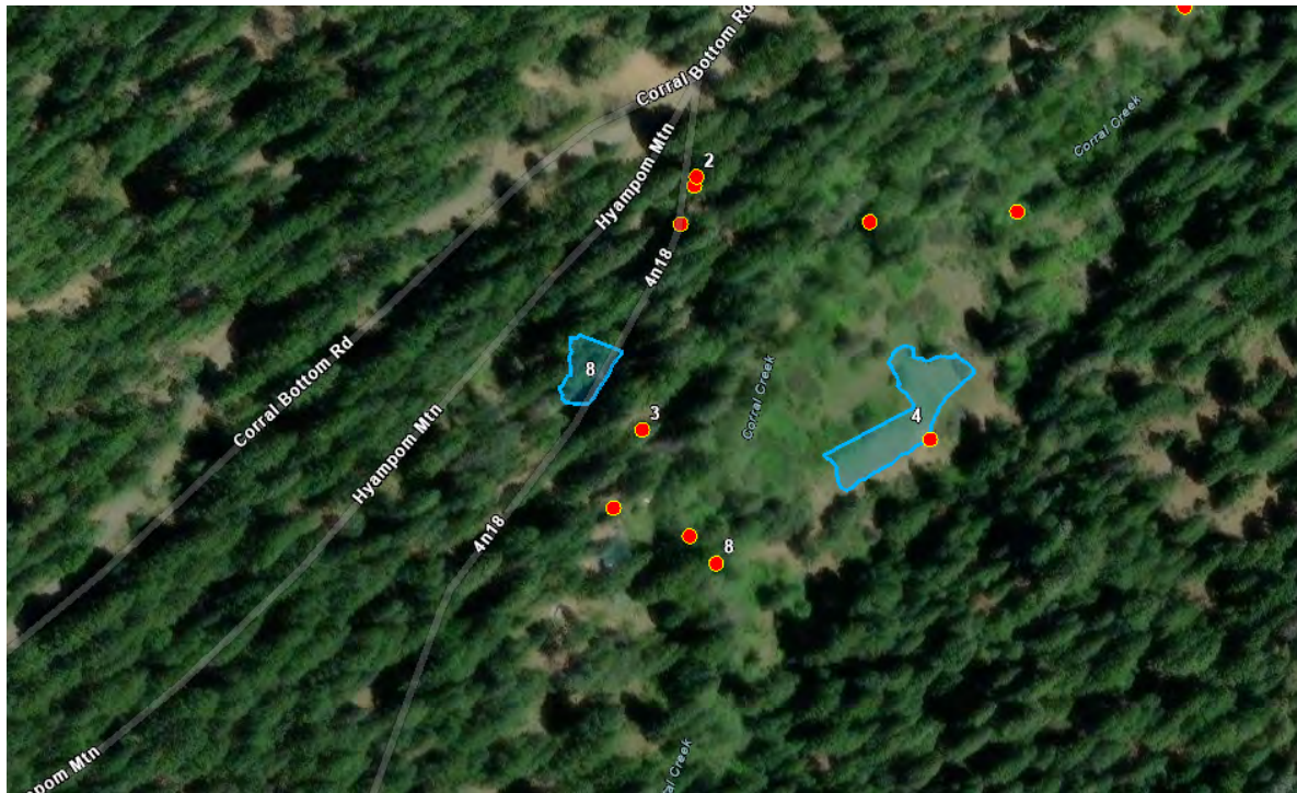
Figure 3. Inspection map with aerial imagery showing the point, line, and polygon feature locations of interest described in the text.