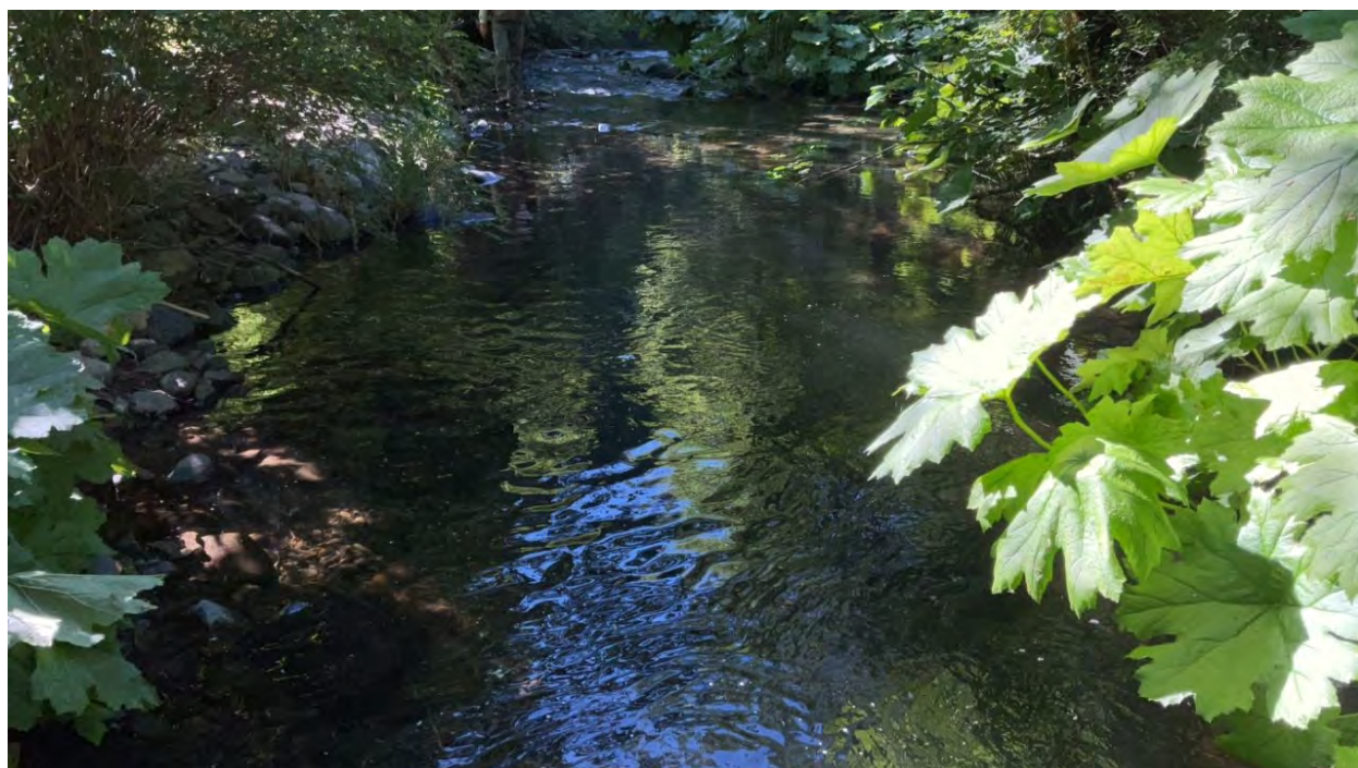
Figure 6. Corral Creek at point of surface water diversion.