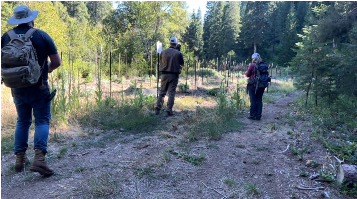
Figure 8. Polygon Feature 4 – outdoor cultivation area accessed via ford.