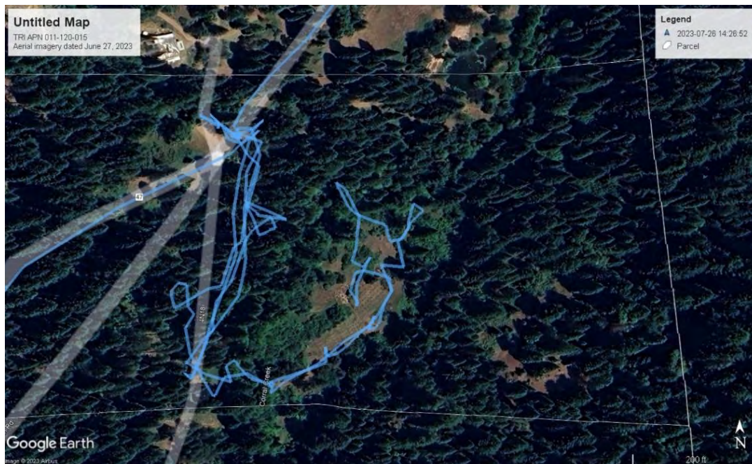
Figure 2. GPS track of my July 26, 2023 inspection route.