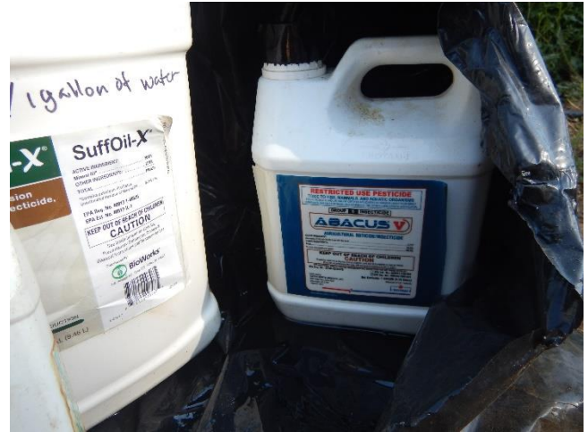
Photo 2 Pesticides including restricted use Abacus.