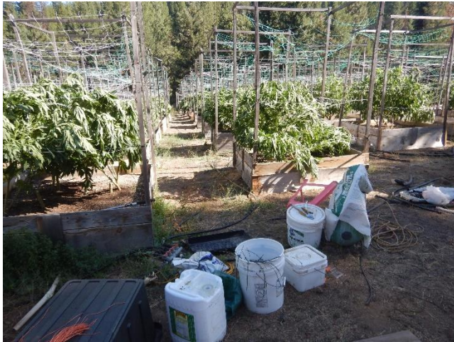
Photo 1 Cannabis plants in raised beds with fertilizer containers.