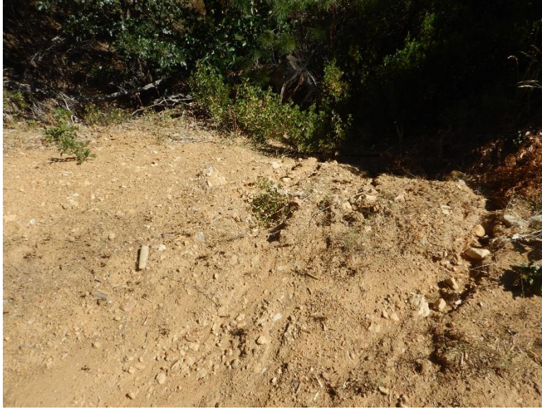
Photo 4 Loose fill from road discharging to stream below.