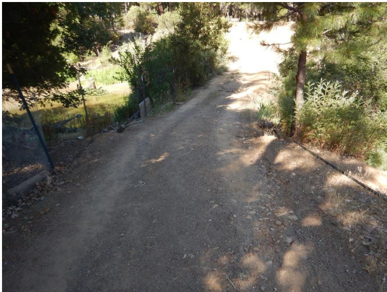
Photo 3 Bare dirt road leading to onstream pond.