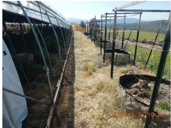
Figure 5. Cultivation area is approximately 5500 square feet, located between WP 1073, 1074 and 1075.