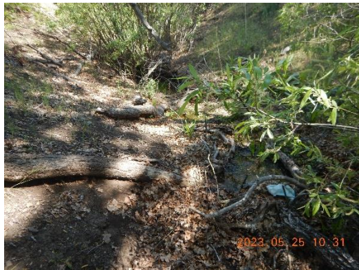
Figure 7. The watercourse looking upstream of stream crossing.