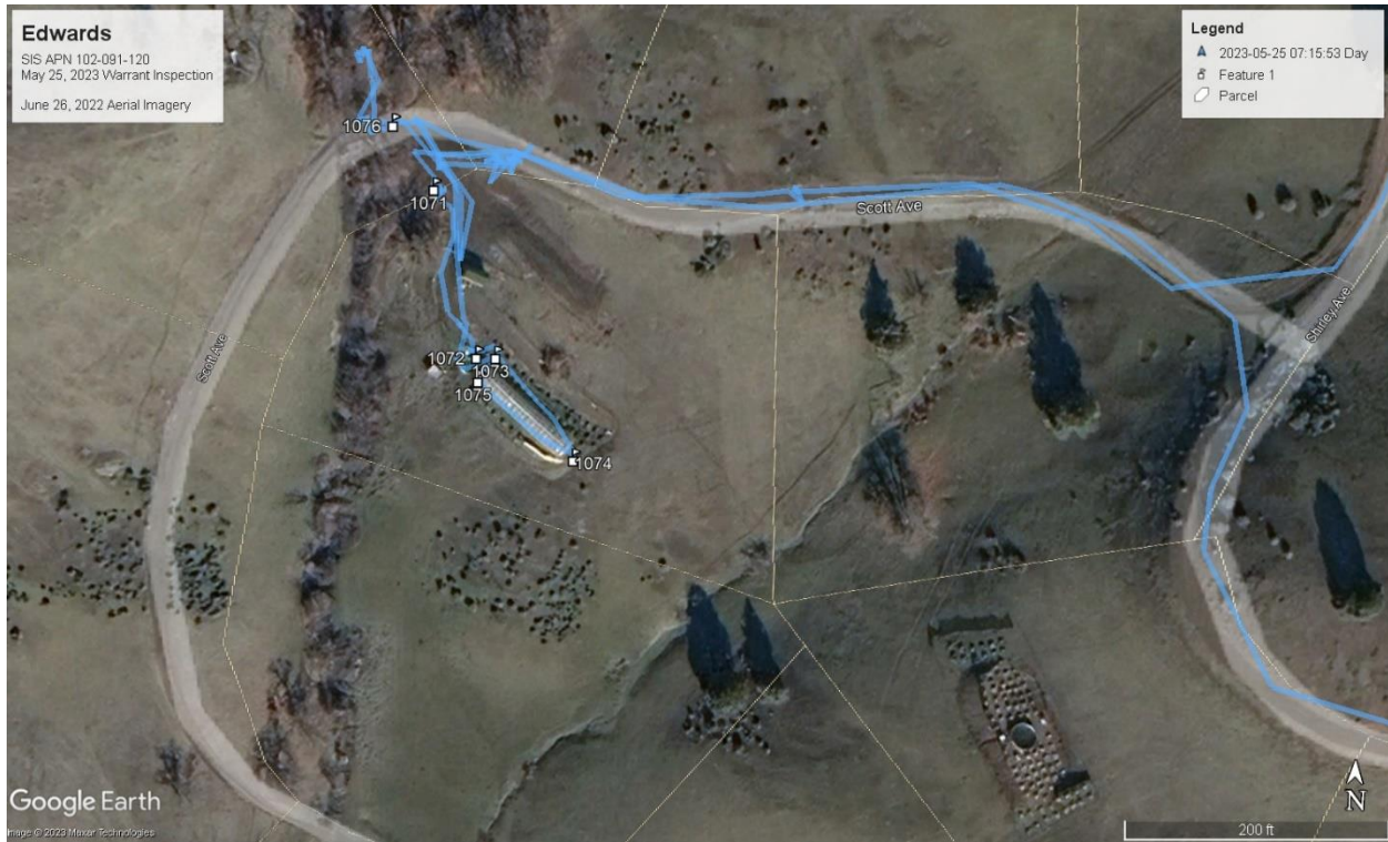
Figure 1. Inspection map of Property