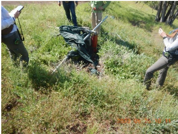
Figure 4. Permitted well located at WP 1071. It is located approximately 40 horizontal feet and 12 vertical feet from the watercourse.