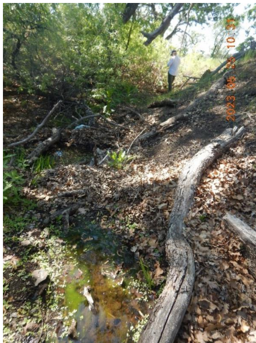
Figure 8. Class II watercourse looking downstream to stream crossing. The crossing at WP 1076. The crossing is comprised of a 24-inch metal culvert and the fill on top of the crossing was approximately 20 feet deep and 30 feet wide. The inlet is partially blocked.