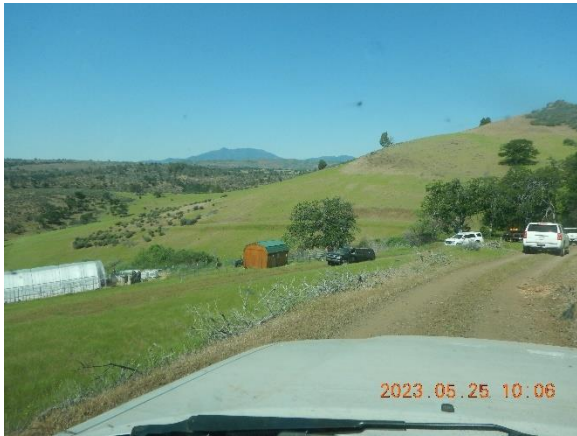
Figure 3. View from driveway to Property.