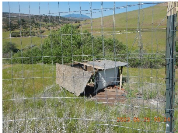
Figure 6. Old pit privy located approximately 50 feet from the Class II watercourse.