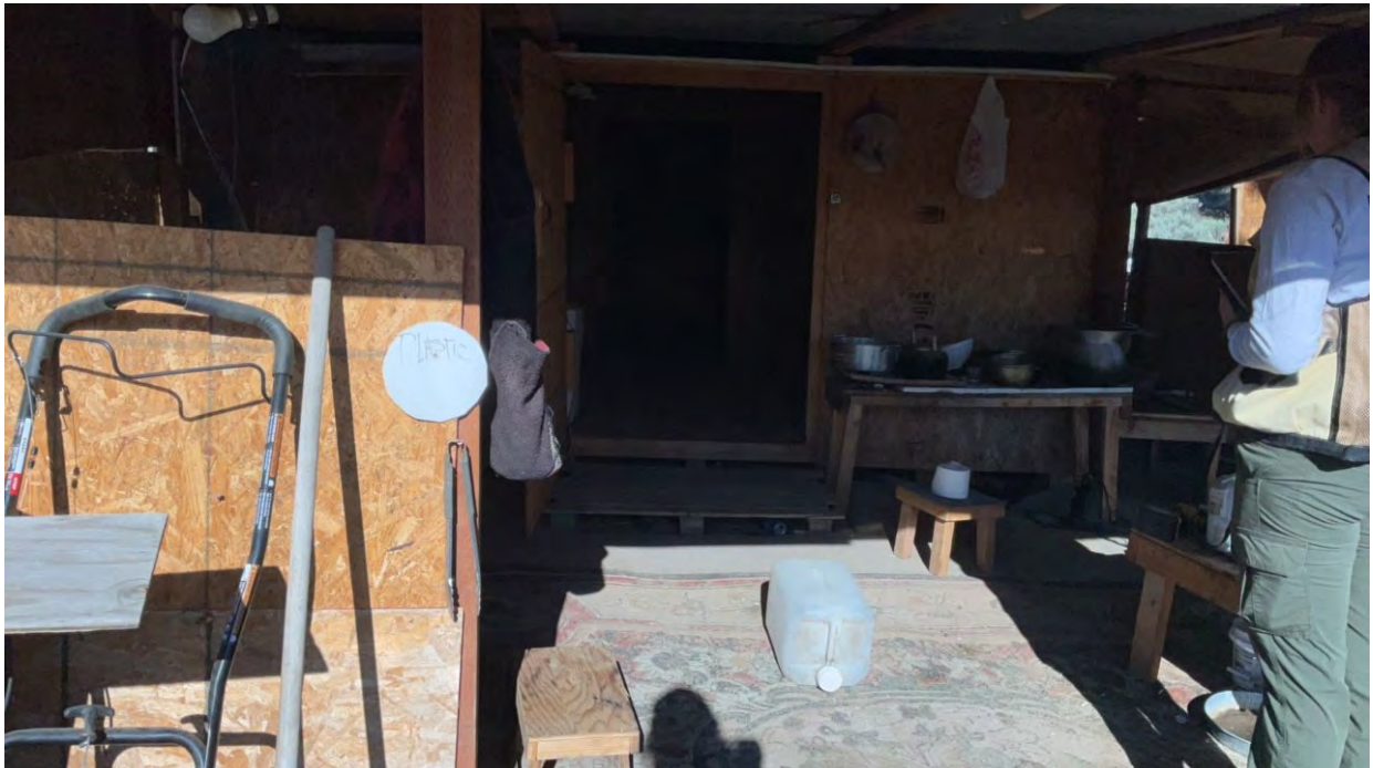
Figure 16. Domestic residence at Point Feature 11.