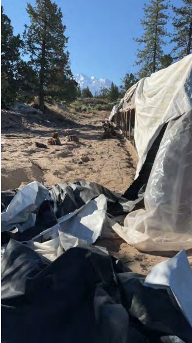
Figure 14. Disturbed area associated with active greenhouse cultivation at Polygon Feature 10.