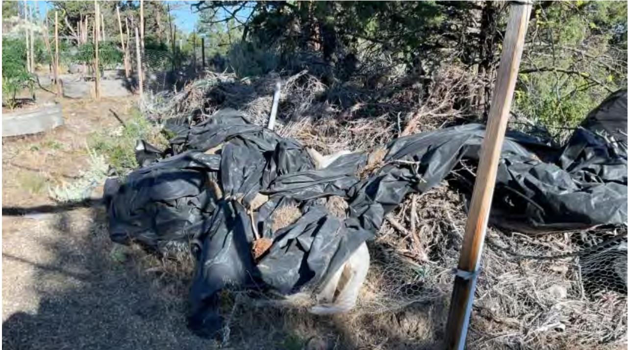
Figure 5. Cultivation-related refuse is comingled with cleared brush around the perimeter of the outdoor grow at Polygon Feature 4.