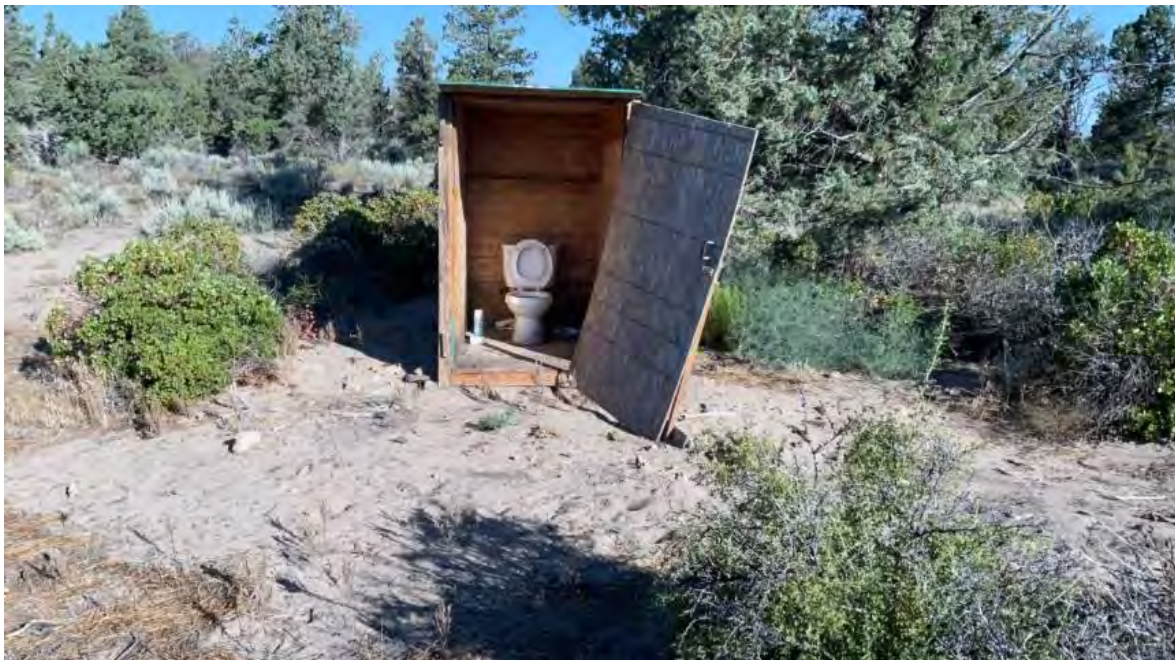
Figure 11. Shed with toilet connected to water tank via hose with human waste discharge to land at Point Feature 9.