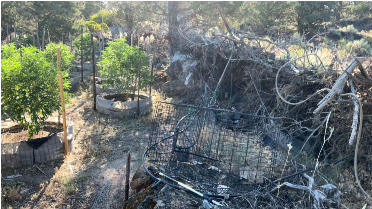
Figure 3. Perimeter of cultivation area at Polygon Feature 1.