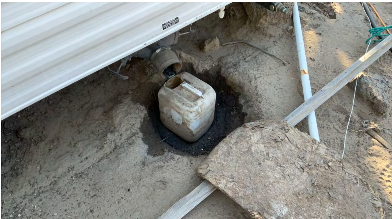
Figure 6. RV effluent with discharge to land at Point Feature 6.