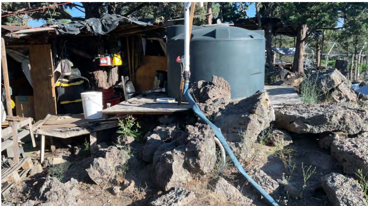
Figure 4. Tank and hookup for truck delivery is located at Point Feature 3.