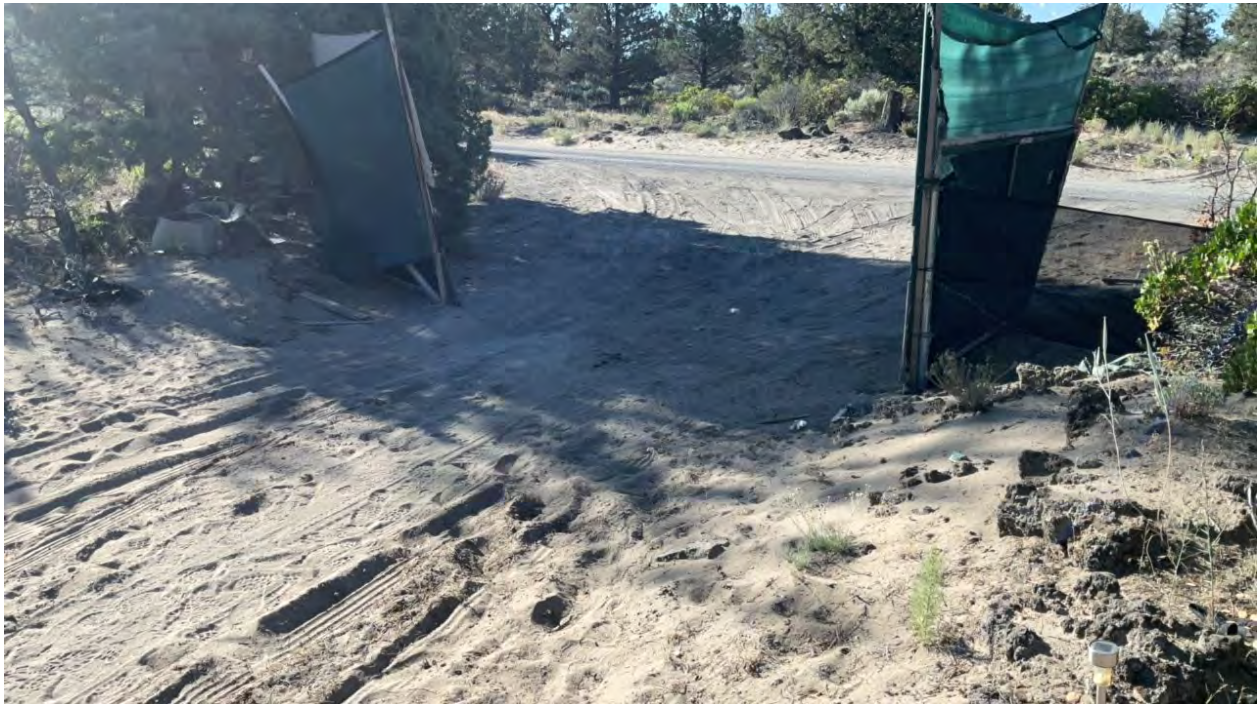
Figure 22. Gate and driveway off of Collins Drive to access cultivation areas at Polygon Features 11, 12 and 13.