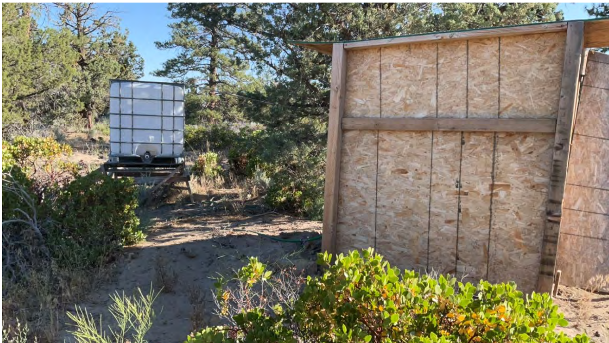
Figure 13. Shed with toilet connected to water tank via hose with human waste discharge to land at Point Feature 9.