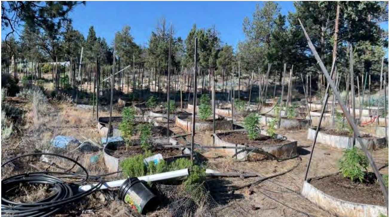
Figure 18. Active outdoor cultivation at Polygon Feature 12.