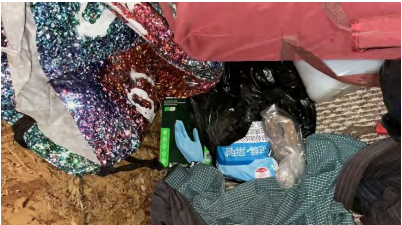
Figure 17. Illegal, imported pesticides located at residence at Point Feature 11.