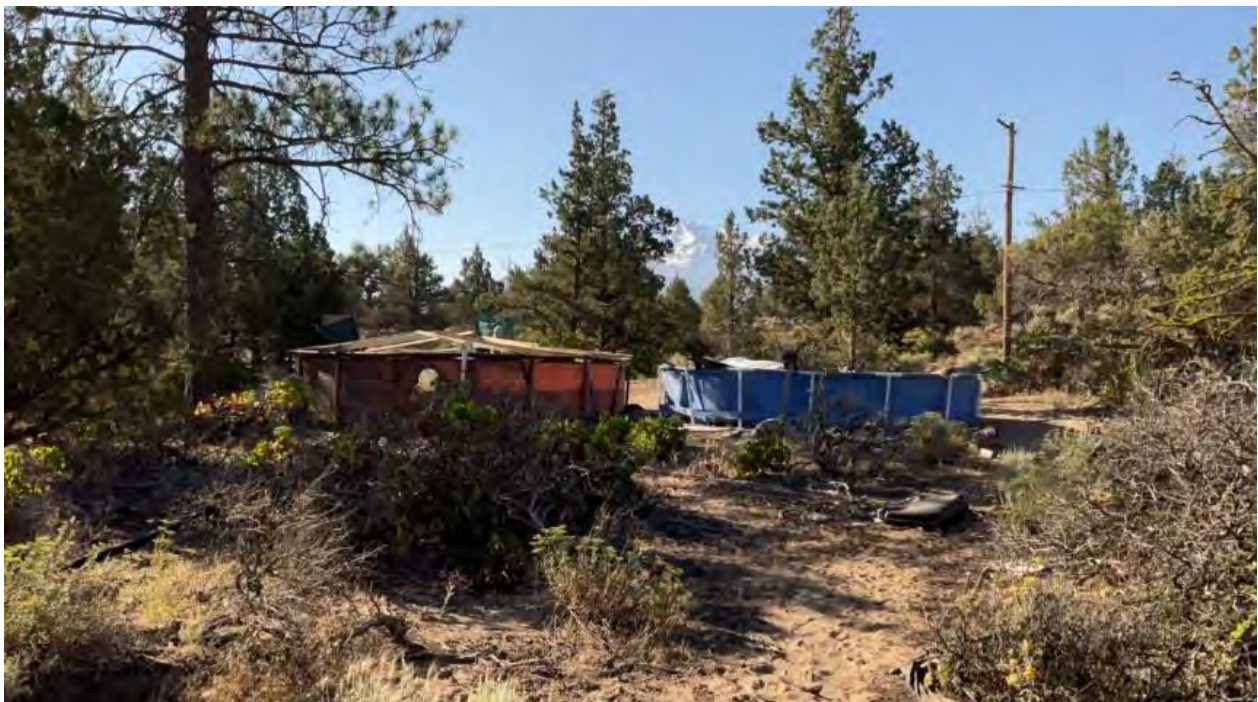
Figure 21. Water storage pools at Point Feature 13.