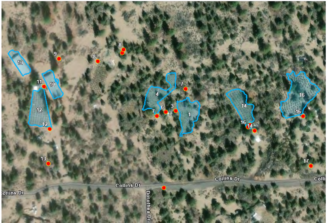
Figure 2. Inspection map.