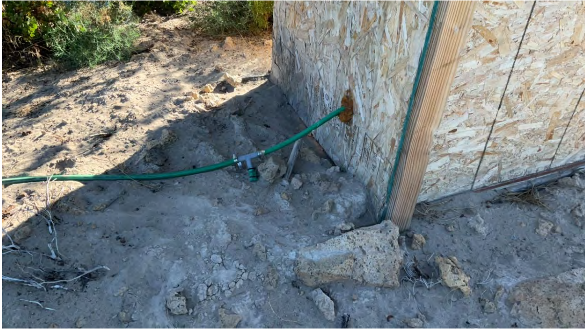
Figure 12. Shed with toilet connected to water tank via hose with human waste discharge to land at Point Feature 9.