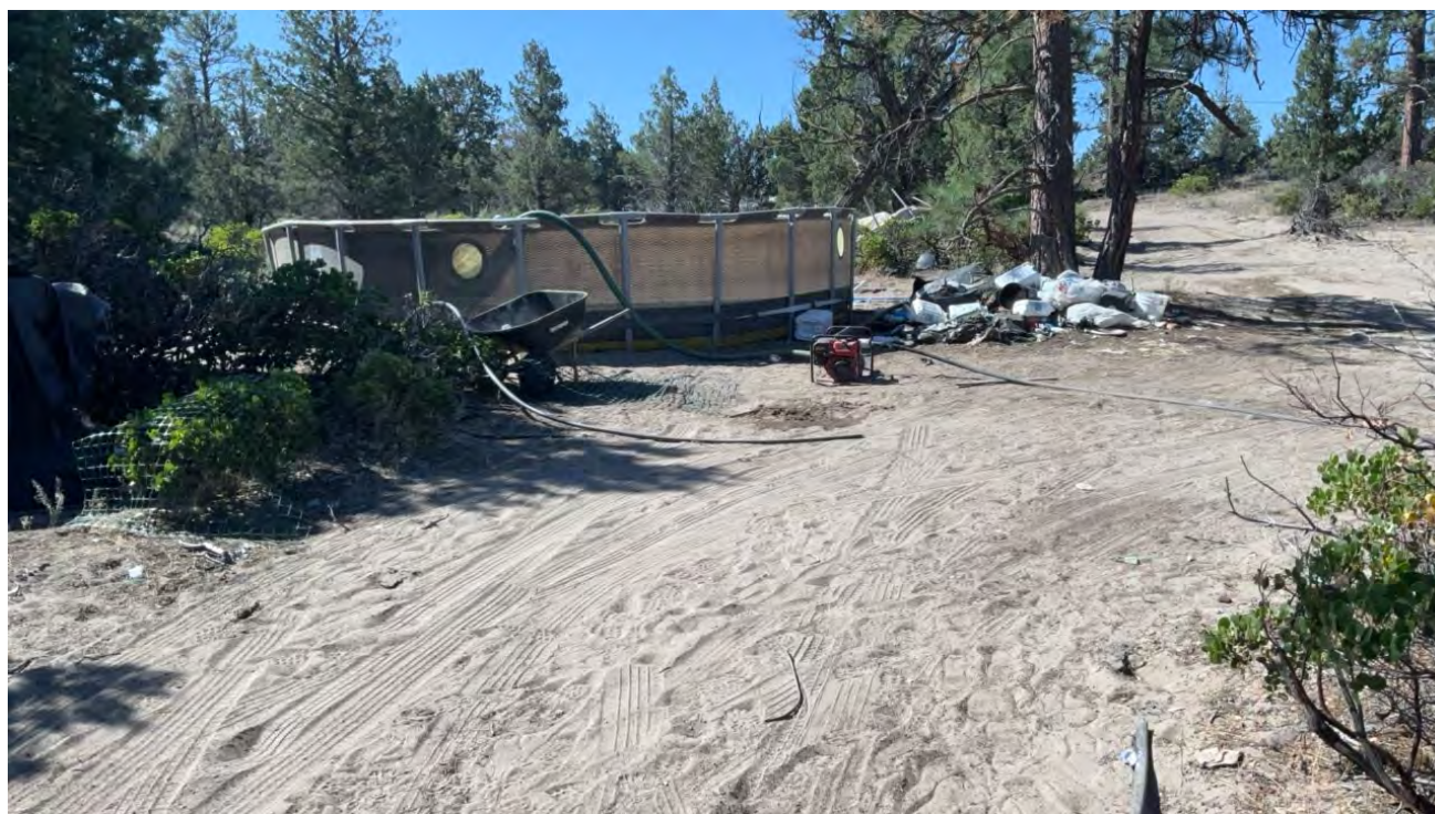
Figure 25. Water storage pool and trash at edge of cultivation area at Polygon Feature 16. A fill hose extends out the driveway to Collins Drive for water truck deliveries.