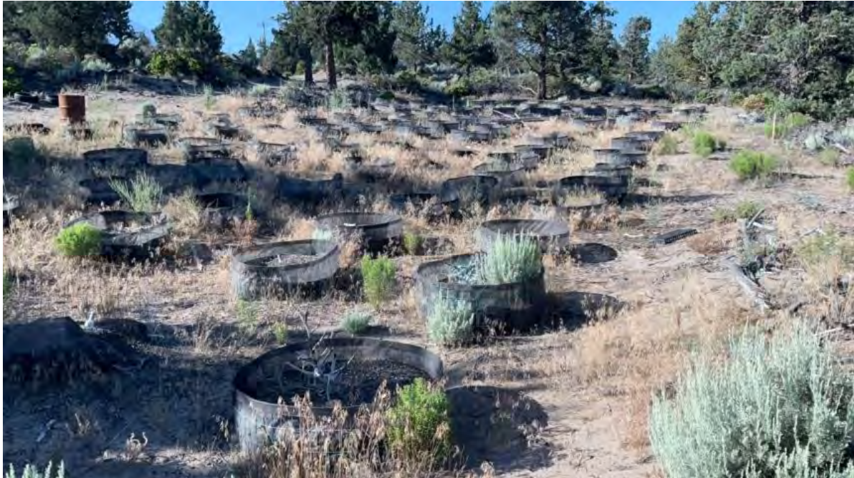
Figure 10. Soil associated with inactive cultivation area at Point Feature 8.