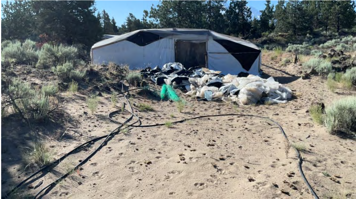
Figure 20. Refuse accumulation near Polygon Feature 13.