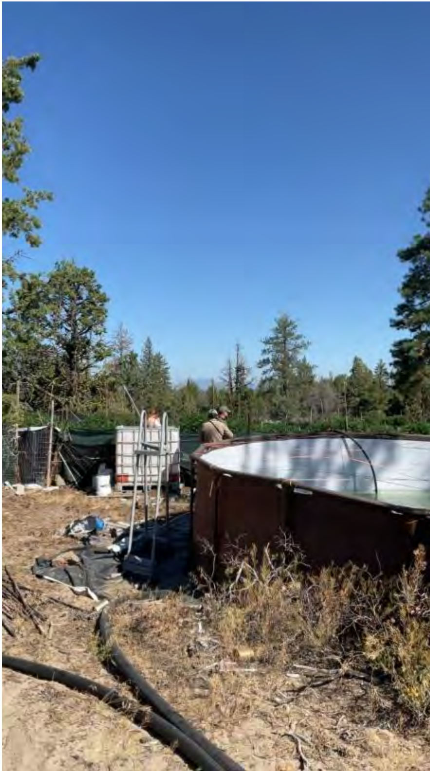
Figure 23. Outdoor cultivation, pool, feed tanks and fertilizers at Polygon Feature 14.