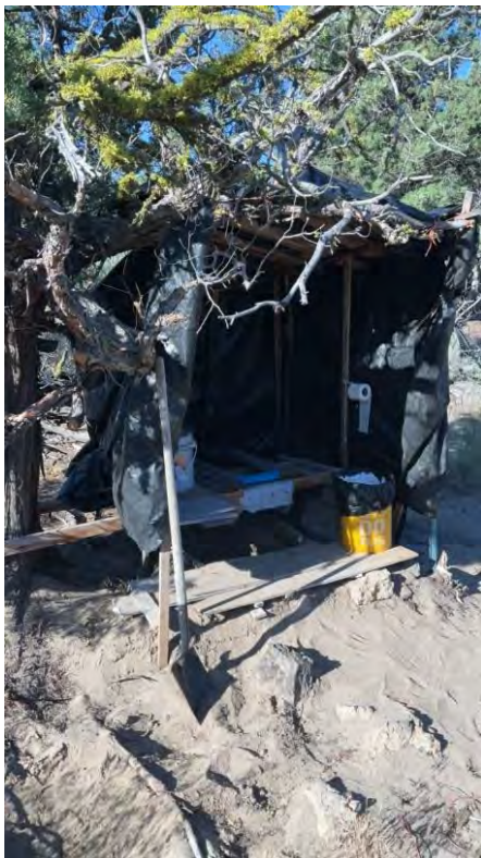
Figure 8. To the north of Polygon Feature 1 cultivation area is a pit privy located at Point Feature 7, with human waste discharge to land.