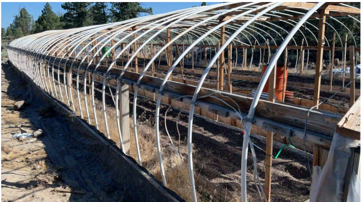
Figure 19. Empty greenhouse at Polygon Feature 13.