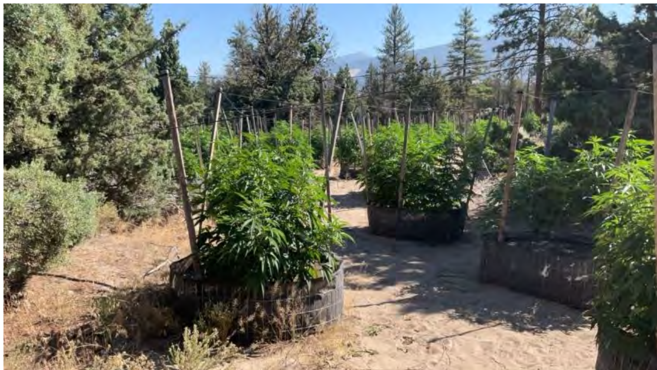
Figure 24. Outdoor cultivation at Polygon Feature 16.