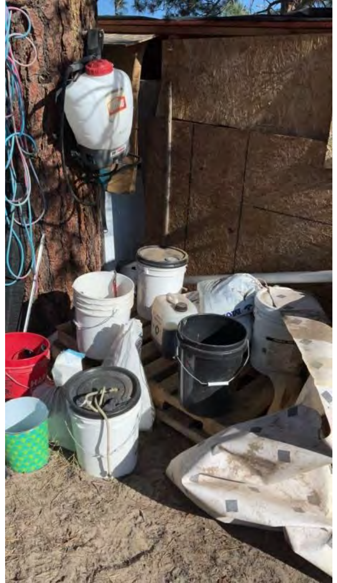
Figure 15. Spray pack located at residential building at Point Feature 11.