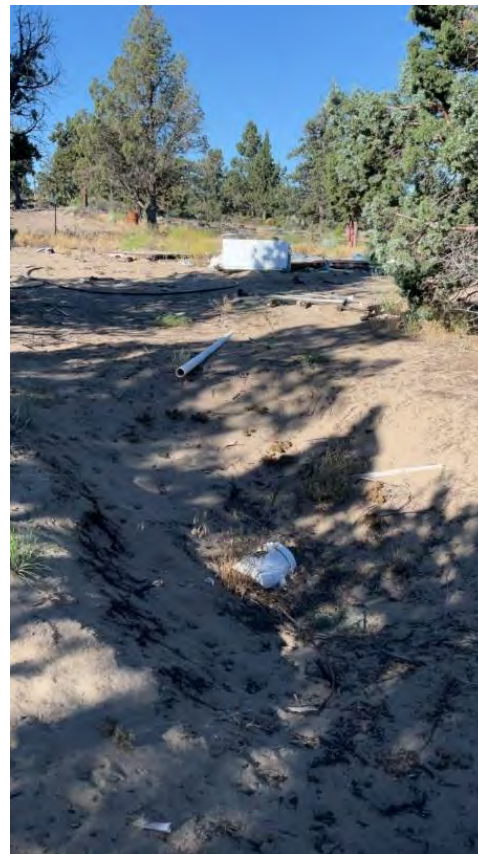
Figure 9. Refuse and pipe at Point Feature 8.