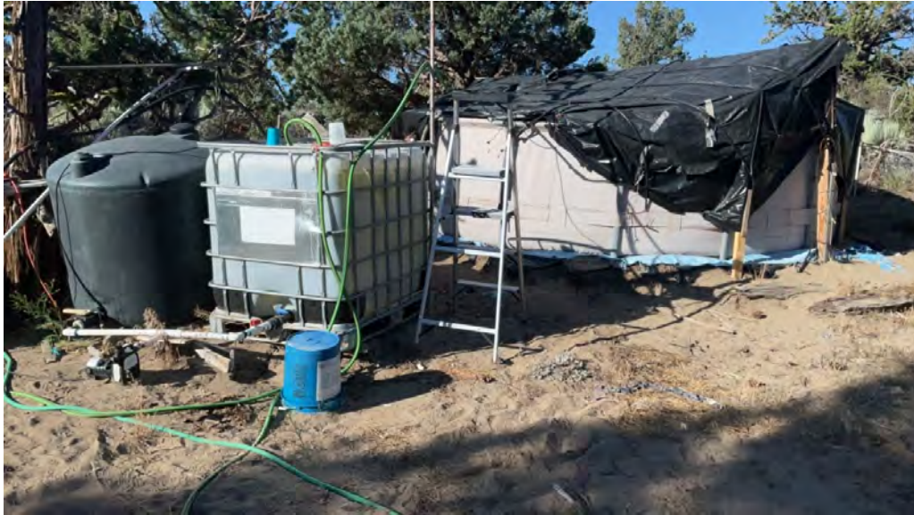
Figure 7. Water storage pool with fill hose from the driveway, feed tanks, and uncontained fertilizer containers are located at Point Feature 7.